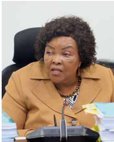
Senator Agnes Muthama