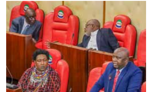
Senator Godfrey Osotsi