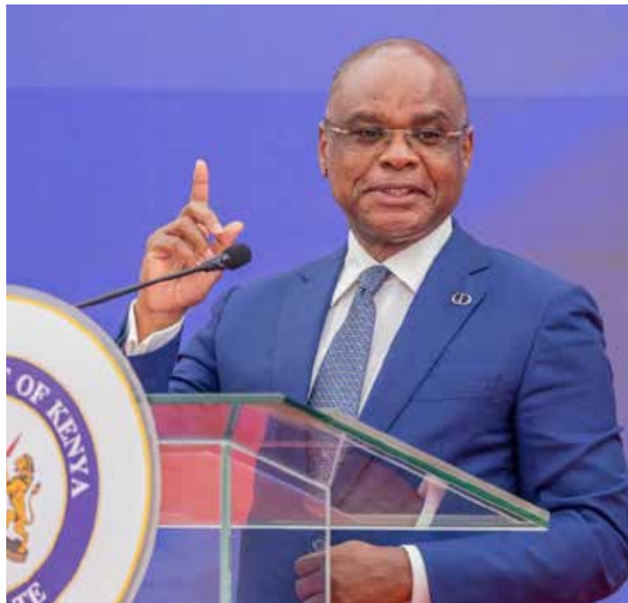
Speaker Amason Kingi

The report states that the impeachment process provided for under Article 181 of the Constitution, as further enumerated in Section 33 of the County