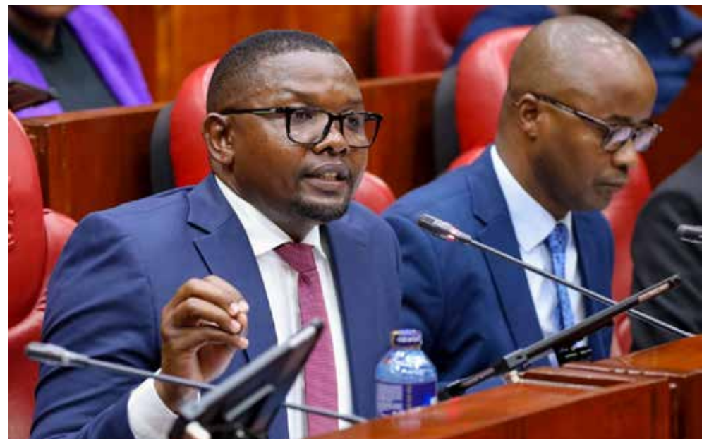
Governor Isaac Mutuma

He further defended the county’s payment history, noting that legal hurdles had previously blocked disbursements. “The moment the orders were vacated, they paid Sh200 million,” Senator Khalwale argued, insisting that the current stalemate is driven more by politics than by refusal to pay.