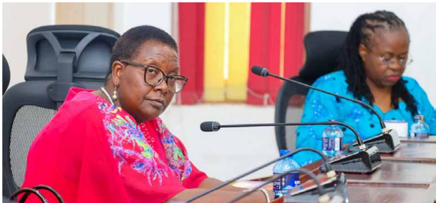
Senator Peris Tobiko.

He added that while governors may express commitment to devolution, implementation at the executive level often falls short, with letters to the County Secretary going unanswered and munic-