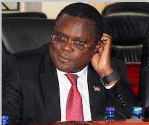
Speaker Kenneth Lusaka:

Speaker Kenneth Lusaka presented to the House a Petition by 48 residents of West Pokot County, concerning alleged deteriorating healthcare services in the county. In the Petition, the 48 individuals said there had been rampant theft of key healthcare instruments and equipment at Kapenguria County Referral Hospital. The latest being that of an ultra-sound machine, without adequate measures being put in place to address the matter. The Deputy Governor also serves as the County Executive Committee Member in charge of Health, which the petitioners state has denied the healthcare department the attention it requires. “The recruitment of healthcare workers in the county has been carried out on the basis of political affiliations and not on merit or competency, thus compromising the quality of services offered,” they said in the Petition, adding that there has been undue harassment, as well as irregular transfers and demotions of healthcare staff deemed to be loyal to the former county governor. The petitioners pleaded with the Senate to investigate the matter and make appropriate recommendations. Among the proposals made by the petitioners are for the Senate to direct that a forensic audit be carried out on the medical equipment acquired by the county and its current status, as well as a human resource audit and job evaluation of all healthcare workers in the county.