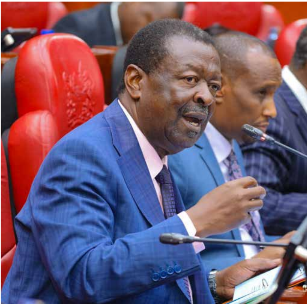
Prime Cabinet Secretary Musalia Mudavadi before the Senate National Security Committee to discuss the case of Kenyans trapped in the Russia-Ukraine war.