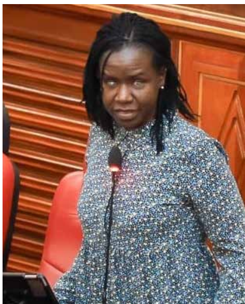
Senator Crystal Asige