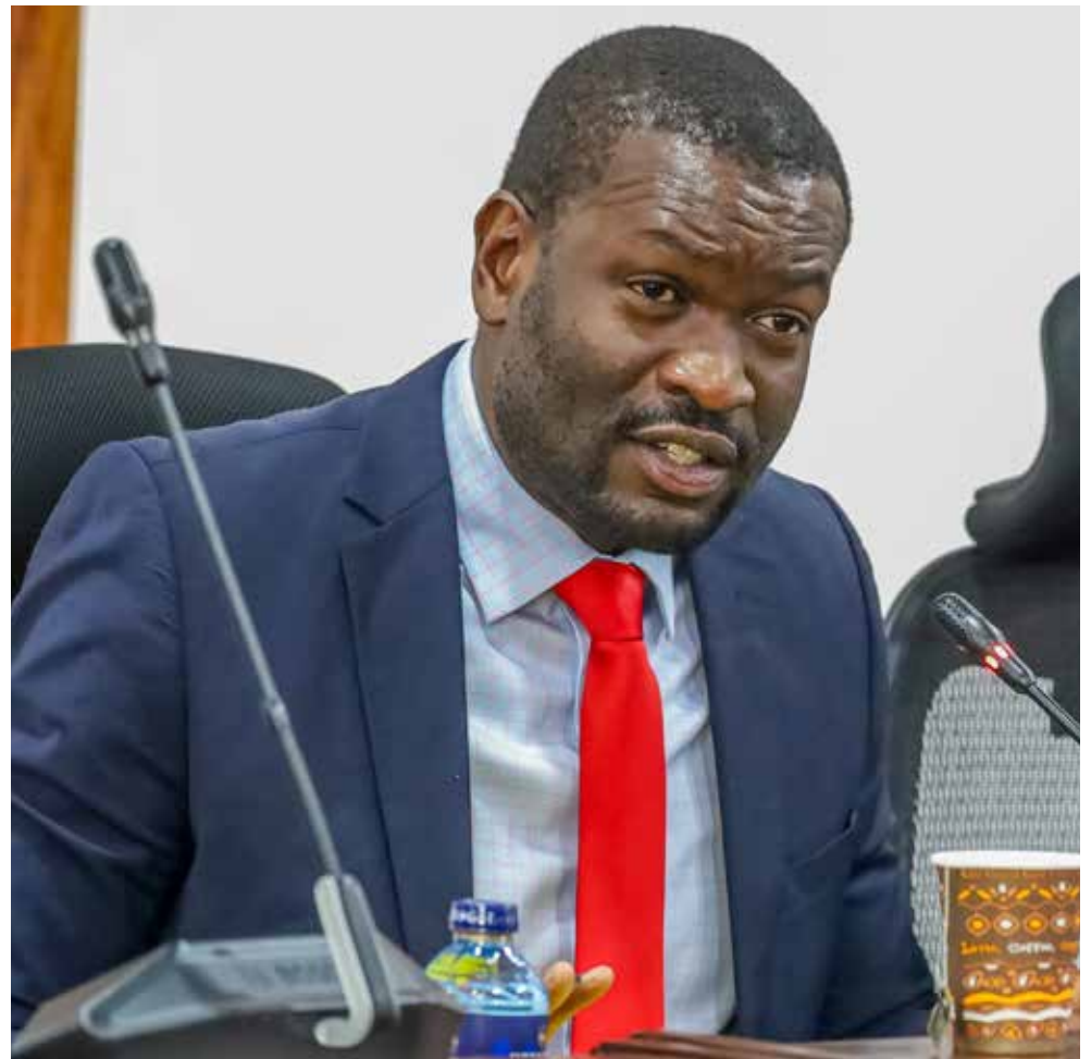
Senator Edwin Sifuna

Families of Kenyans enlisted to fight in the Russia-Ukraine war have asked the national Government to intervene, secure their release, and ensure they are repatriated home.