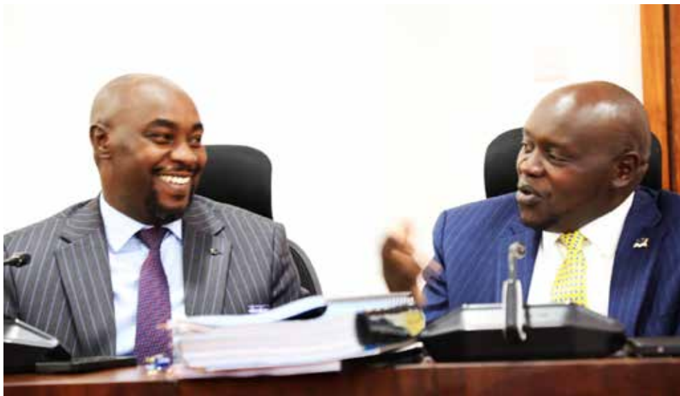
Senator Enock Wambua