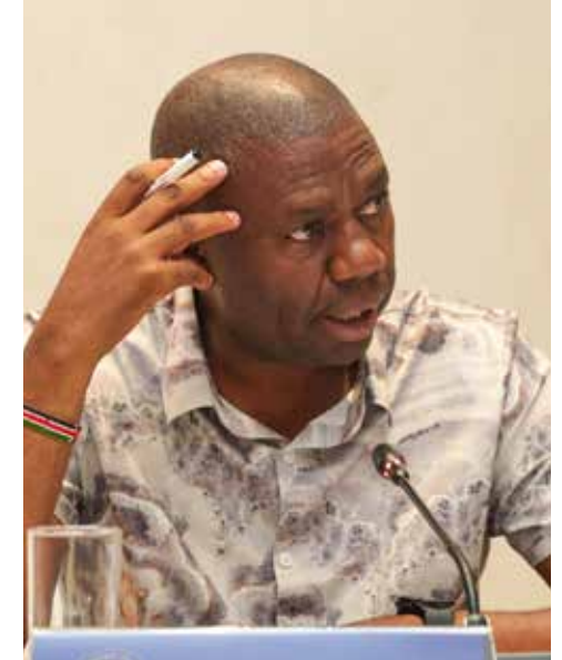
Senator John Kinyua

Senators are expressing concern over the shortage of special needs education teachers in public schools, warning that the crisis is undermining inclusive learning and denying thousands of learners with disabilities their constitutional right to education.