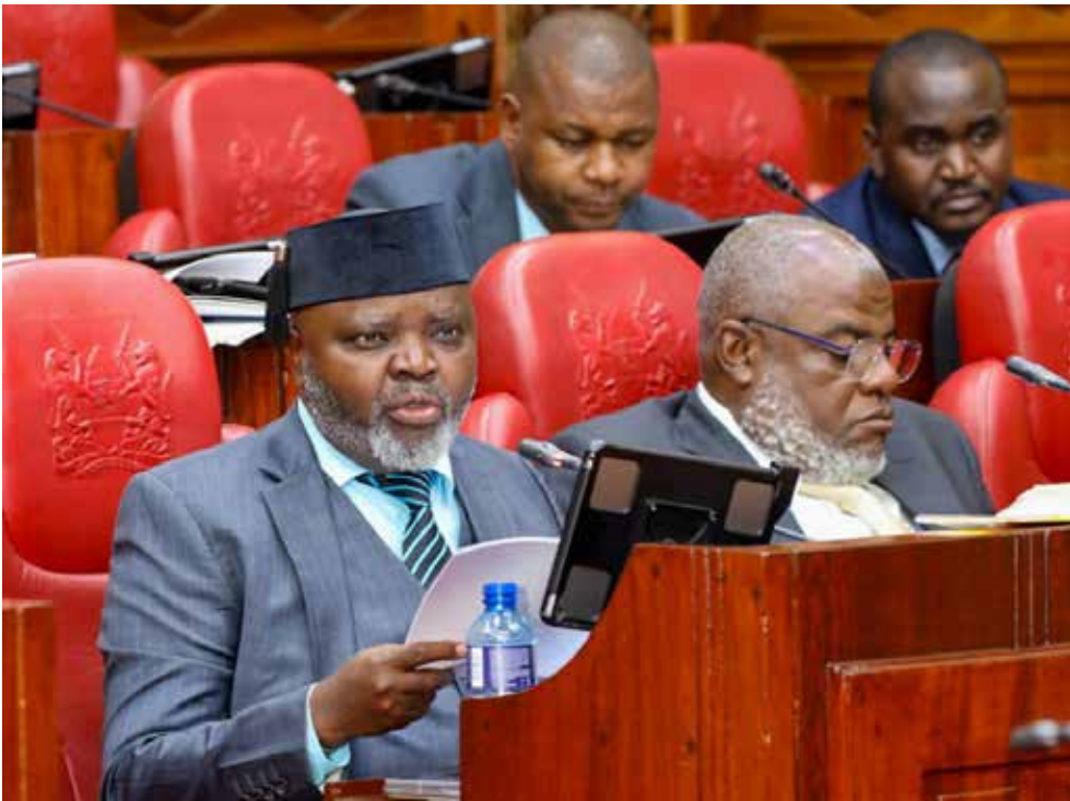
Senator Kathuri Murungi

The Senate has launched an inquiry into the decision by the National Treasury to freeze funds for Meru County. The move comes against the backdrop of what lawmakers term a radical administrative action by the National Treasury to punish the county for a mistake that is not theirs.