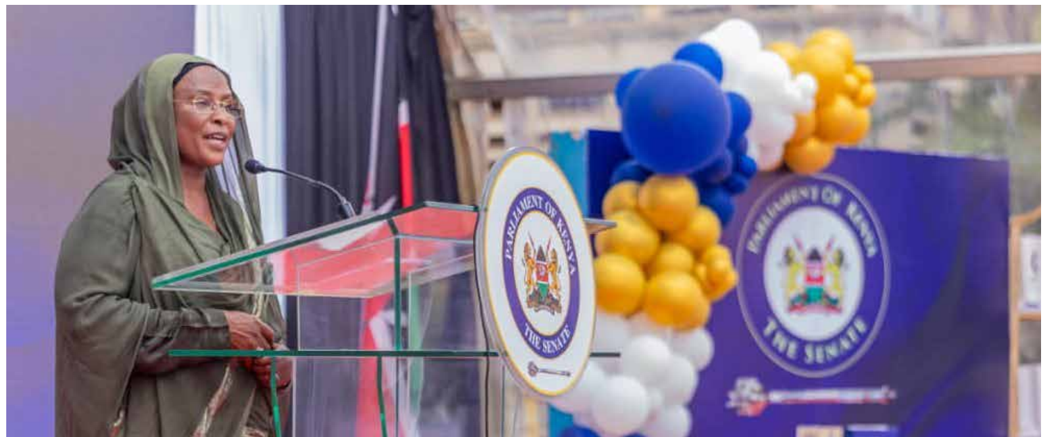
Senator Fatuma Dullo speaks at the event.

“This creates disproportionate representation from either House when the Committee sits,” says the report, even