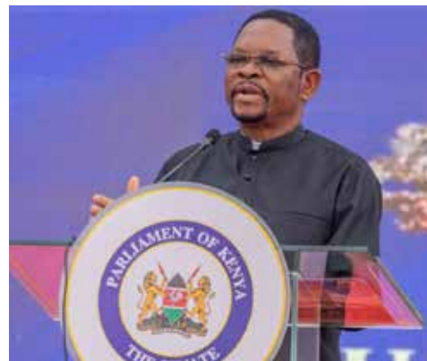
Minority Leader Stewart Madzayo

In 2020, the County Executive of Nairobi City County transferred some of its