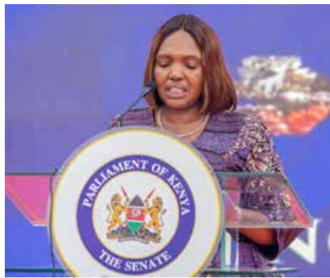
Deputy Majority Leader Tabitha Keroche

“The publication is of interest to parliamentary practitioners in Kenya as well as scholars in public finance, as it seeks to serve as a focal point for Senate procedures on the subject. It may also inform further research and analysis with