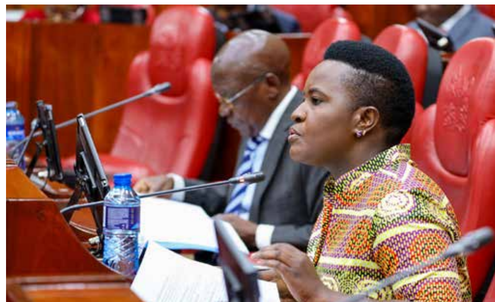
Senator Esther Okenyuri

The Senator wants the committee to provide a detailed list of all institutions registered and accredited by the Technical and Vocational Education and Training Authority (TVETA), including their accreditation status and approved