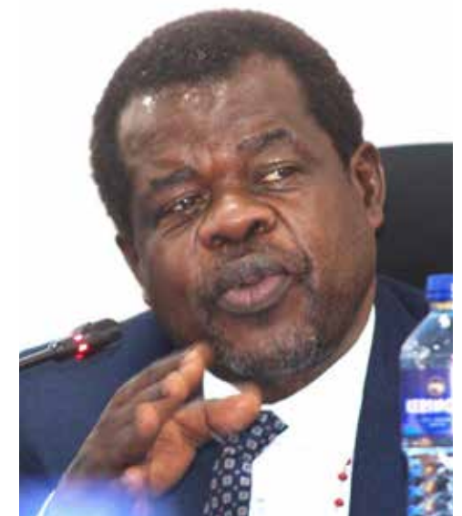
Senator Okiya Omtatah

conducting training and awarding certificates to students? Where does the fate of the many staff members, graduates and learners lie at the moment?” she posed.