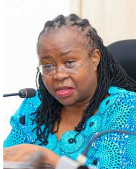
Senator Catherine Mumma