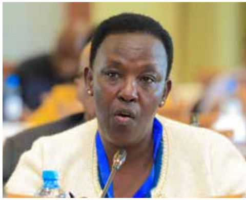
Senator Beatrice Ogola