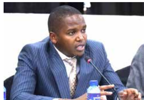
Senator Allan Chesang

Additionally, the senator urged the Committee to outline policy, regulatory and collaborative measures under consideration both nationally and through regional and international bodies such as the East African Community (EAC) and the African Union (AU) to promote fair and sustainable monetisation opportuni-