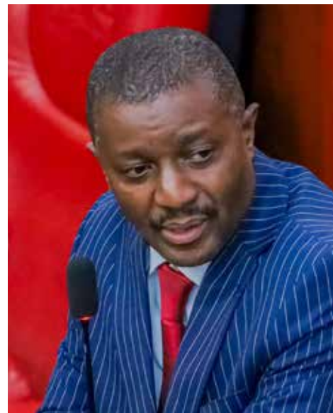
Senator Dan Maanzo

The IPU, he said, must find courage to speak to African leaders who manipulate