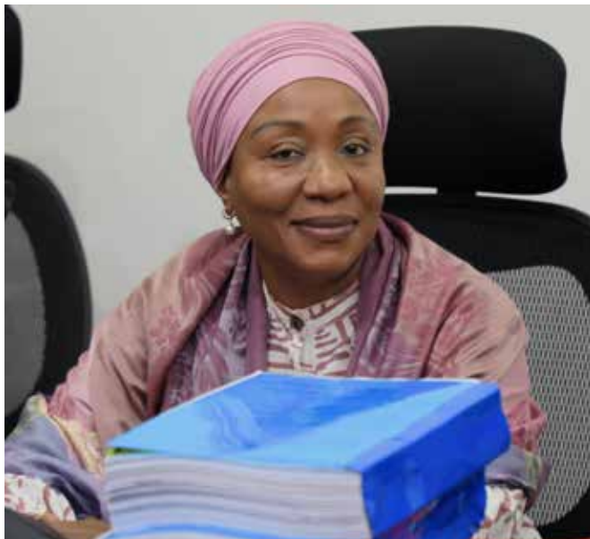
Senator Hamida Kibwana