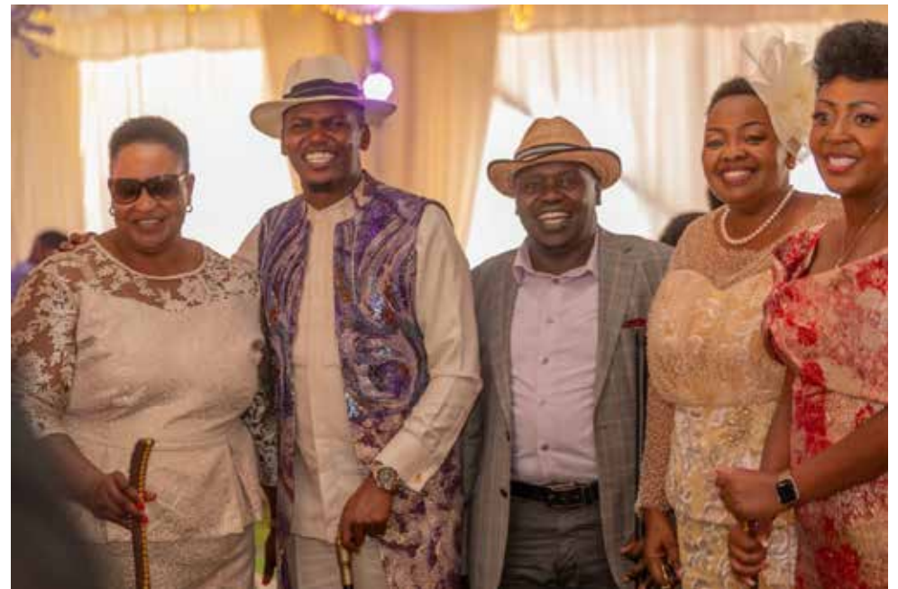
Senator Allan Chesang is joined by Senator Consolata Wakwabubi (left), Senator Samson Cherarkey, Senator Veronica Maina and Senator Tabitha Mutinda at the event.