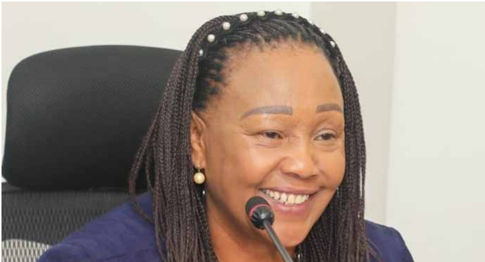
Senator Betty Montet, chair, Education Committee, during the meeting with Governor Johnson Sakaja.