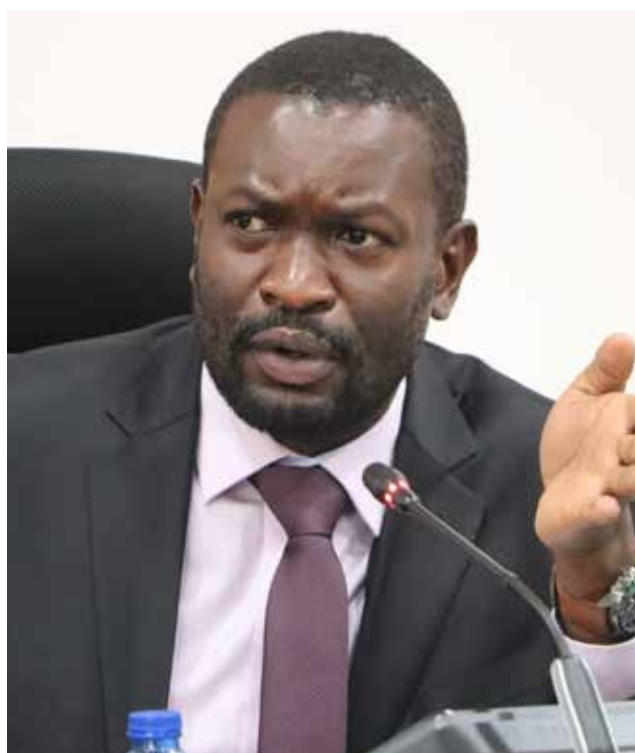
Senator Edwin Sifuna