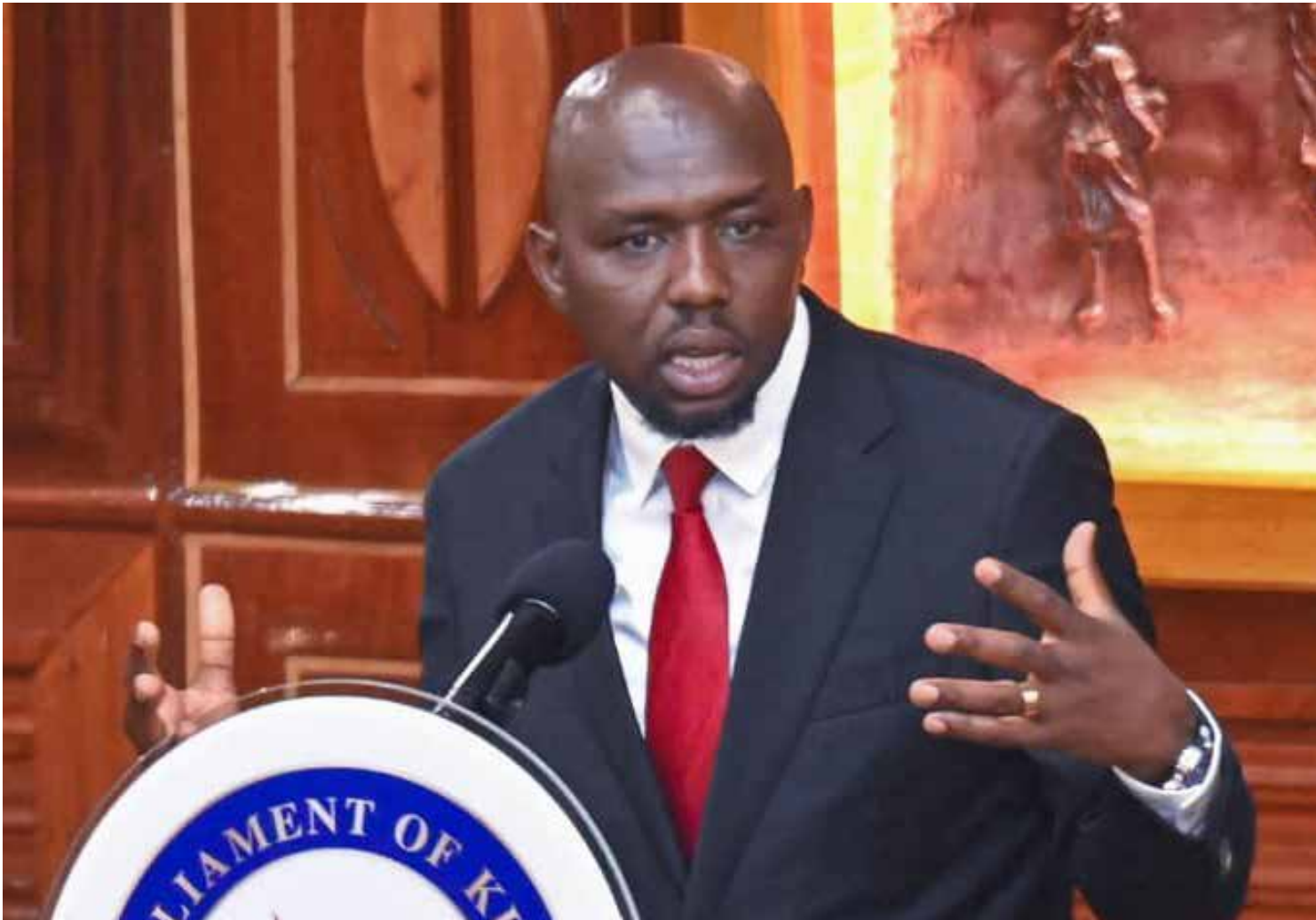
Cabinet Secretary Kipchumba Murkomen

Interior Cabinet Secretary Kipchumba Murkomen faced tough questioning over a string of politically linked violence in Kakamega County and other parts of Western Kenya.