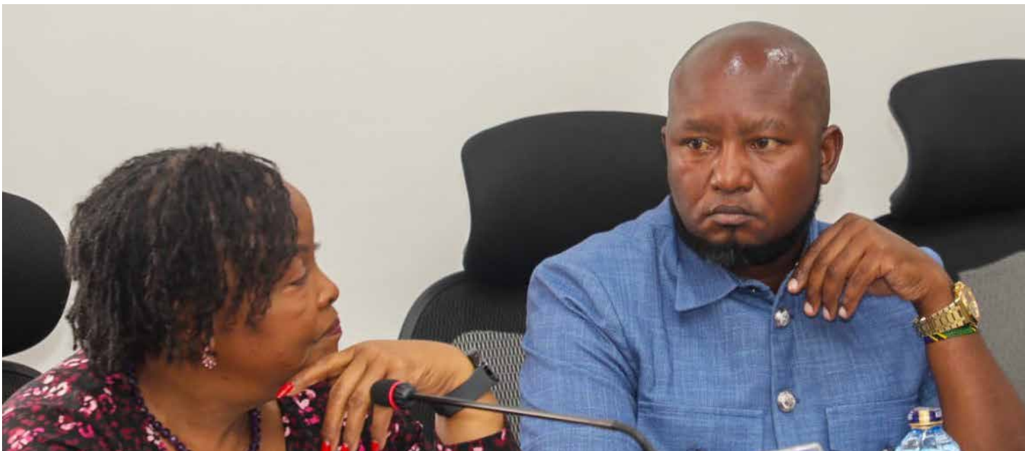
Senator Agnes Muthama and Senator James Murango during the meeting.

As part of the ongoing national assessment of Early Childhood Development Education (ECDE) and Vocational Training Centres (VTCs) implementation across all the 47 counties, the Committee on Education hosted Governor John Sakaja to deliberate on the current status of the institutions within Nairobi County.