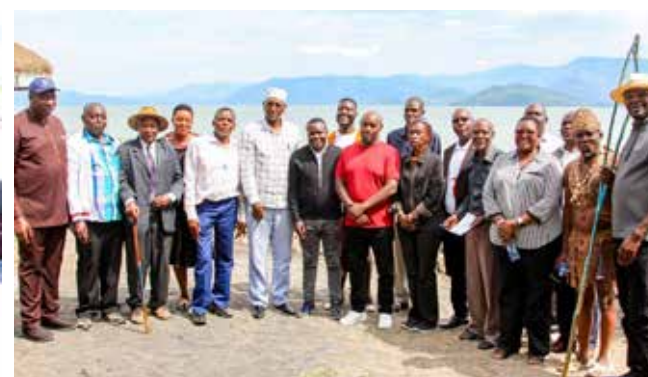
Members of the Committee on Transport pose for a picture with members of public after an engagement between the two sides on Mfangano Island.

Residents of Mfangano Island in Homa Bay County have challenged the Senate to ensure they are provided with a government-owned ferry to serve the route between Mbita and Mfangano.