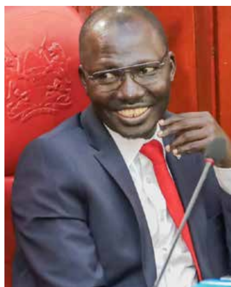
Senator James Lomenen

"Fishermen operating along Lake Turkana have been subjected to harassment and, in some cases, fatal encounters at the hands of KWS officers," the Senator lamented in a Statement on the