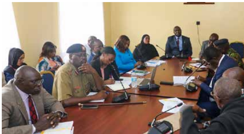
The meeting between the Security Committee and Nakuru County Security team.