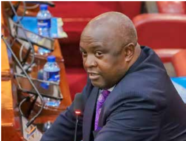
Senator Godfrey Osotsi