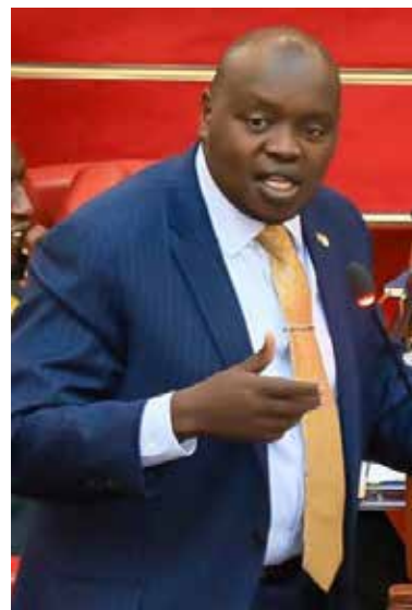
Senator Samson Cherarkey