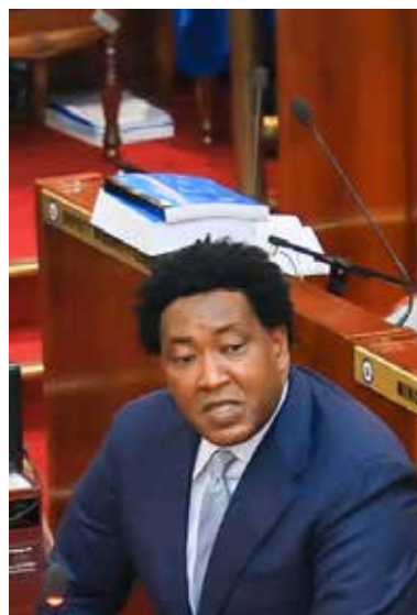
Senator Ledama ole Kina