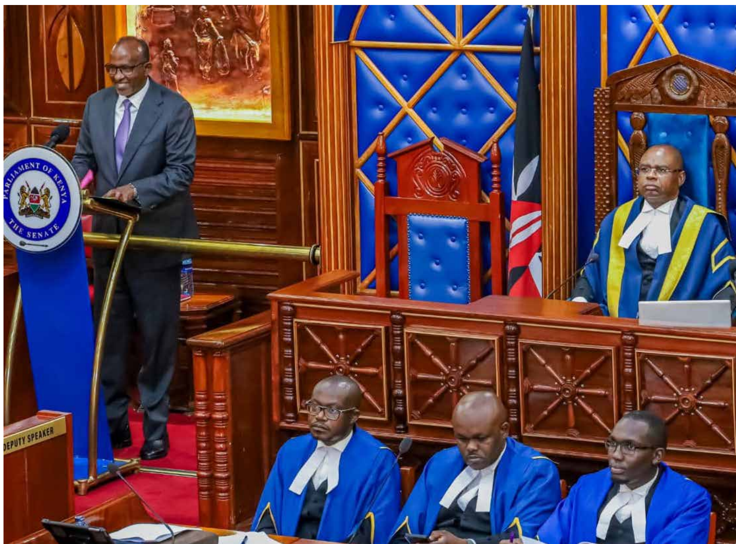
Health Cabinet Secretary Aden Duale responds to members' concerns on the floor of the House as Speaker Amason Kingi and the Parliamentary technical staff follow the proceedings.

The national and county governments could face off over the re-hiring of the more than 7,000 medics who served the country during the Covid-19 pandemic.