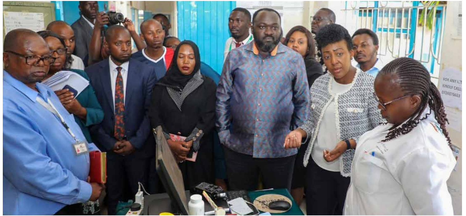
Senator David Wakoli and Senator Tabitha Mutinda during the Committee on Health tour of Machakos Level 4 Hospital on inspection tour.

“We are here to partner with you and remind you that we can still make Kenya great by fulfilling the true purpose of devolution,” remarked Senator Wafula Wakoli.