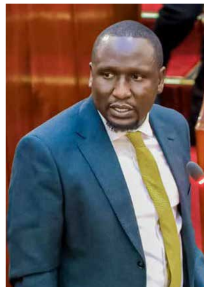
Senator Aaron Cheruiyot.

The ballooning county wage bills, bloated payrolls and the perversion of devolution into employment bureaus has triggered debate in the House.