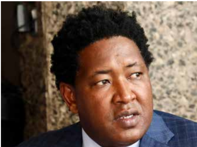
Senator Ledama ole Kina