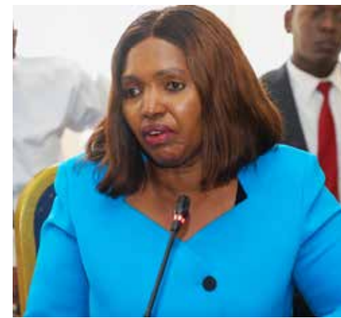
Senator Tabitha Keroche.

The Committee on National Security, Defence and Foreign Relations has reaffirmed its commitment to uncovering the truth behind the disappearance of Mr Brian Odhiambo and ensuring the safety of communities around Lake Nakuru.