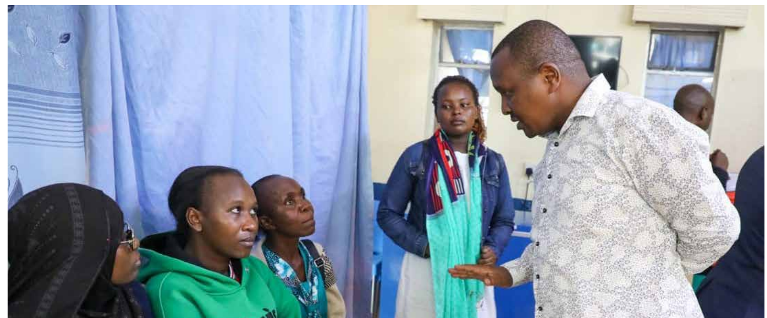
Senator Joseph Githuku talks to patients at Makueni Level 4 Hospital.