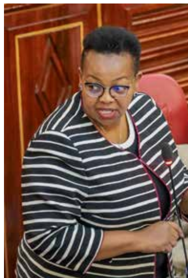
Senator Veronica Maina