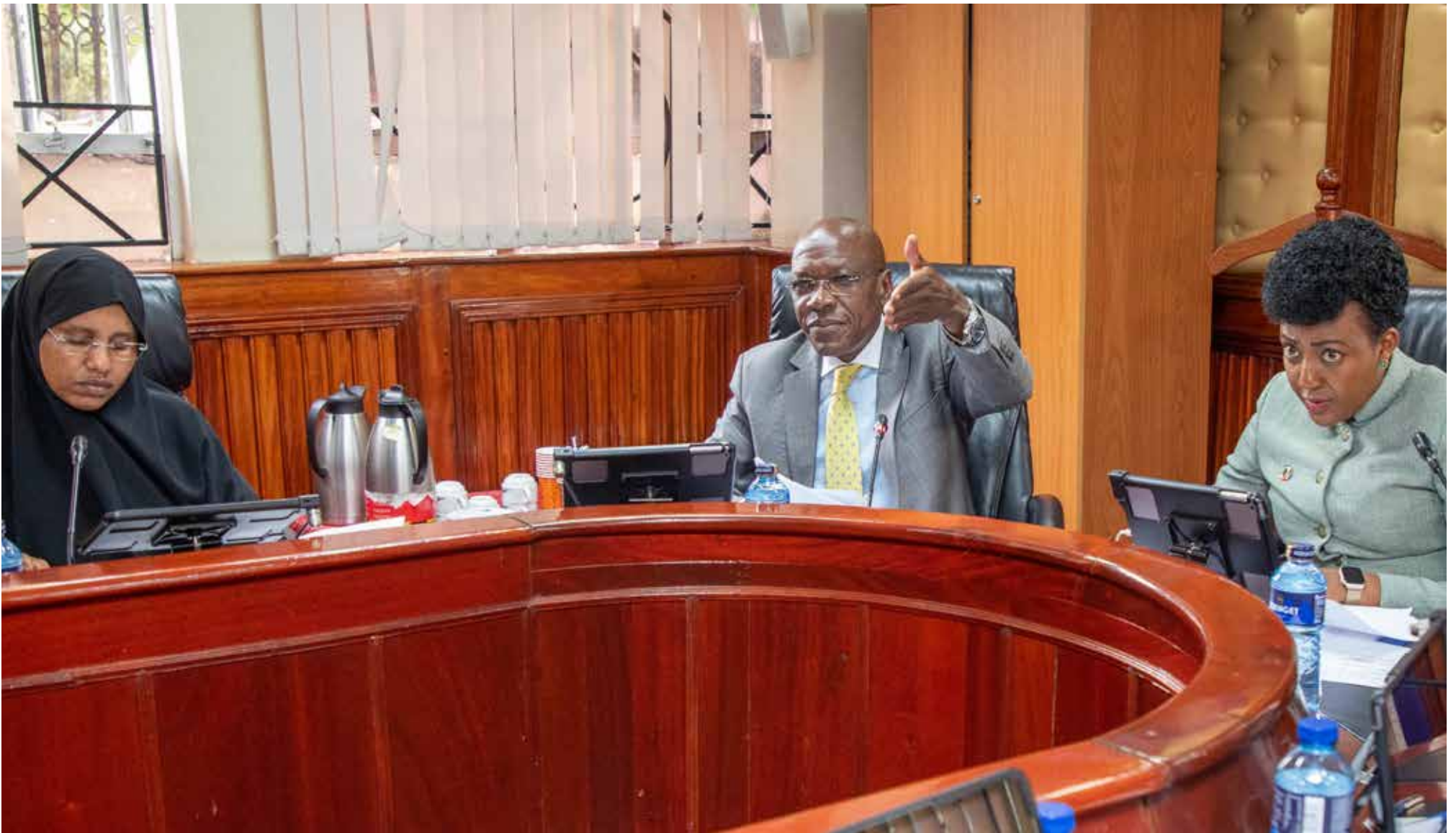
Senator Boni Khalwale makes a point during a sitting of the Committee on Finance and Budget which was chaired by Senator Tabitha Mutinda (right). Senator Mariam Omar listens.

A committee of the Senate has resolved to scrutinise the latest government borrowing.