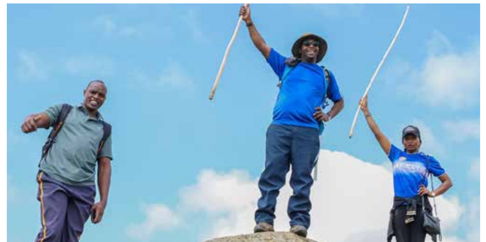
Parliamentary Staff express their excitement at the peak of Ngong Hills, Kajiado County. They had had gone hiking as part of their physical wellness initiative.

For in-kind contributions, staff are encouraged to drop off toys by November 28, 2025 at Bunge Tower, First Floor, next to Committee Room 5.