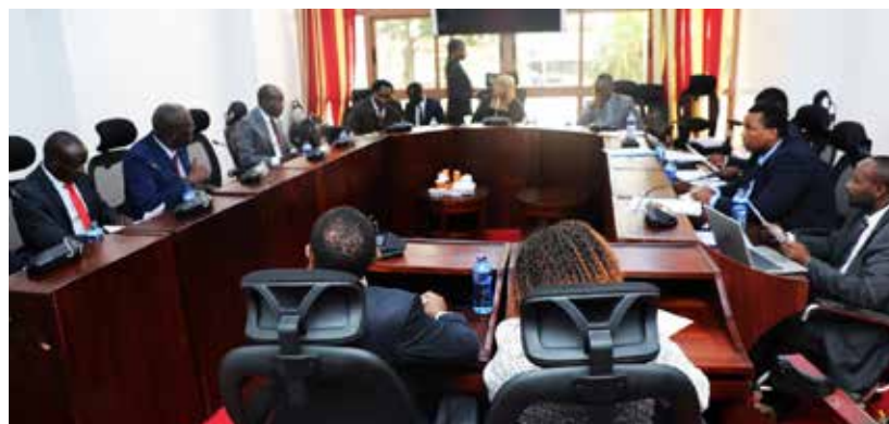
Kikao cha Kamati ya Usalama na waakilishi wa kampuni za Bima