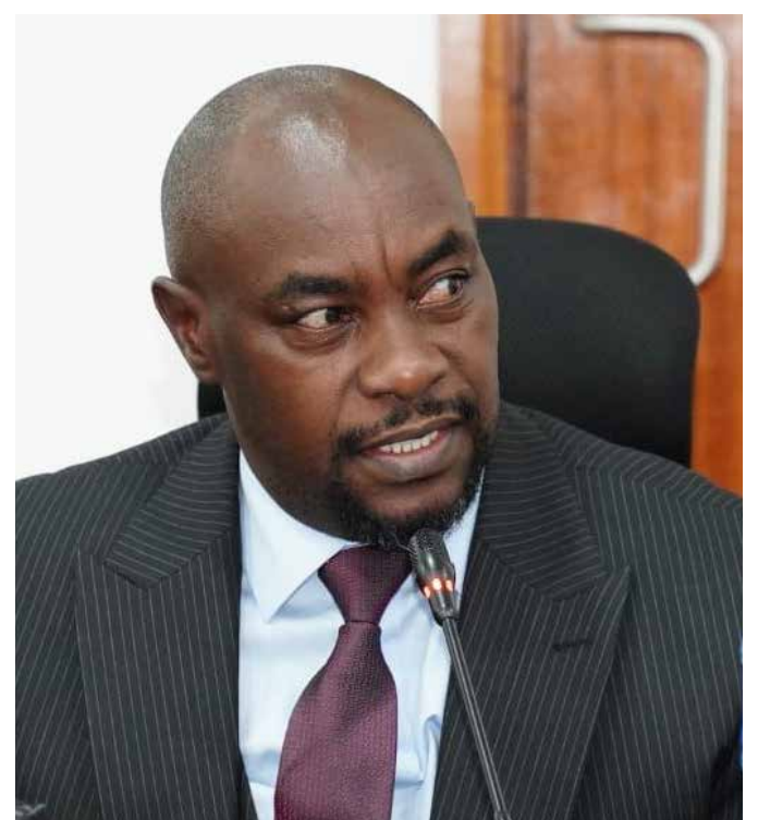
Senator Enock Wambua.

Senators have challenged the Committee on Land, Environment and Natural Resources to investigate the dispute surrounding Jamhuri Park and determine its true ownership as a matter of national urgency.