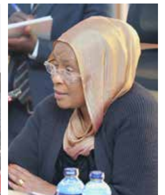
Seneta Fatuma Dullo, Mwenyekiti, Kamati ya Usalama

Tunapaswa kuwa na utu na kuwasaidia kujiondoa kwenye changamoto wanazokabiliana nazo,” aliongeza Seneta Dullo.