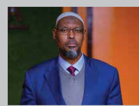
Senator Hargura Godhana said: