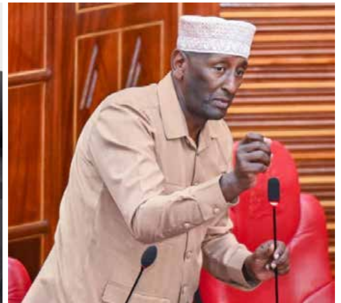
Senator Mohamed Chute

The House has called for urgent reforms in the Supreme Council of Kenya Muslims (SUPKEM) following widespread complains of the organisation’s handling of the annual Hajj pilgrimage.