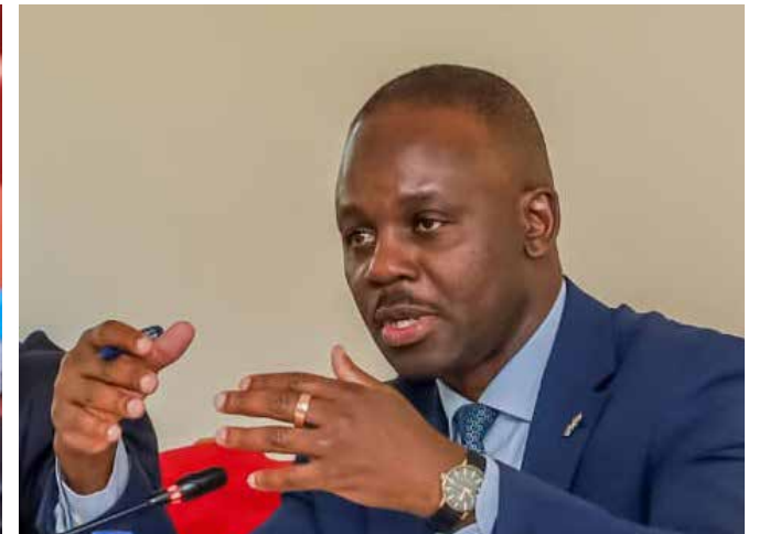
Senator Moses Kajwang

The House has expressed concern after it was revealed that the Siaya County Public Service Board had revoked the employment of 580 health workers, citing irregular hiring.