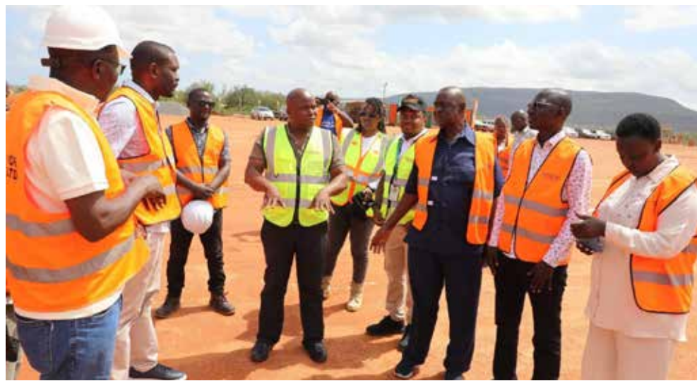
An official from the Galana Kulalu Food Security Electrification Project (GKFSCEP) explains the operations to members of the Committee on Energy led by the chair, Senator Oburu Oginga, third right. Others in the picture are from right, Senator Beatrice Ogola, Senator James Lomenen and Senator Edwin Sifuna, second left.

Senator Oburu Oginga, the chair of the Committee on Energy, has challenged the national Government to complete the construction works of the Galana Kulalu project in time so that the people of Kilifi County can be connected to the national grid.