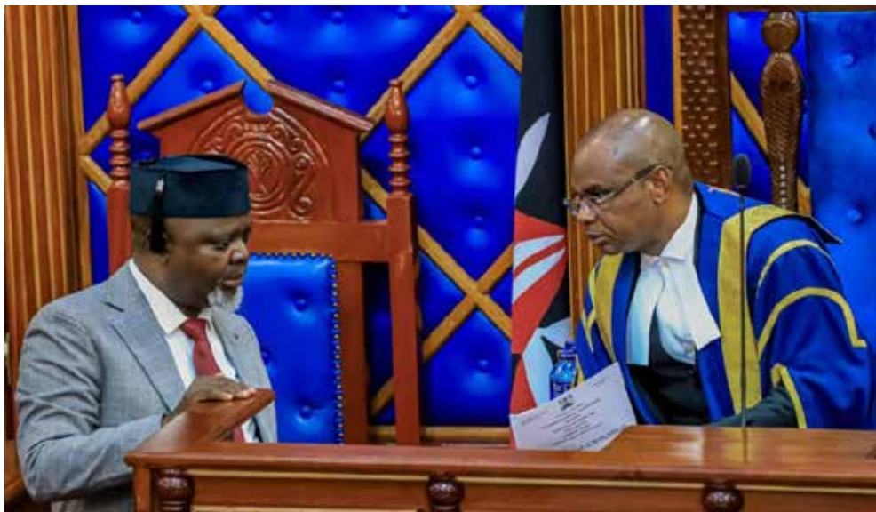
Speaker Amason Kingi consults his deputy, Senator Kathuri Murungi.

The Senate has resumed its final sittings of the session under intense pressure to complete its legislative agenda.