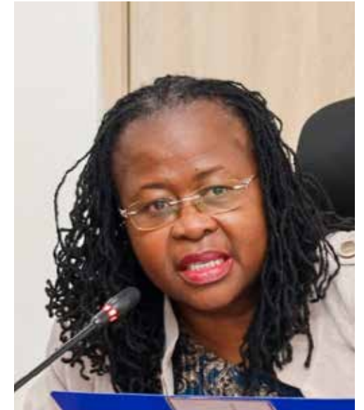
Senator Catherine Mumma

Senator Dan Maanzo echoed Senator Khalwale's concerns, saying the IPU pro-