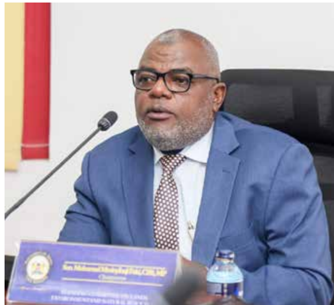
Senator Mohamed Faki