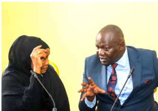
Senator Fatuma Dullo, chair Security Committee, consults Senator Tom Ojienda, the vice chair, during the meeting in Nakuru County.