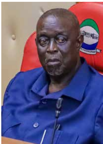
Senator Oburu Oginga