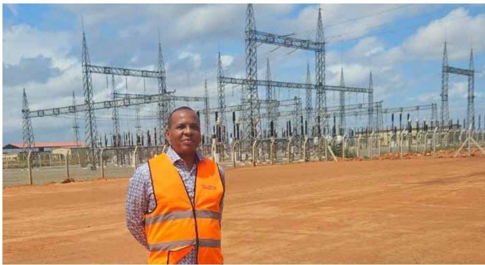
Senator Danson Mungatana during the Committee on Energy tour of the Galana Kulalu Food Security Electrification Project (GKFSCEP) in Kilifi County.