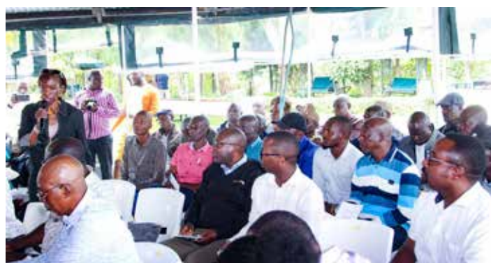
Members of the public give their views on the ferry services when the Committee on Transport toured Mfangano Island.