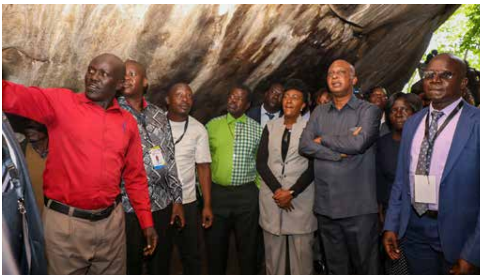
Senator Issa Boy, Chair Trade Committee, Senator Tabitha Mutinda and Senator Okiya Omtatah at the Kakapel Prehistoric site.