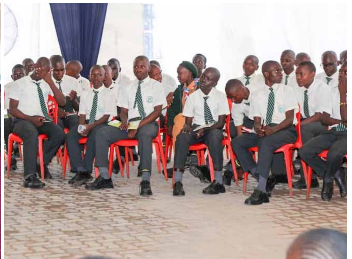
(left and right) Some of the learners who visited the Senate information booth at the County Assembly.