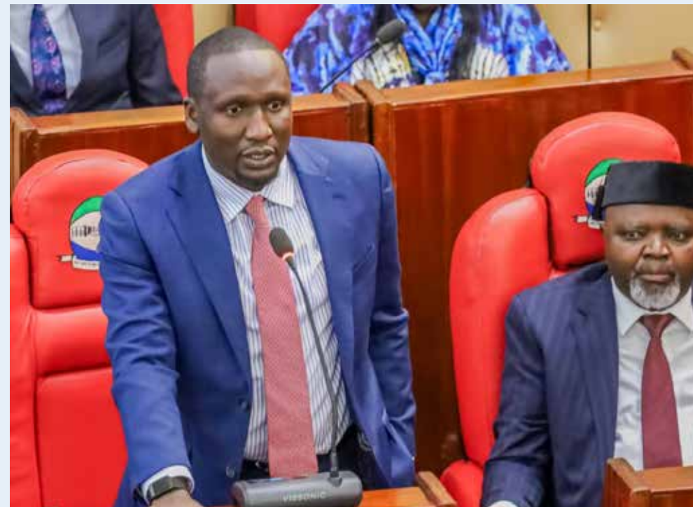
Majority Leader Aaron Cheruiyot.

The Senate has given the government agencies a 90-day ultimatum to fix the perennial congestion and inefficiencies at the Busia and Malaba border posts.