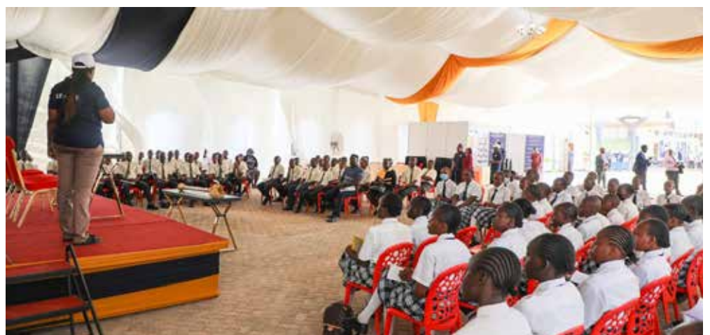
Commissioner Rachel Ameso and students follow the events at the Senate information booth.