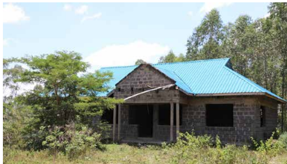
The stalled construction works of Okisimo Vocational Training in Teso South, Busia County.