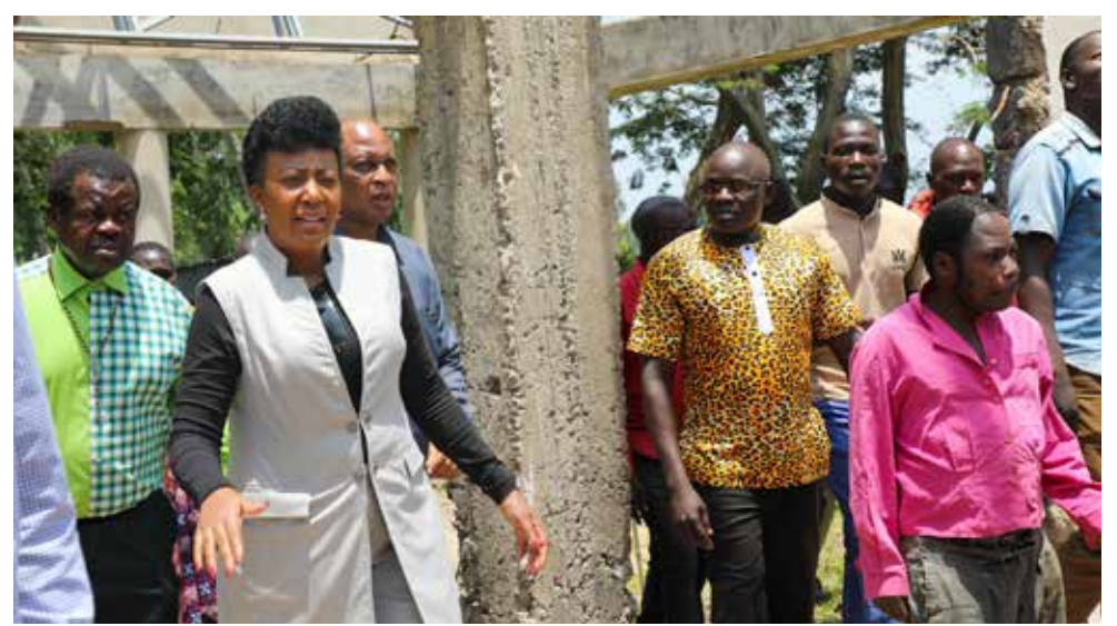
Senator Okiya Omtatah, Senator Tabitha Mutinda and Senator Issa Boy inspect stalled projects at the Malaba border post.

The Committee on Trade, Industrialisation and Tourism has called for urgent measures to address persistent challenges affecting efficiency at the Malaba One-Stop Border Post (OSBP) and to support the preservation of cultural heritage at the Kakapel Prehistoric Site in Busia County.