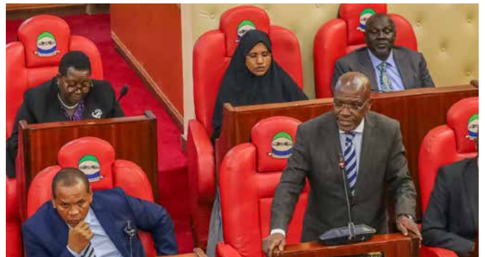
Senator Boni Khalwale

“I believe that the own-source revenue of Busia County should be comparable to the own source revenue of Mombasa County. We should unlock this. At the moment, the county government