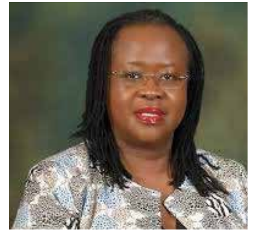
Senator Catherine Mumma