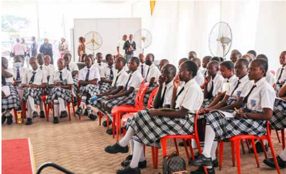
Students at the Senate information booth in Busia County.

The event reinforced the Senate's vision of an open, accessible and people-centred institution driving Kenya's development agenda.