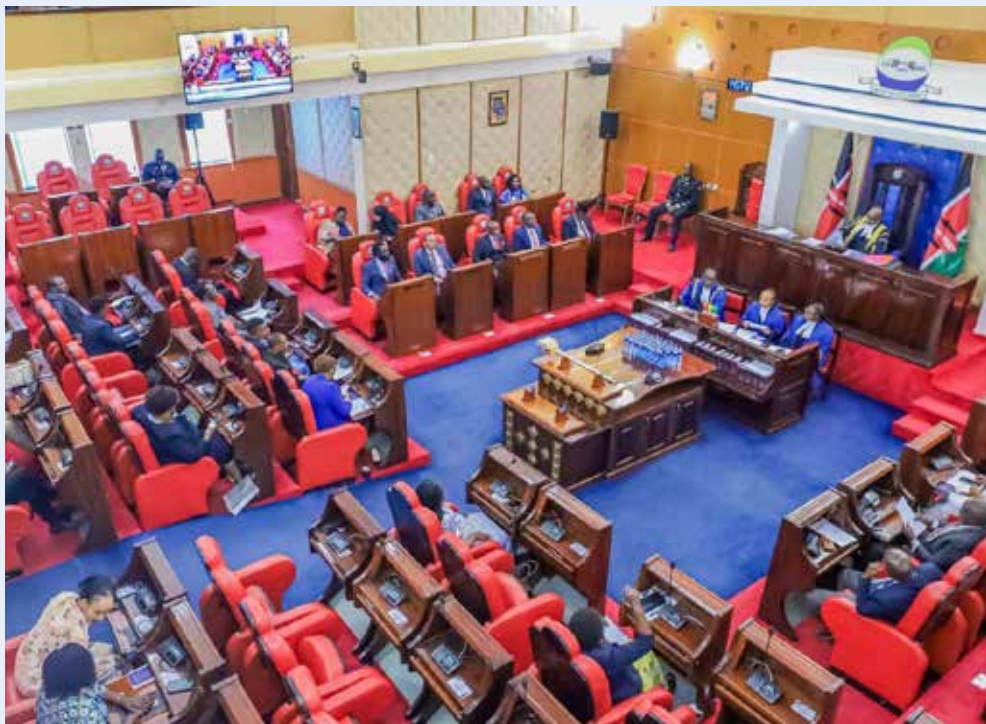
The sitting of the Senate at the County Assembly of Busia during the fourth Senate Mashinani.