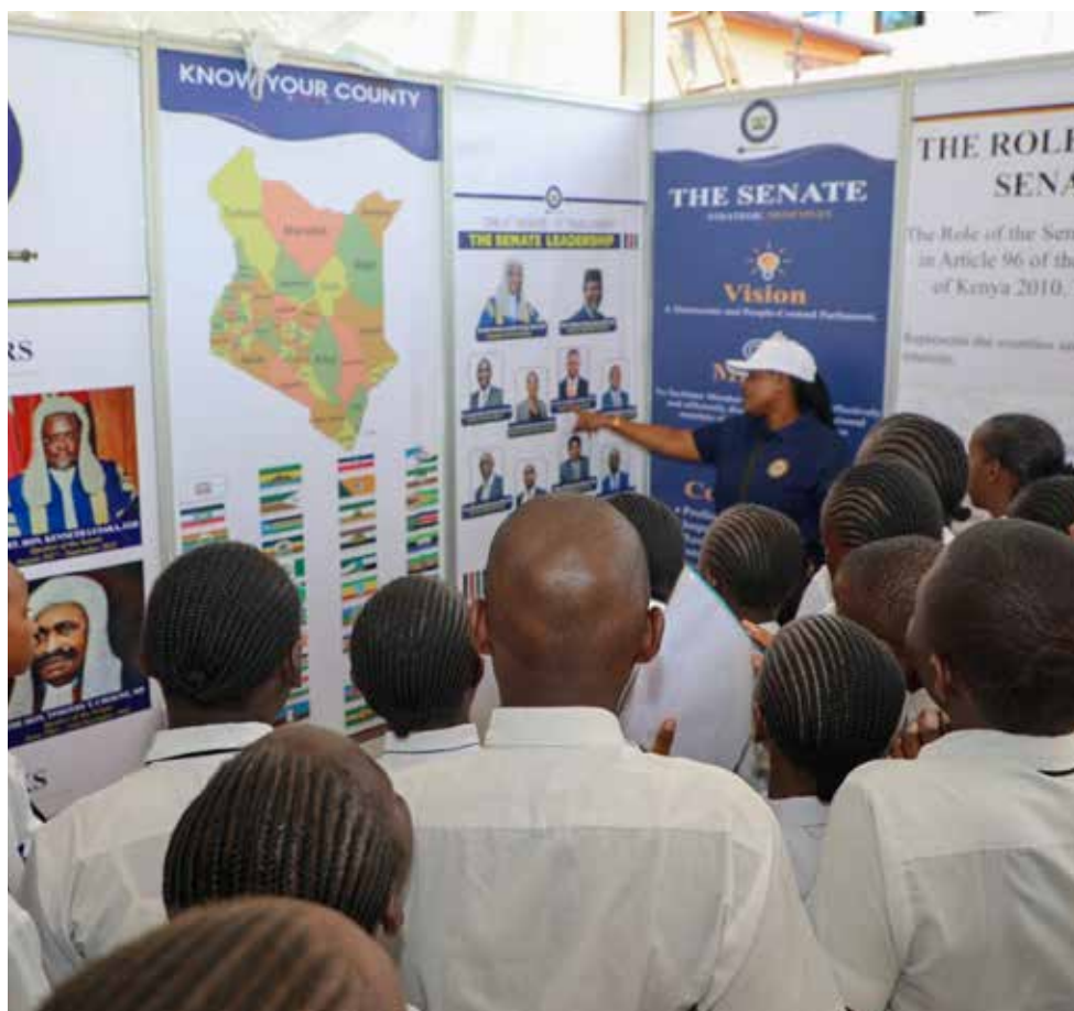
Learners follow as a PCO takes them through the legislative process at the Information booth in Busia County.