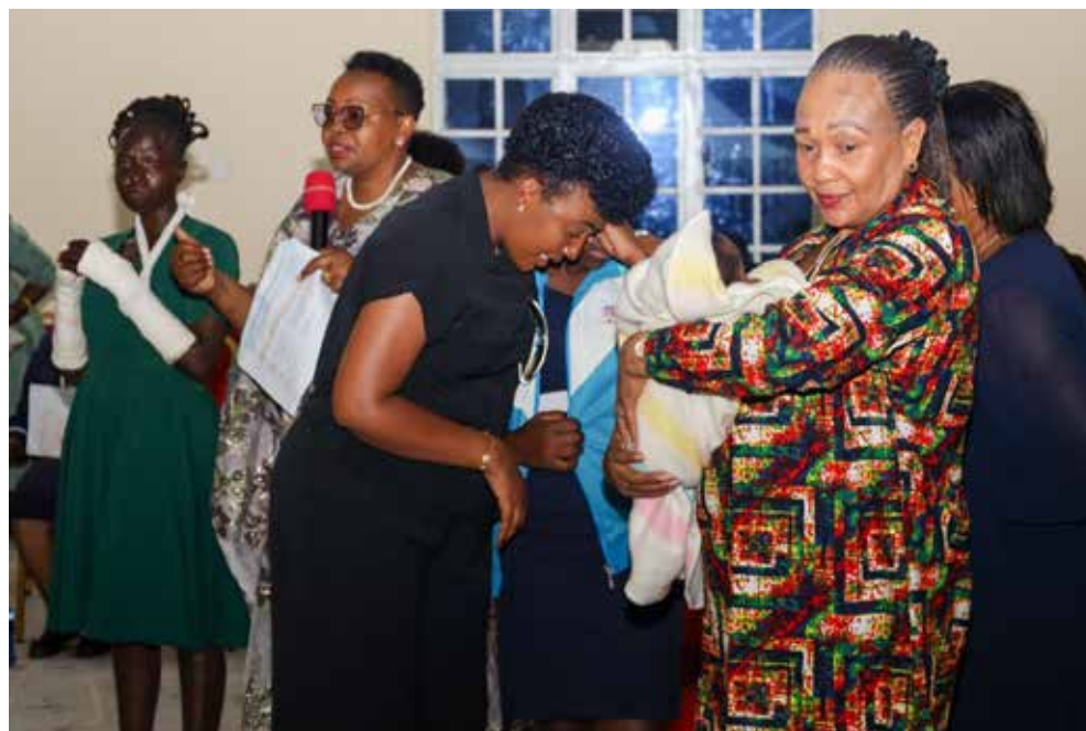
Senator Mutinda and Senator Betty Montent admire a new born.