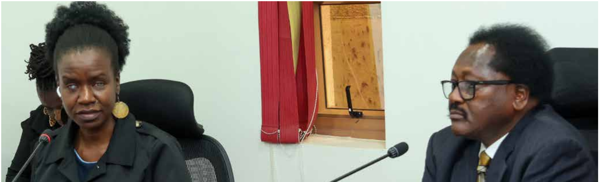
Senator Julius Murgor and Senator Crystal Asige during a meeting of the Labour Committee.