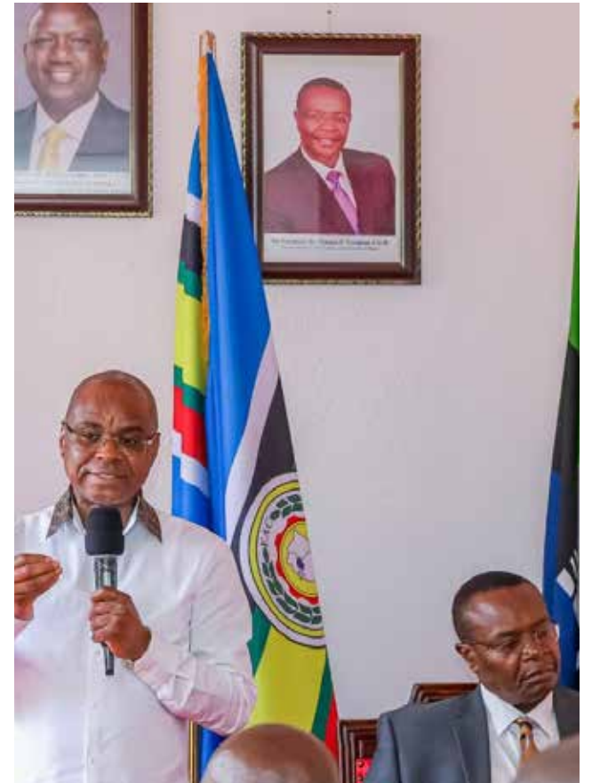
Speaker Kingi speaks during the meeting between the Senate leadership and the County Executive of Busia County.

Speaker Amason Kingi has reaffirmed the Senate's commitment to nurturing a strong and mutually respectful working relationship with county governments arguing that the success of devolution is hinged on continuous collaboration between the two.