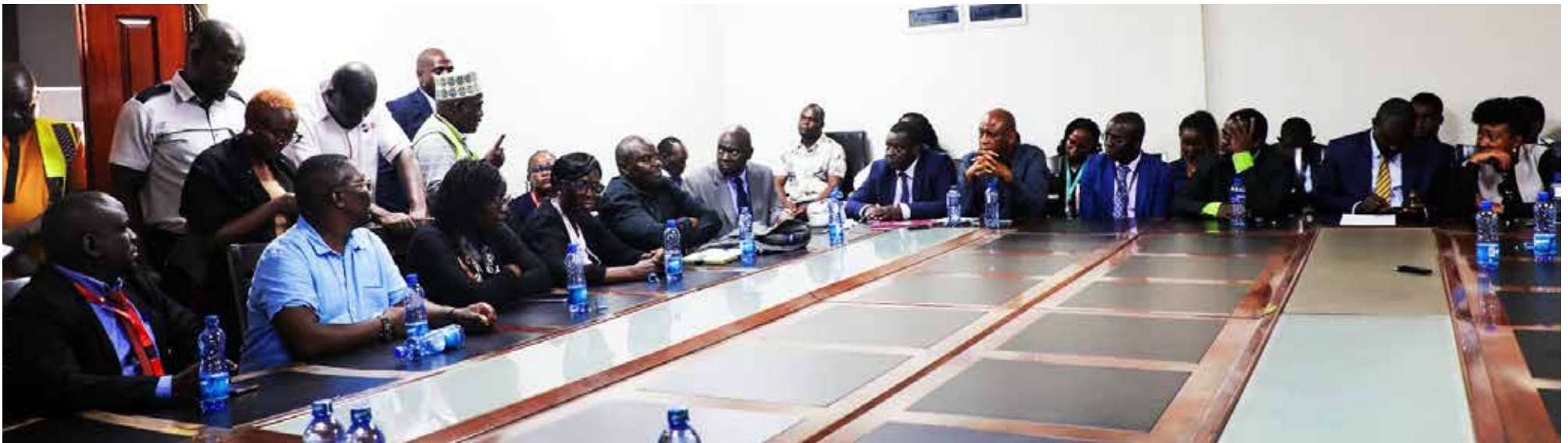
A government official briefs members of the Trade Committee on the operations at the Malaba border post.