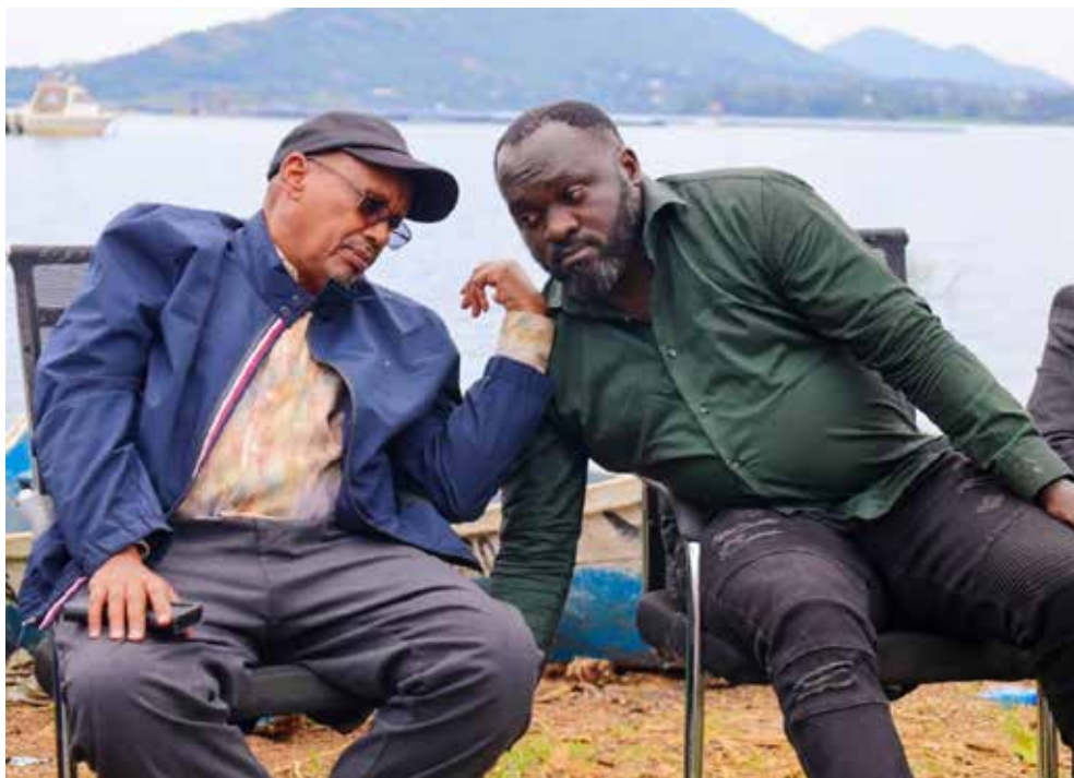
Senator Wafula Wakoli consults with Senator Mohamed Abbas at Mulukoba Beach, Budalangi.