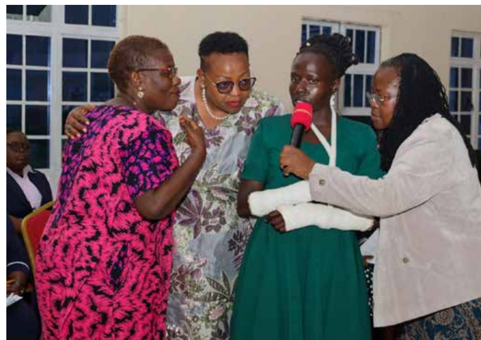
Senator Veronica Maina and Senator Catherine Mumma sympathise with a victim of domestic violence.

The Kenya Women Senators Association (KEWOSA) had a highly impactful and participative session where it addressed the escalating Triple Threat of HIV, Adolescent Pregnancy, and Sexual and Gender-Based Violence (SGBV) in Busia County.