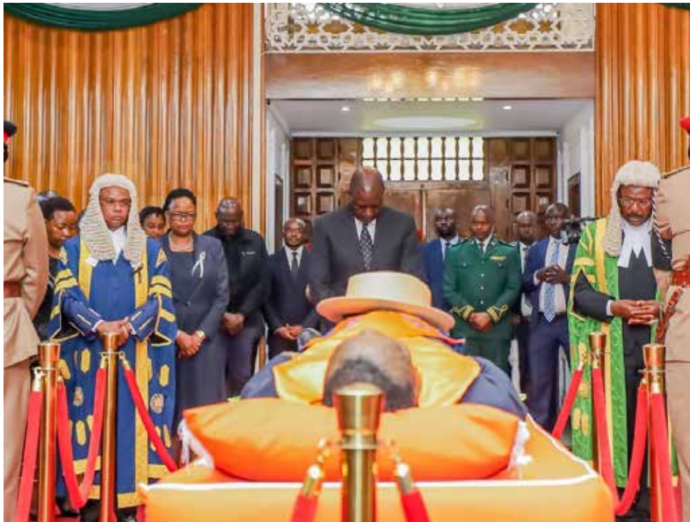
Speaker Amason Kingi and National Assembly Speaker Moses Wetangula join President William Ruto in paying their respects when the body of the late Raila Odinga lay in state at Parliament Building.