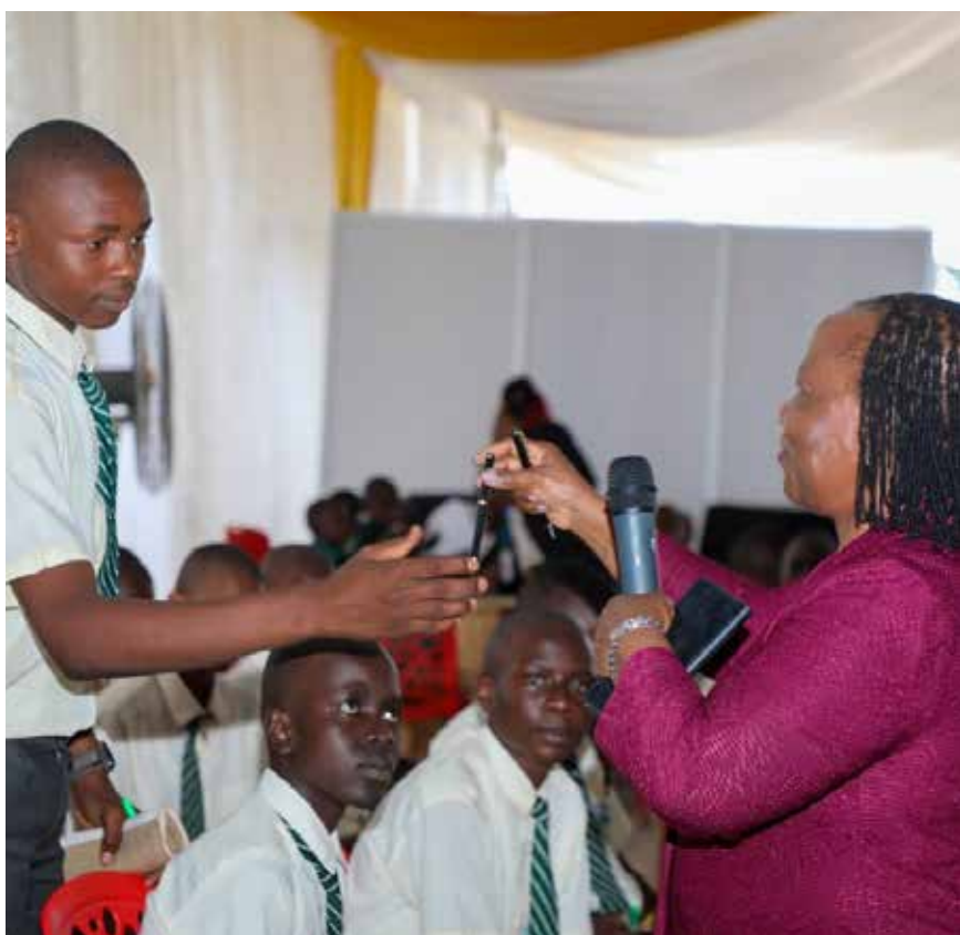
Some of the learners who visited the Senate information booth.