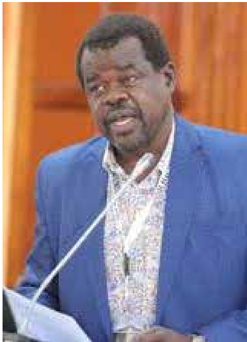
Senator Okiya Omtatah

“The county has contributed its rightful share to the country. At times when you look at the county and the personalities it has produced, you will find that this county has on many occasions punched beyond its weight and it is because of those beautiful names you have heard that this county has contributed to the development of this country. It is really good that, yesterday, on the Floor of this House, we debated The County Hall of Fame Bill, which seeks to immortalise names like the ones you have heard being mentioned on the Floor of this House. Many people have contributed to the development of this country and sometimes they do not get acknowledged. They cease serving as role models to generations coming after them. I am sure that very few people in this hall knew that the first kidney transplant by an African was by a man from Busia.”