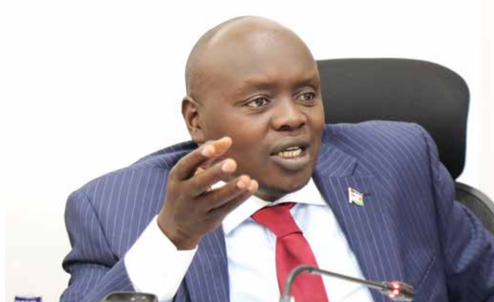
Senator Samson Cherarkey