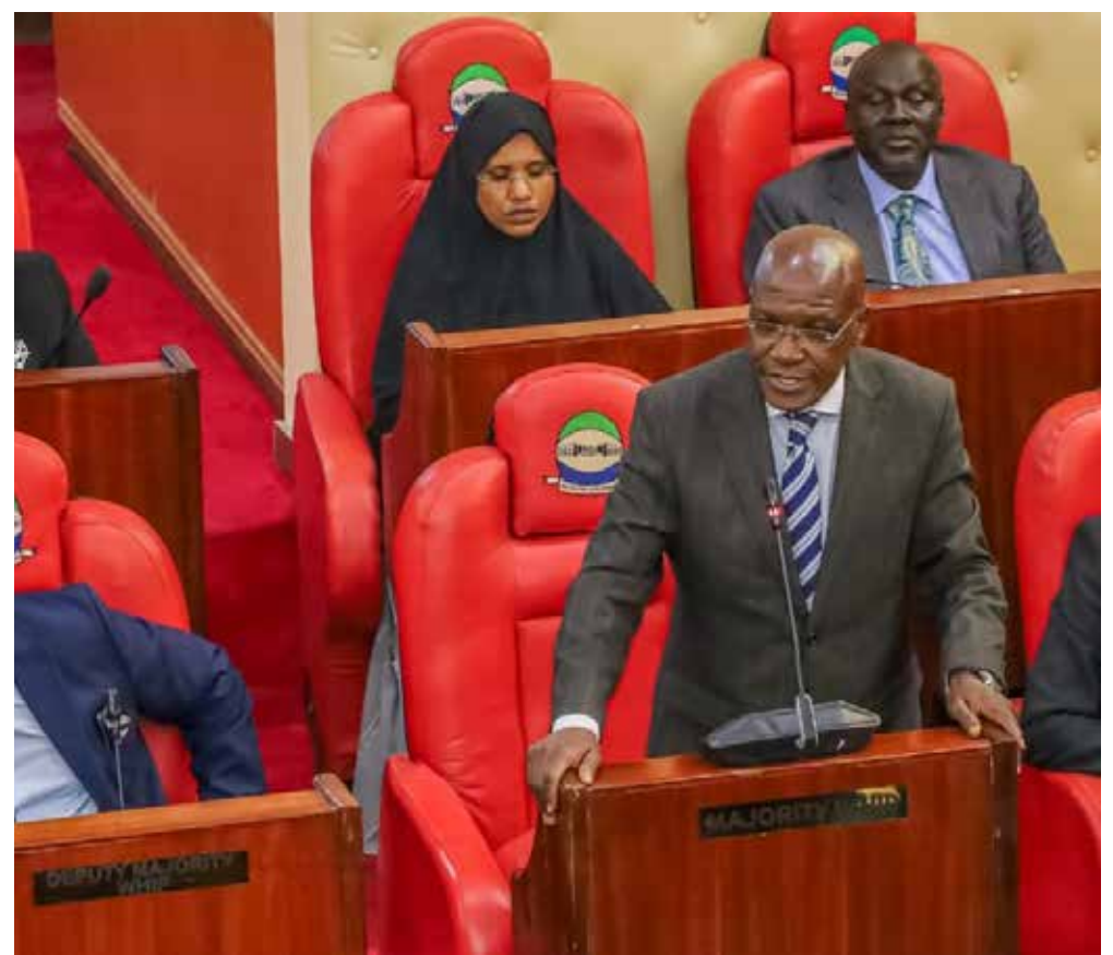
Senator Boni Khalwale speaks in the House.

ya's history from the shadows of colonial distortion.