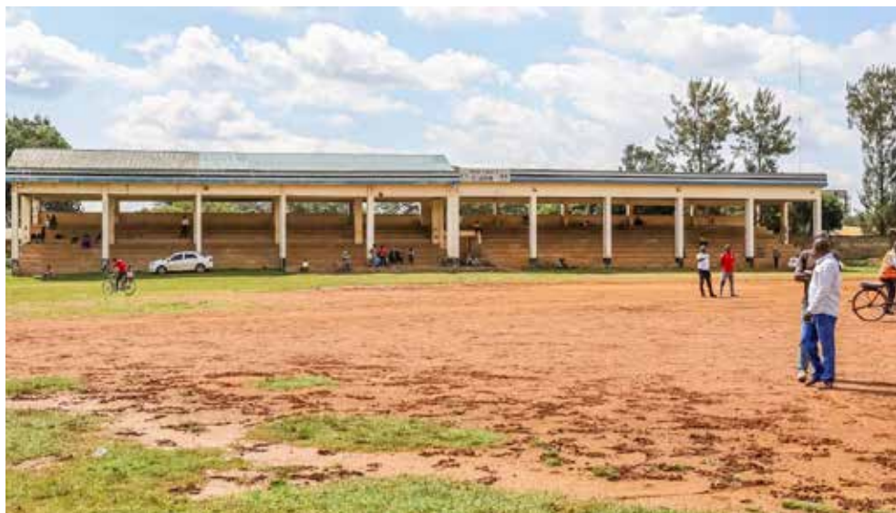
The image of the Busia County Stadium.