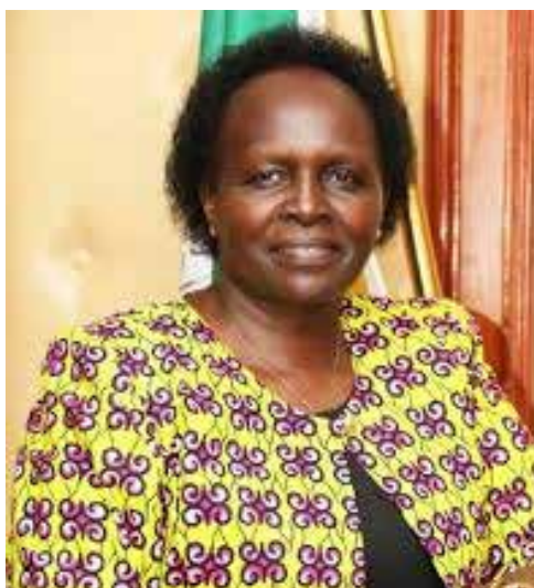
Senator Margret Kamar

“The county has contributed its rightful share to the country. At times when you look at the county and the personalities it has produced, you will find that this county has on many occasions punched beyond its weight and it is because of those beautiful names you have heard that this county has contributed to the development of this country. It is really good that, yesterday, on the Floor of this House, we debated The County Hall of Fame Bill, which seeks to immortalise names like the ones you have heard being mentioned on the Floor of this House. Many people have contributed to the development of this country and sometimes they do not get acknowledged. They cease serving as role models to generations coming after them. I am sure that very few people in this hall knew that the first kidney transplant by an African was by a man from Busia.”