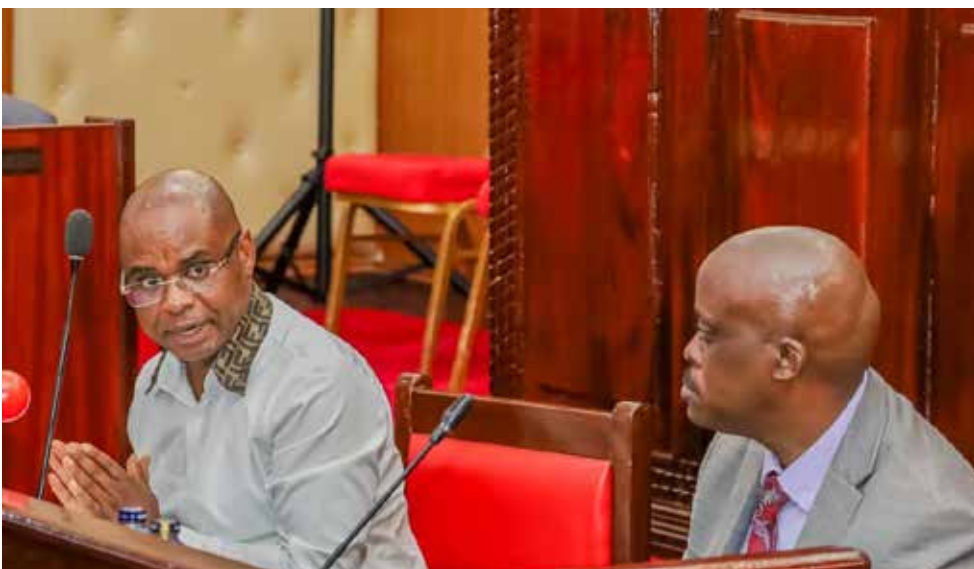
Speaker Kingi speaks during the meeting with the leadership of both the Assembly and the Senate. He is flanked by Assembly Speaker Fredrick Odilo.