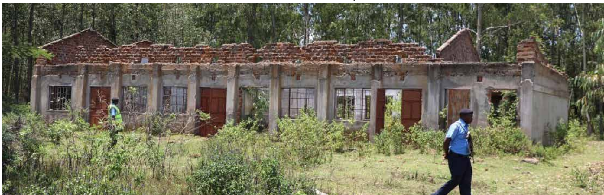
Police Officers walk around the abandoned wing of Okisimo Vocational Centre in Teso South, Busia County. The Education Committee conducted an inspection tour at the site during the fourth Senate Mashinani to assess the state of vocational training infrastructure in the county.

presented to the Senate detailing how the infrastructure and operational bottlenecks at the two border posts can be addressed.