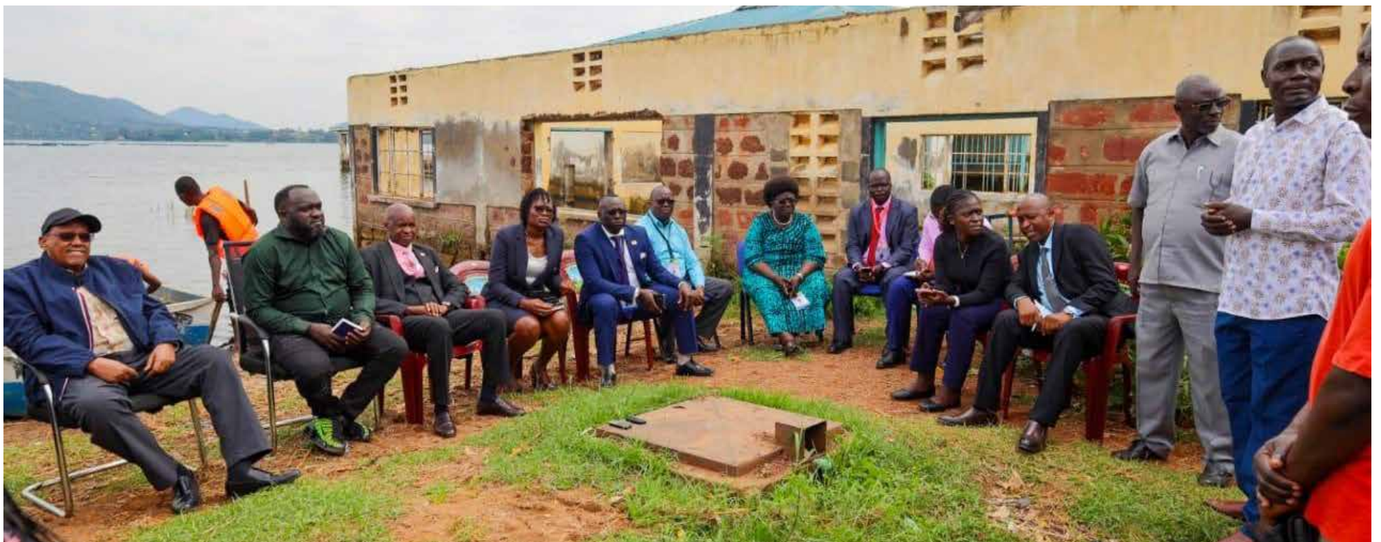
Senator Wafula Wakoli and other members of the Agriculture Committee listen to the challenges the fishing community at Mulukoba Beach in Budalangi, Busia County, face.

Senators demanded that the government should formulate a concrete implementation plan, insisting that assurances be backed by timelines, accountability and meaningful resource allocation to restore security and viability to Kenya's inland fishing sector.