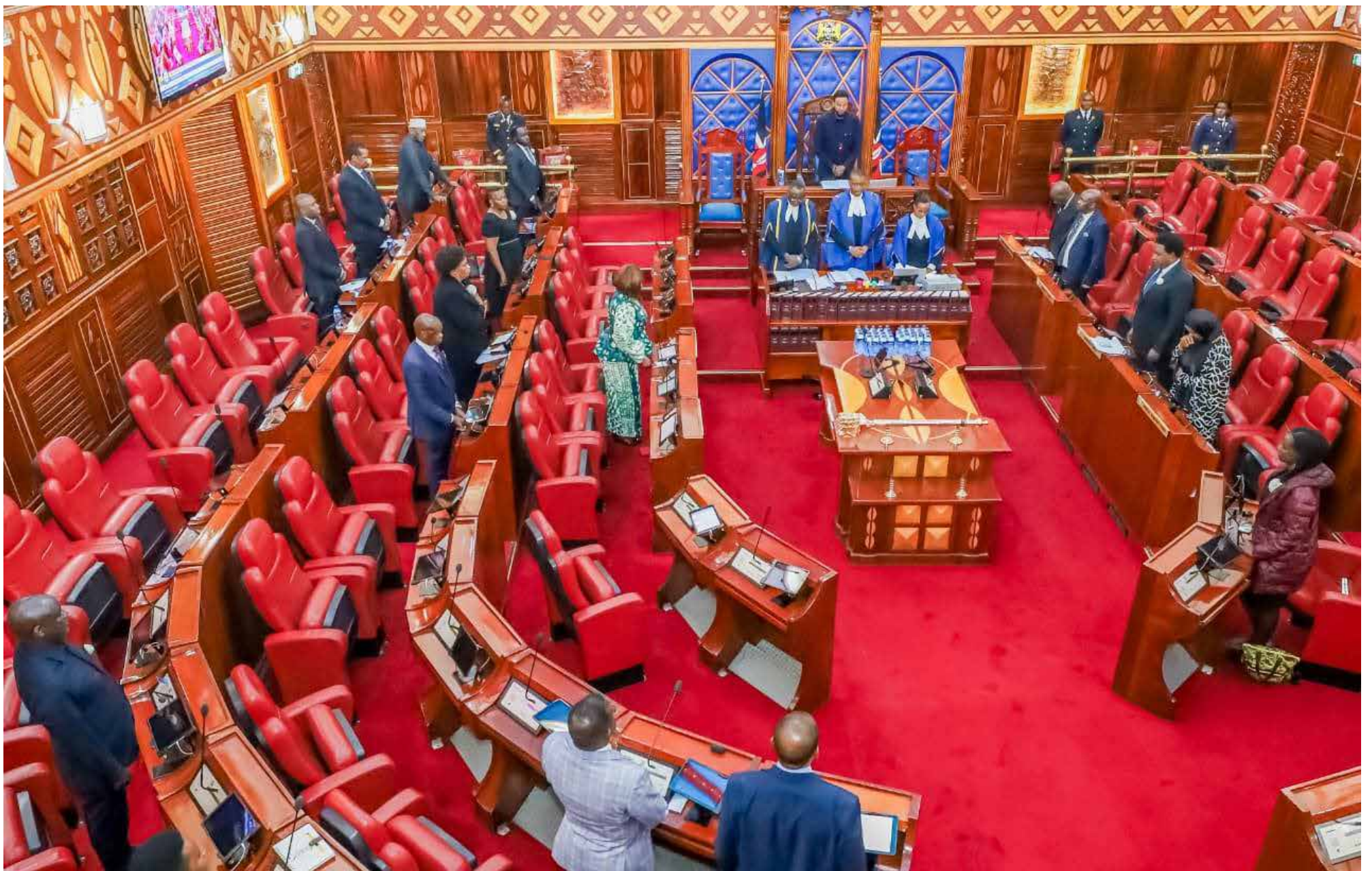
Senators stand in a minute of silence in respect and honour to the late Raila Odinga during a Special Sitting of the House convened to eulogise the former Prime Minister.

In a Special Sitting, Senators describe the late Raila Odinga as a symbol of endurance and conviction whose courage and sacrifice defined Kenya's democratic journey.