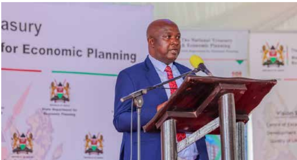
Senator Godfrey Osotsi

Majority Whip Boni Khalwale has hailed the fourth Senate Mashinani that ended its sittings in Busia County last week, saying it was a historic moment for the Western region.