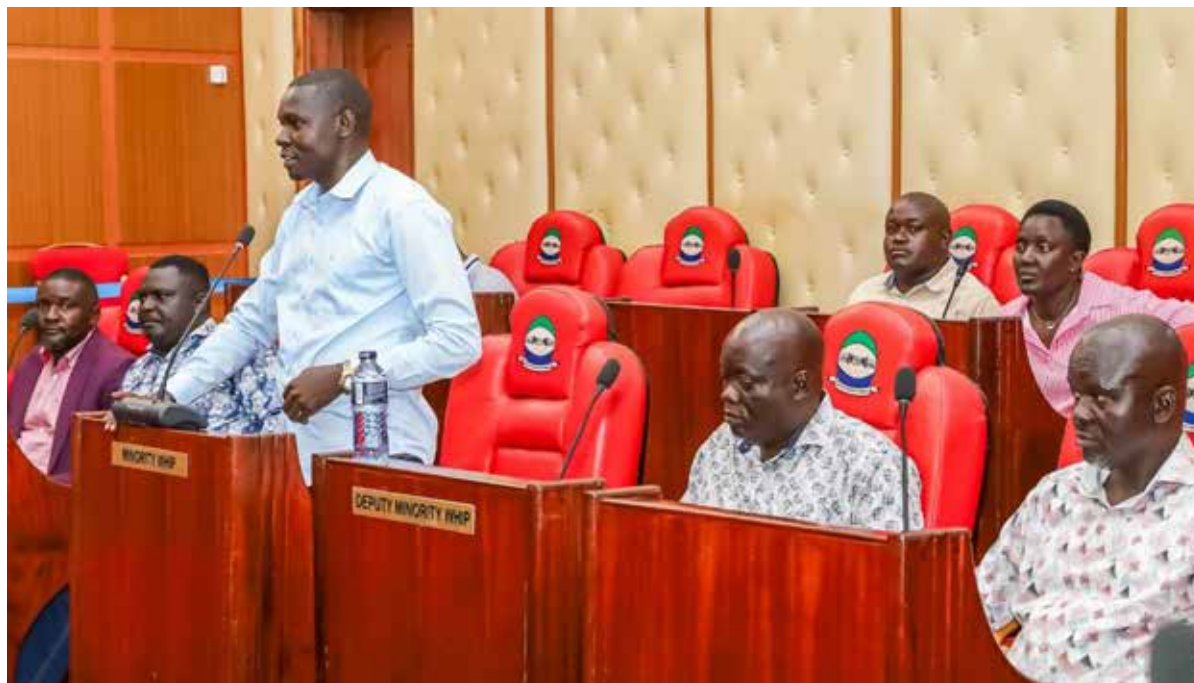
An MCA speaks during the meeting with the Senate leadership.