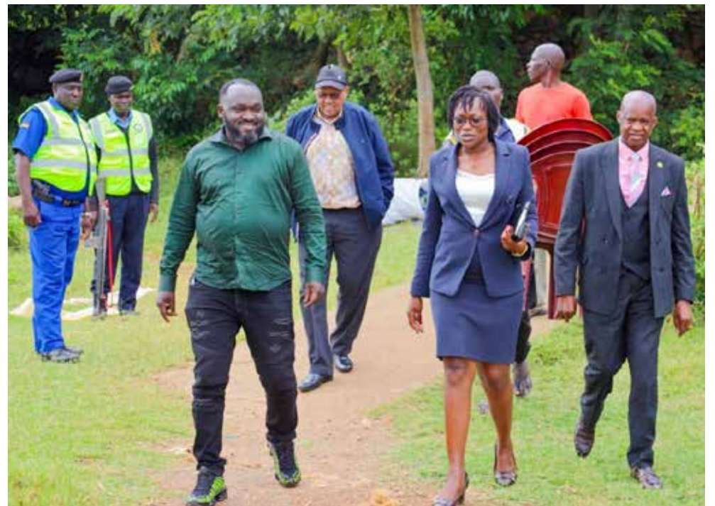
Senator Wafula Wakoli and Senator Munyi Mundigi at Mulukoba Beach during the inspection tour.