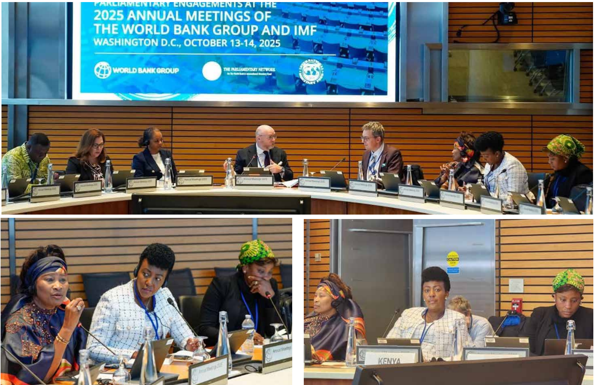
Pictures of Senator Tabitha Mutinda (second right) during the annual meetings of the World Bank Group and IMF in Washington DC.

Senator Tabitha Mutinda has urged the nations of the world to work together to build an inclusive, resilient economy that not only absorbs but also unleashes the potential of global youth.