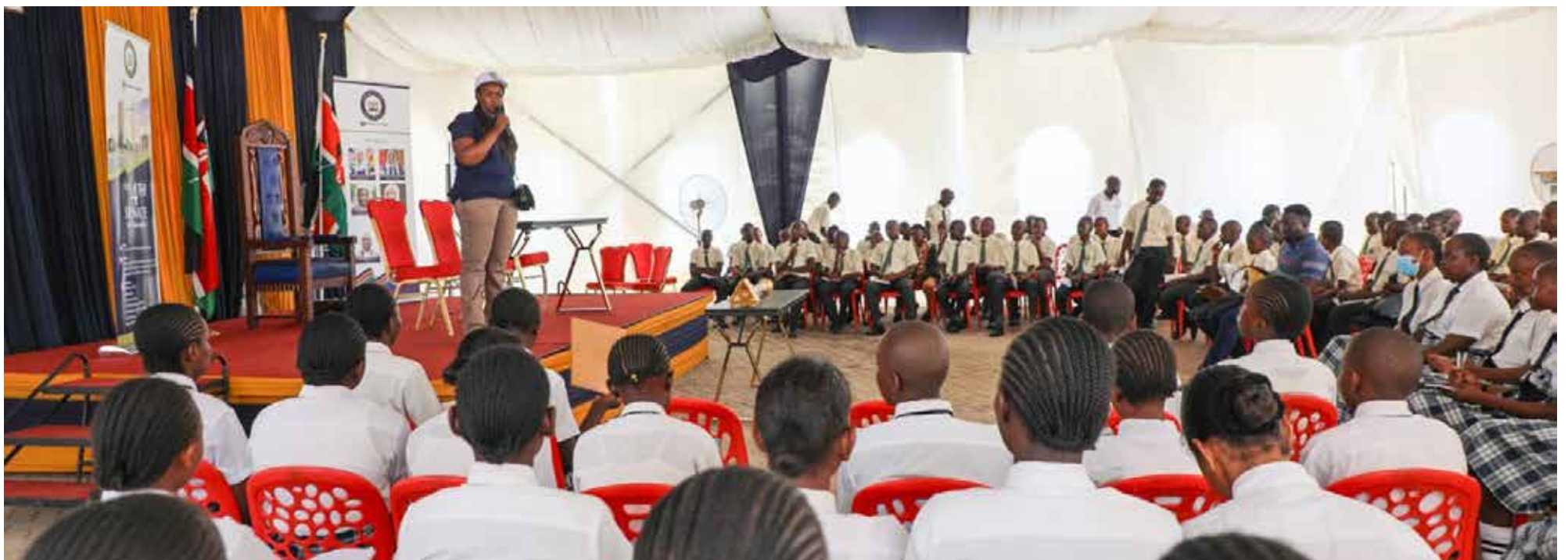
A Public Communications Officer speaks to learners from different schools who visited the Senate information booth.

The initiative not only brought the Senate closer to the people but also strengthened the institution's reputation as a democratic, transparent and citizen-oriented body.