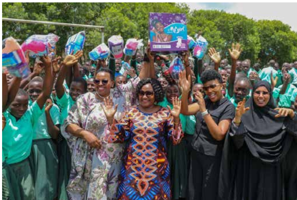
Senator Veronica Maina, Senator Beth Syengo, Senator Tabitha Mutinda and Senator Mariam Omar after when they gifted students from schools drawn from across Busia County with sanitary pads.