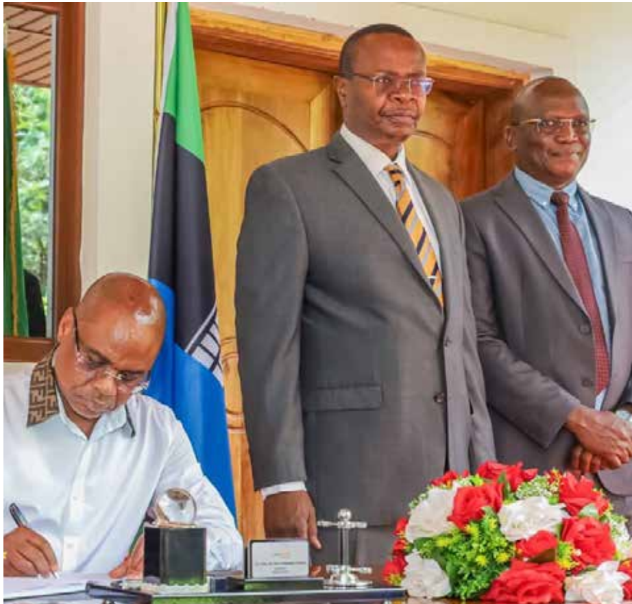
Speaker signs the visitors' book when during the Senate leadership courtesy call to the Office of Governor Paul Otuoma.