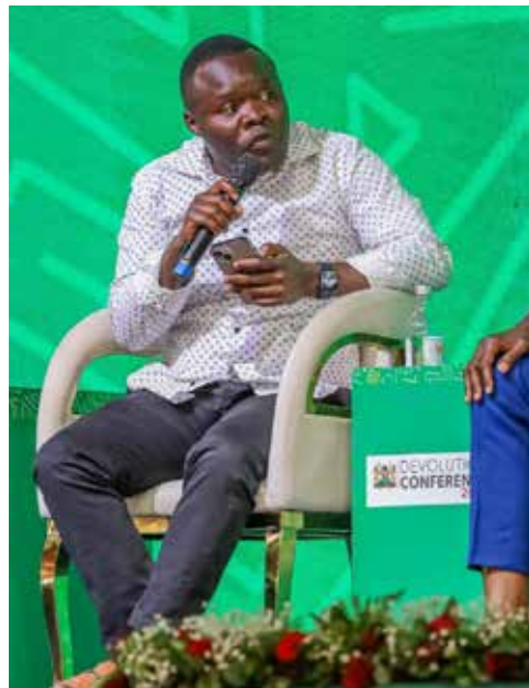
Senator Eddy Oketch

The lawmaker pledged that the Senate will remain steadfast in advocating for