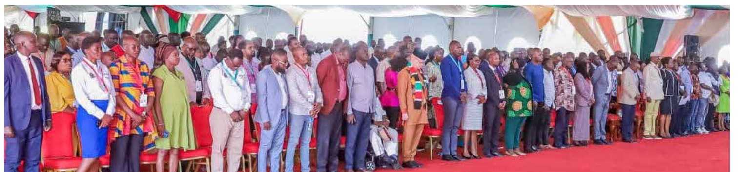
Naibu wa Rais Kithure Kindiki awaongoza viongozi wengine kwa maombi kwenye siku ya mwisho ya Kongamano la Ugatuji kwenye Kaunti ya Homa Bay.

“Pale kwenye ukumbi, majadiliano yamezua maswali kadhaa kwetu, tumeelezwa na kushauriwa kwamba tunafaa kuwa kwenye mstari wa mbele kuliza uwajibikaji na uwazi kutoka kwa viongozi tuliowachagua na wafanyakazi wa umma ambao wamepewa nafasi kusimamia shughuli mbali mbali,” alisema