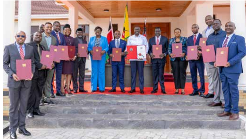
President Ruto is joined by political leaders from the Senate, County Assemblies and the Homa Bay County Executive after he signed the Bill into law.

County Assemblies can now enjoy financial freedom following the decision by President William Ruto to sign into law the County Public Finance Management (Amendment) Bill, 2023.