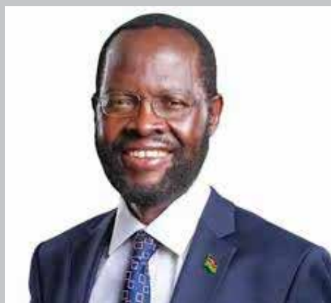
Senator Anyang Nyongo said:

The debate on the Motion was moved by Majority Leader Kithure Kindiki who told the House that the Bill had gone through successful mediation. "It will be recalled when the Forest Bill came to this House, the Senate made significant amendments," he told the House in his moving notes. The Mediation Committee did not differ significantly with those amendments. The Report of the Mediation Committee only touches on four to five provisions. It suggests the inclusion of the provision for a new ground for disqualification of members to the Board. The report also provides for the inspection by the public of the information that will be under the custody of the Chief Conservator of Forests. It provides that any register maintained shall be opened for inspection by the members of the public at the Office of the Chief Conservator of Forests. The information includes licenses issued under the Act, information on community forests, private forests, etc. "I hope that those amendments were well thought out and this being a Constitutional Bill I just want to request that the Senators we support it as it can always be improved," he said, adding that he always believes that there can never be a perfect legislation. "Unless something is automatically and obviously repugnant on the face of it, I really urge Senators to support this Bill. I am sure it can be made better through future amendments."