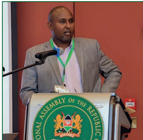
Leader of Minority Party, Hon. Junet Mohamed delivering his speech during Speaker's Round Table with the Kenya Private Sector Alliance (KEPSA)

small and medium enterprises that sustain millions of livelihoods," said Hon. Ichung'wah.