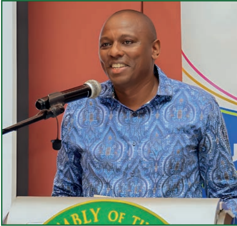
Leader of the Majority Party, Hon. Kimani Ichung'wah making remarks during Speaker's Round Table with the Kenya Private Sector Alliance (KEPSA)