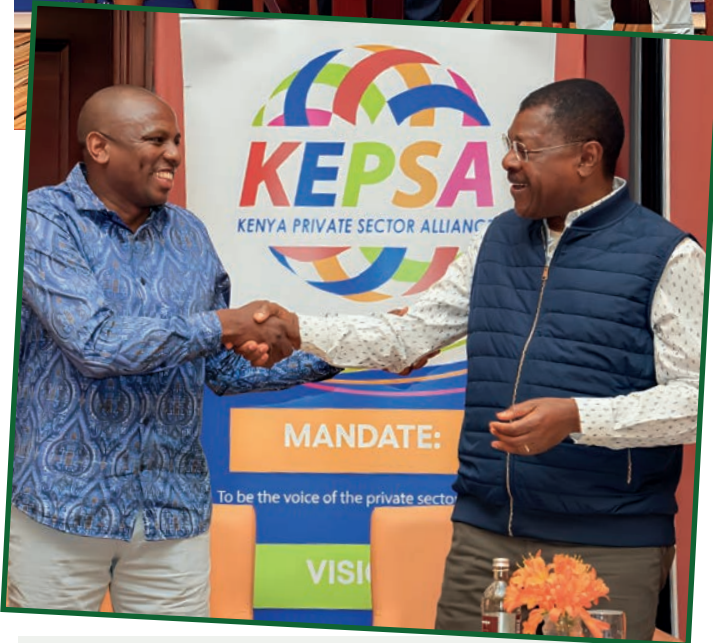
Speaker of the National Assembly, Rt. Hon. (Dr.) Moses Wetang'ula (right) shaking hands with Leader of the Majority Party, Hon. Kimani Ichung'wah (right) after the Roundtable meetings with the Kenya Private Sector Alliance (KEPSA) in Nakuru County on Tuesday, October 29, 2024