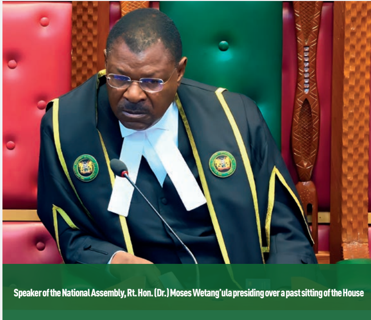
Speaker of the National Assembly, Rt. Hon. (Dr.) Moses Wetang'ula presiding over a past sitting of the House

Its objectives include fostering collaboration and cooperation among Speakers and legislative leaders across Africa. It also aims to establish close ties with the African Union and other international and inter-parliamentary organizations to address shared challenges.