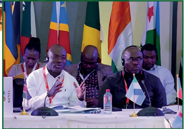
The Fifth Chairperson of Committees, Hon. David Ochieng' (left) making his contribution during the Second General Assembly of the Conference of Speakers and Presidents of African Legislatures (CoSPAL). Hon Ochieng' represented Speaker of the National Assembly, Rt. Hon. (Dr.) Moses Wetang'ula at the conference held on October 26, 2024 and October 27, 2024 in Accra, Ghana