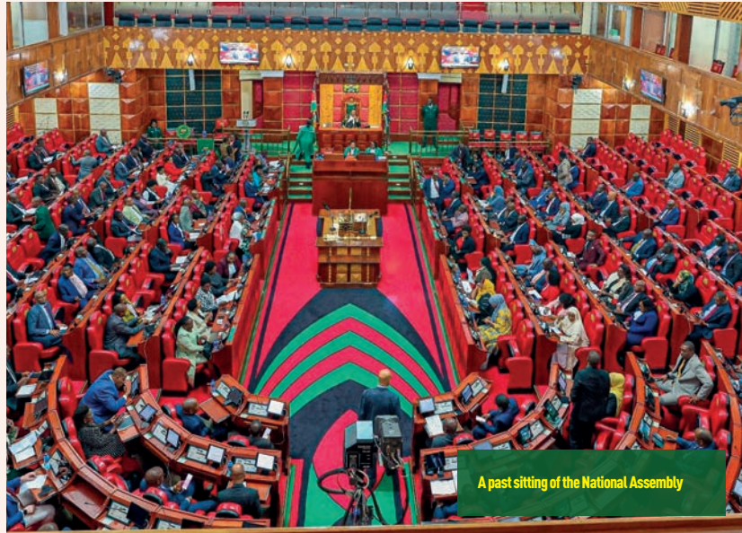
A past sitting of the National Assembly

The House is also expected to consider two Senate Bills' the Equalisation Fund (Administration) Bill (Senate Bill No. 14 of 2023) and the Parliamentary Powers and Privileges (Amendment) Bill (Senate Bill No. 37 of 2023).