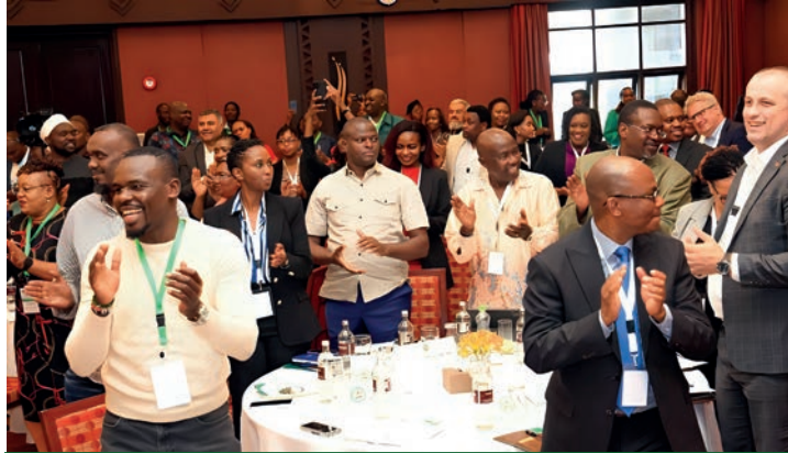
Participants at the recently concluded National Assembly Leadership Retreat applaud a presenter

The Members spoke during the National Assembly leadership retreat where the Cabinet Secretary, Energy and Petroleum, Hon. Opiyo Wandayi made a presentation.