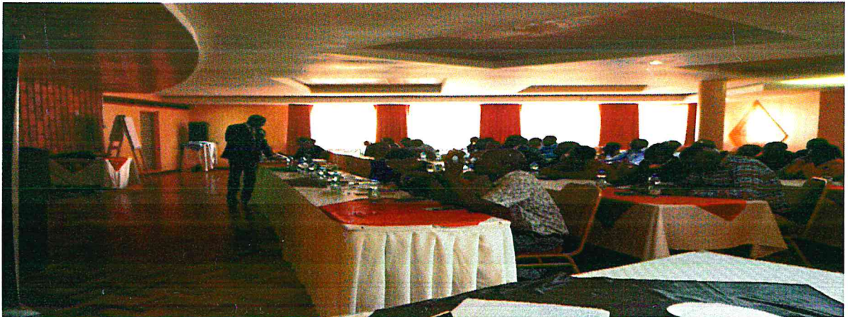
Fig.3. Public Consultation on CPD Guidelines 2024 Meeting held at Sirikwa Hotel in Eldoret on 30 th January 2024