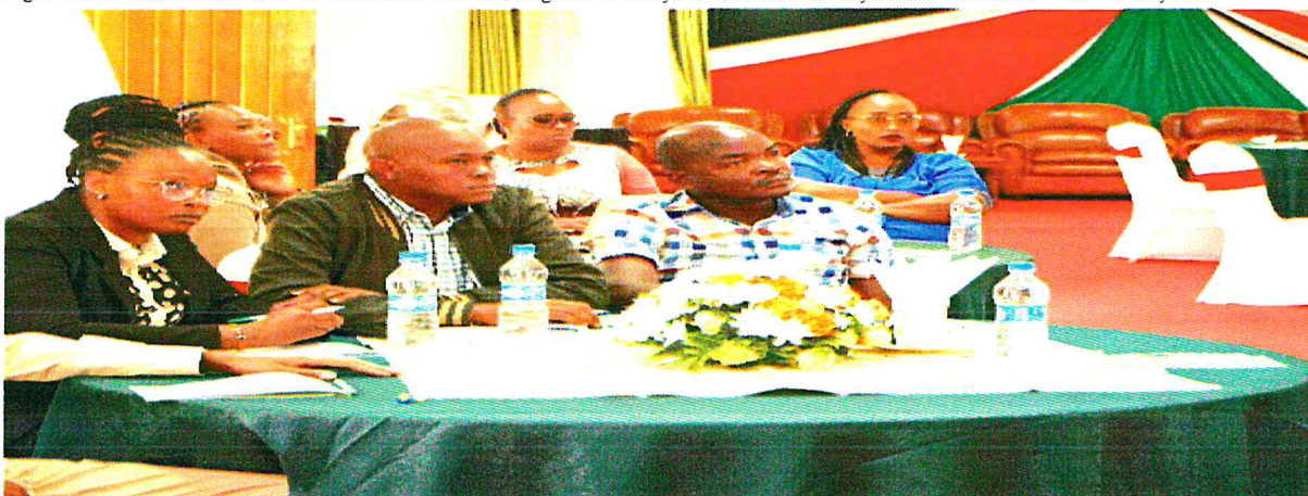
Fig.9. Public Consultation on CPD Guideline 2024 Meeting held at Bomas Of Kenya Nairobi on the 9 th of February 2024