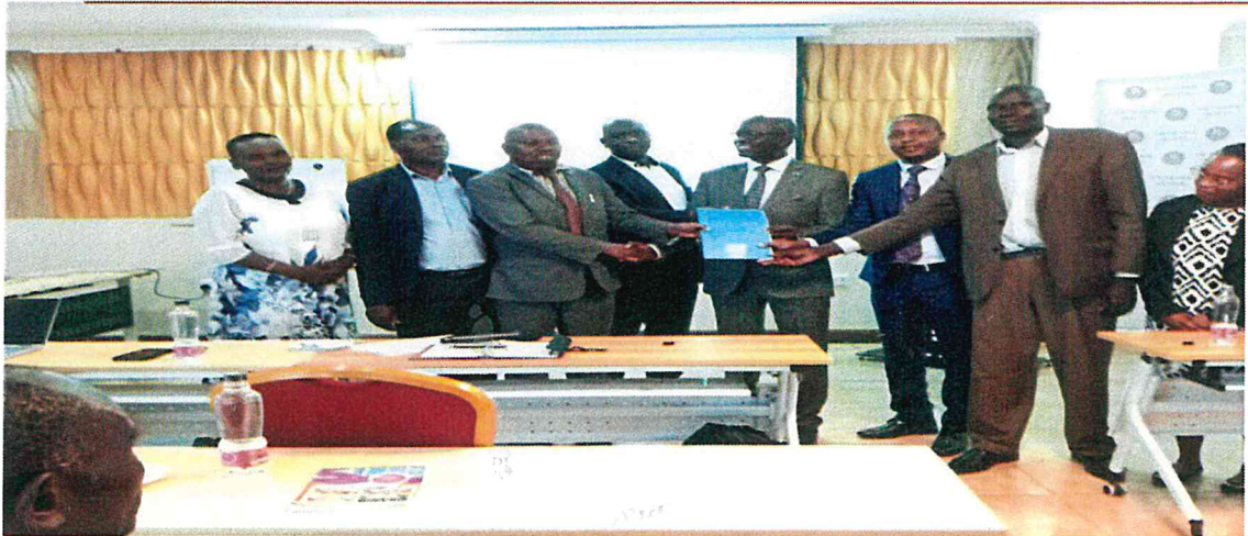
Fig. 1. Public Consultation on CPD Guidelines 2024 Meeting held at Vic Mac Hotel Nakuru 19 th January 2024