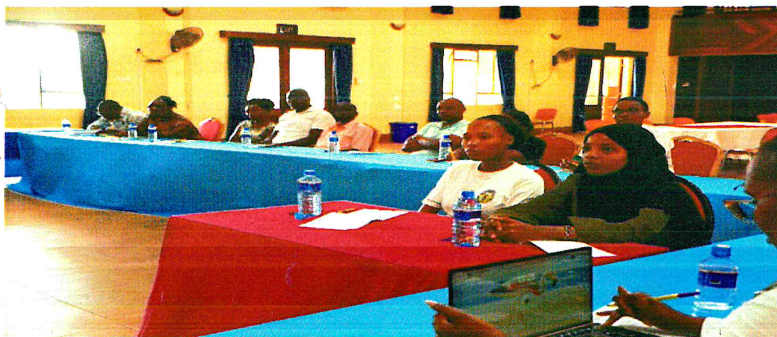
Fig.8. Public Consultation on CPD Guidelines 2024 Meeting held at Kenya Coast National Polytechnic Mombasa 7 th of February 2024