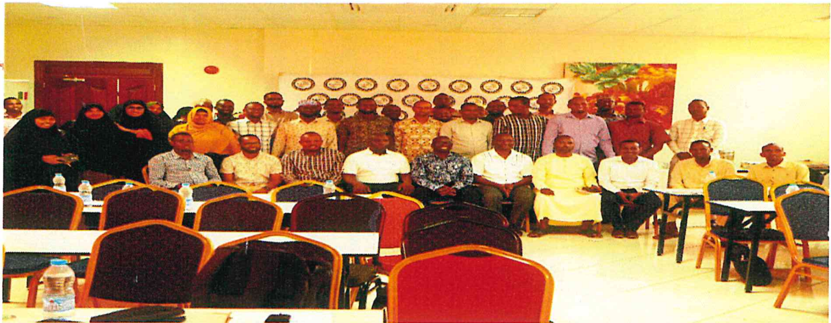
Fig.6 Public Consultation on CPD Guidelines 2024 Meeting held at Oasis Hotel in Wajir on 5 th February 2024