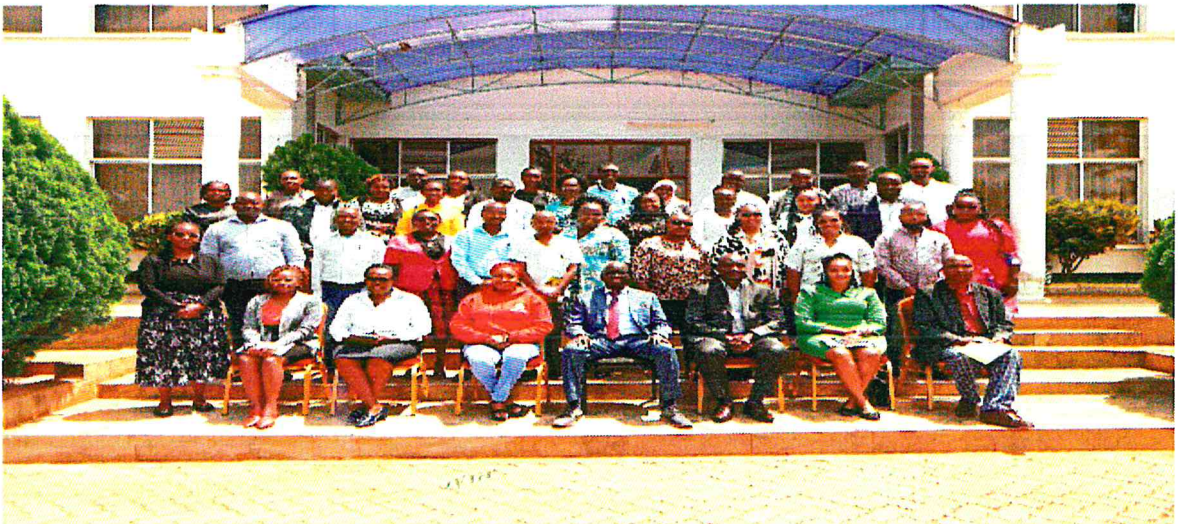
Fig.4. Public Consultation on CPD Guidelines 2024 Meeting held at Kenya School of Gvt Embu on 1 st February 2024