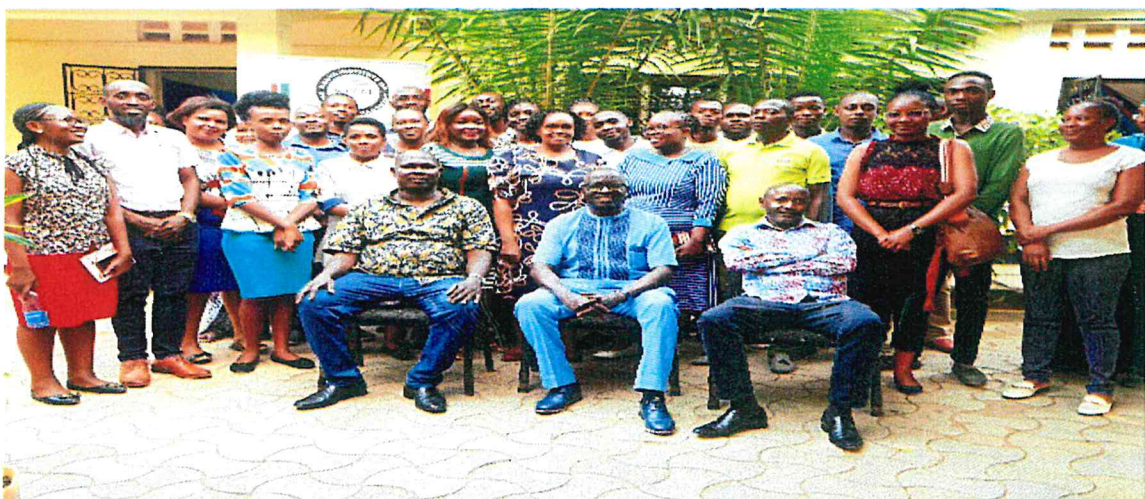
Fig. 7. Public Consultation on CPD Guidelines 2024 Meeting held at Pwani University Kilifi on 6 th February 2024