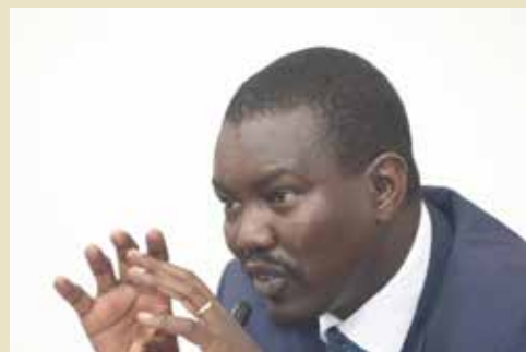
Senator Jackson Mandago, Chair, Committee of Health