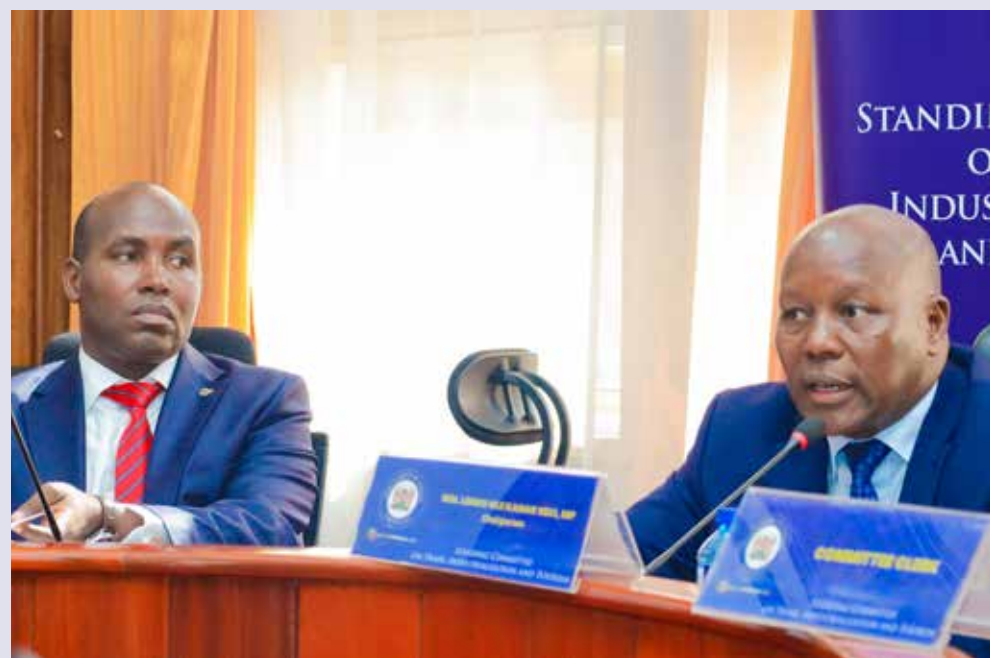
Narok Governor Patrick ole Ntutu when he appeared before the Committee on Trade which was chaired by Senator Lenku Seki ole Kanar (right). Senator Steven Lelegwe looks on.