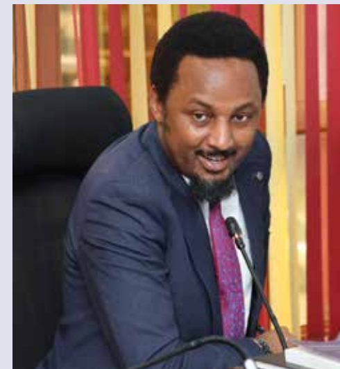
Senator Karungo Thang'wa, Chair, Roads Committee.

Eng Ndungu said the original project scope entailed construction of six interchanges at Lower Kabete, Wangige, Kihara, Ndenderu, Rumenye and Ruaka and the number of interchanges was later appraised to 4 (Lower Kabete, Wangige, Kihara and Rumenye) with at-grade intersection provided at Ndenderu while Ruaka Interchange was rescoped.