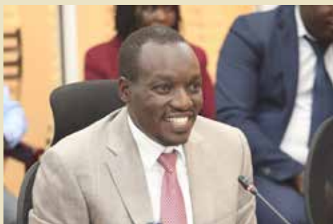
Governor Simba Arati before the Health Committee