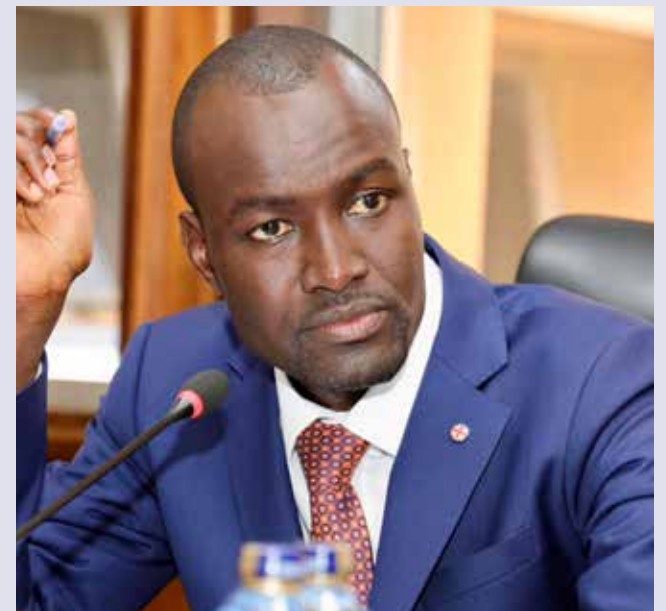
Senator Wakili Sigei

Members of the public who raise concerns over national issues through Petitions filed in the Senate, will henceforth have the right to be supplied with official responses to their concerns.