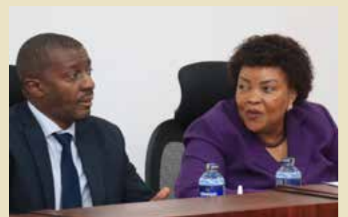
Senator Agnes Muthama and Senator Dan Maanzo