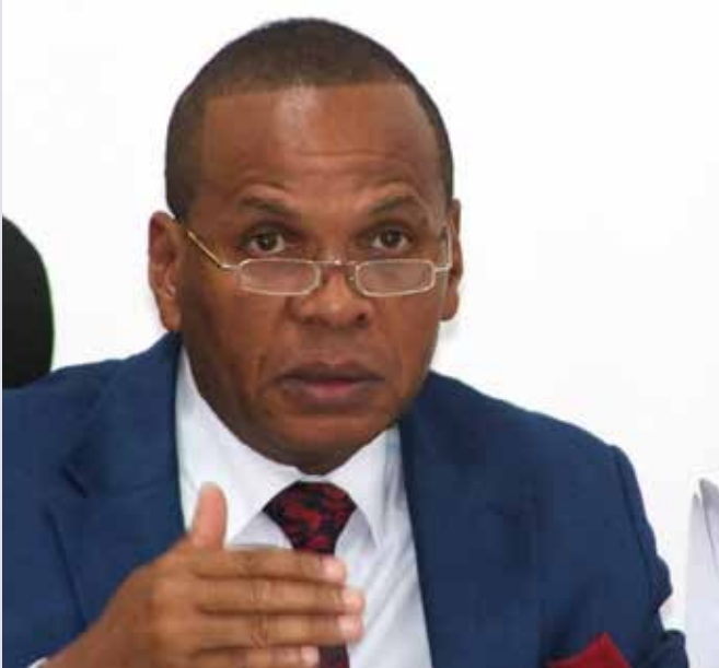
Senator Danson Mungatana