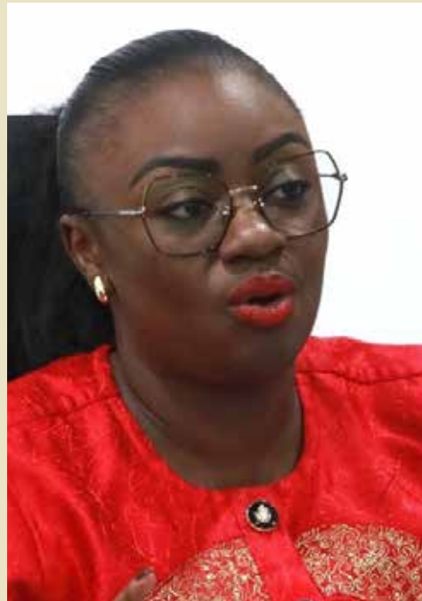
Senator Gloria Orwoba

The budget has gone up from Sh265 million after the Government put in the intervention to ensure that period poverty is eliminated.