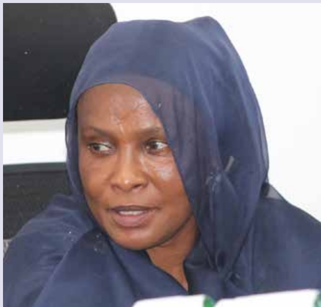
Senator Fatuma Dullo