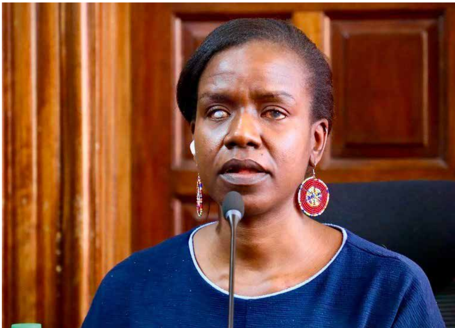
Senator Crystal Asige

The proposed law compels the State to implement mechanisms that will ensure that at least 5 per cent of all elected and appointive bodies are occupied by Persons with Disabilities (PwDs).