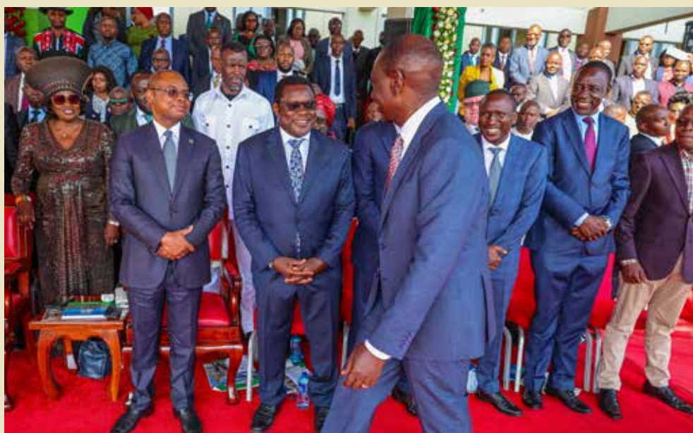
Speaker Amason Kingi and other national leaders welcome President William Ruto to the podium at Masinde Muliro Stadium, Bungoma County, during the 2024 Madaraka Day celebrations.

Speaker Amason Kingi was among national leaders who attended the 61st Madaraka Day celebrations – the day Kenya attained internal self-rule in 1963.