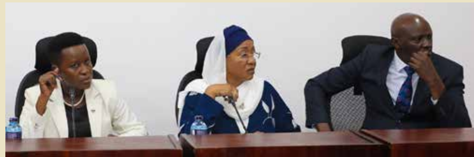
Senator Esther Okenyuri, Senator Hamida Kibwana and Senator Joe Nyutu

Governor Simba Arati has told a committee of the Senate that investigations are under way to determine how medical equipment supplied by the Global Fund to the Kisii Teaching and Referral Hospital (KTRH) disappeared, despite the Hospital having round the clock security, backed up by CCTV.