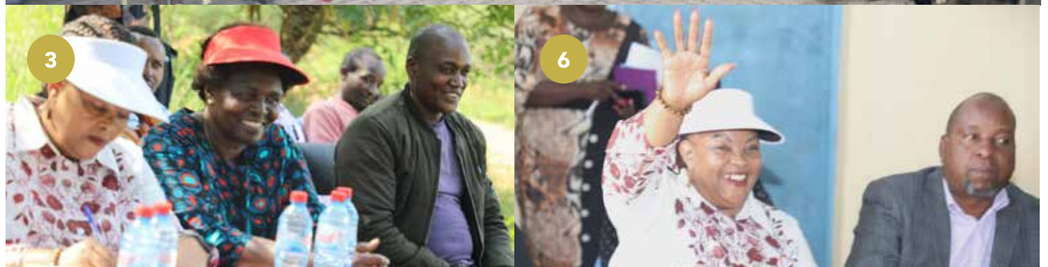
1. Members of the Education Committee, led by Senator Peris Tobiko (centre), with MCAs at the Machakos County Assembly.