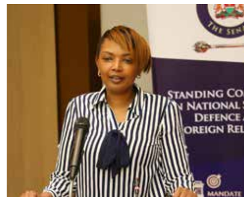
Senator Karen Nyamu

“The Committee should state measures taken to ensure motor cyclists, cyclists and pedestrians wear reflect-