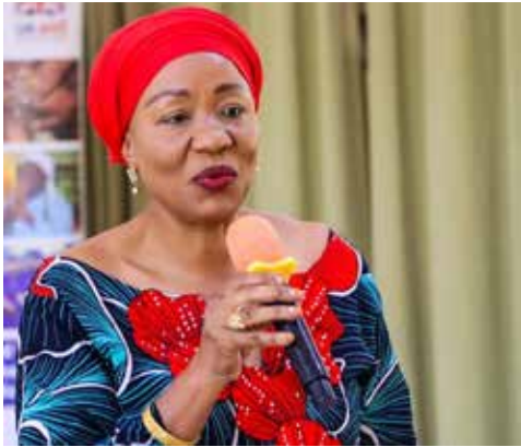
Senator Hamida Kibwana,