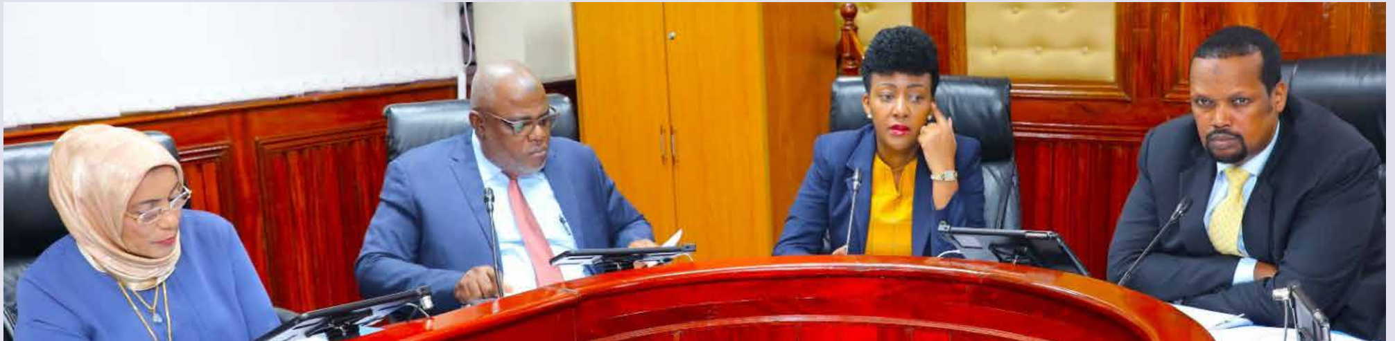
Senator Ali Roba, the chairman of the Finance and Budget Committee, with other members of the committee from left, Senator Shakila Abdalla, Senator Mohamed Faki and Senator Tabitha Mutinda, who is also the vice chair.

A number of County Assemblies are asking the Senate to consider allocating them additional funds in recurrent expenditure in the next financial year.