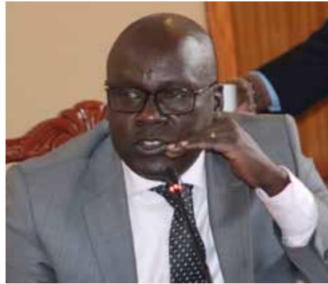
Senator William Kisang