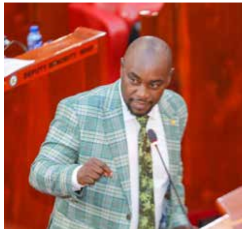
Senator Enoch Wambua