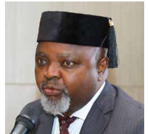
Deputy Speaker Kathuri Murungi

Pressure by the Senate has ensured that County Governments receive Sh400.1 billion in equitable shareable revenue for the 2024/25 financial year.