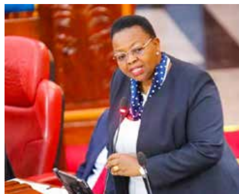
Senator Veronicah Maina

statement concerning the improvement of road infrastructure and enhancement of road safety.