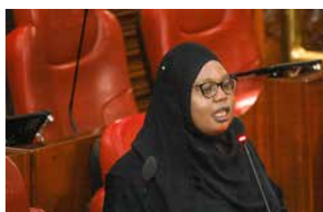
Senator Miraj Abdullahi

"If not addressed, it may never produce the calibre of leaders it has pro-