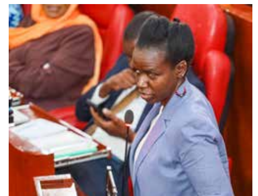
Senator Crystal Asige

The Senator wants an explanation on the direct benefits of the United States to Kenya STIP Agreement, the contents of the US to Kenya STIP with respect to tariffs on agricultural products and particularly poultry importation in Kenya from the USA and to the extent it will affect poultry farmers in Kenya.