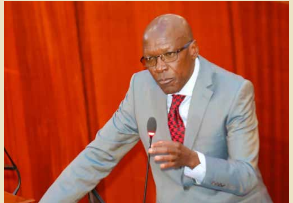
Senator Boni Khalwale, the sponsor of the Public Transport (Motorcycle Regulation) Bill, 2023.

The functions of the Board shall include developing policies, regulations,