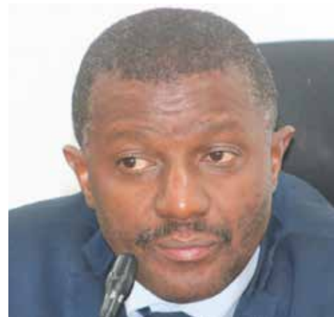
Senator Dan Maanzo