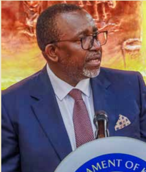
Agriculture Cabinet Secretary Mithika Linturi speaks on the floor of the House last week

The Cabinet Secretary for Agriculture and Livestock Development Mithika Linturi has denied claims that 236 million kilogrammes worth of unsold tea stock are lying in