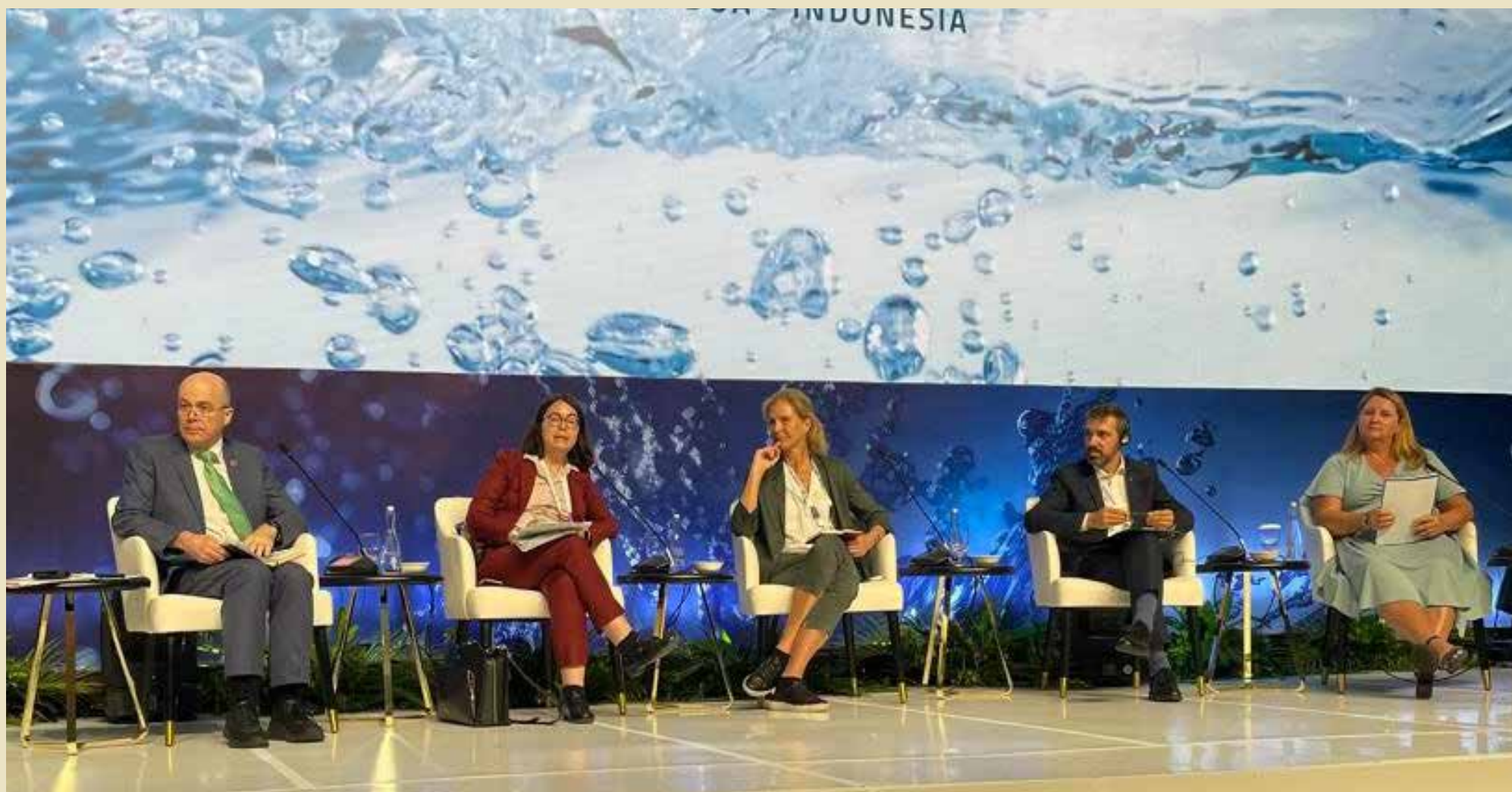
Panel discussion during the 10th World Water Forum in Bali, Indonesia.