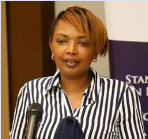
Seneta Karen Nyamu

K amati ya Barabara, Uchukuzi na Makazi inatakiwa kutoa taarifa kuhusu hali ya usalama barabarani na uimarishaji wa miundomsingi ya barabara.