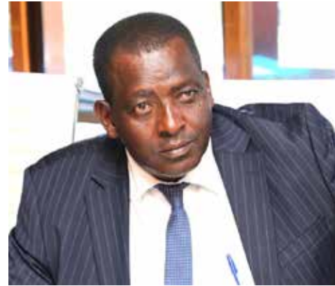
Senator George Mbugua

With the World Cup qualifier matches and Africa Cup of Nations competitions on the cards, a Senator has moved to the House to seek information on the level of the Country's preparedness.