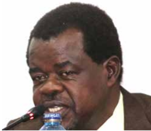
Senator Okiya Omtatah

The Senate figures were arrived at through a study. They were not random and cannot be randomly varied. Let the counties have their cake. What they do with the cake is the work of the Senate. We will go down there to ensure that the money is used according to the law - Senator Okiya Omtatah