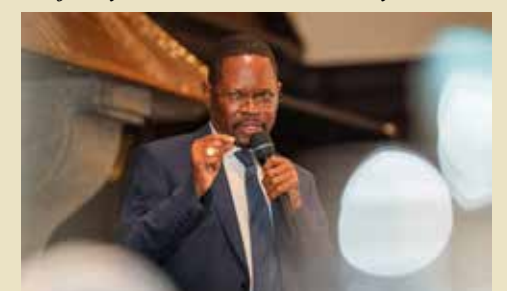
Minority Leader Stewart Madzayo

on the validity of election of a member of a county assembly shall be final