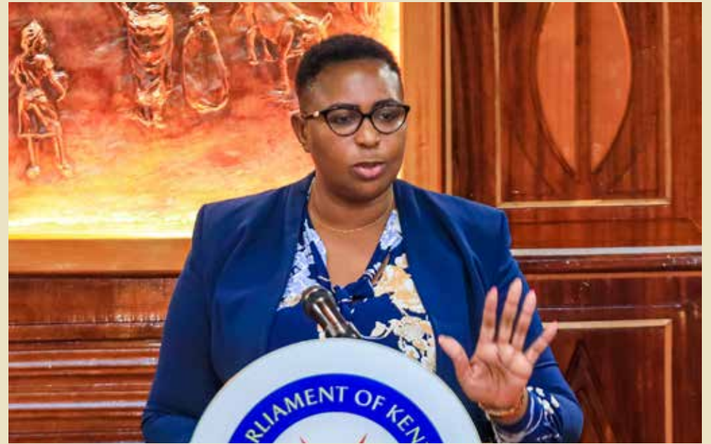
Cabinet Secretary Aisha Jumwa speaks in the House on Wednesday, April 24.

"Your office has a responsibility to ensure that the money reaches 33 counties. Even if there are no plans by the