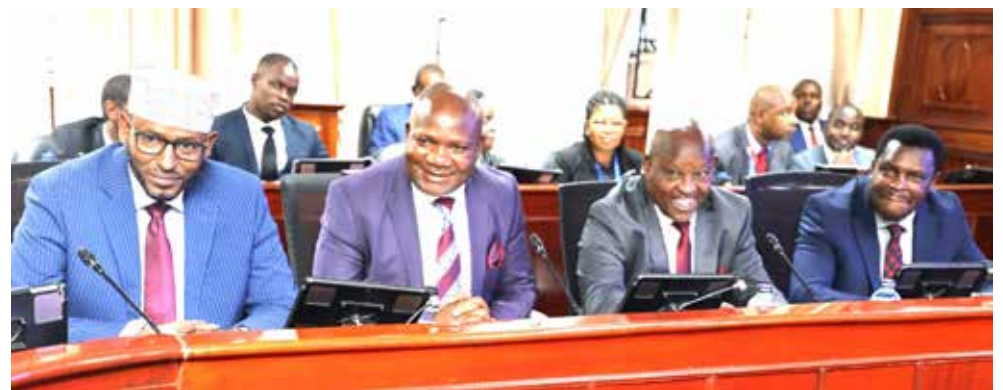
Top: Governor Ahmed Abdillahi, the vice chair, Council of Governors, Governor Fernandes Barasa, Governor Mutahi Kahiga and Governor Muthomi Njuki when they appeared before the Finance committee.

In its submission to the committee, which is chaired by Senator Ali Roba, the Council of Governors proposed a minimum allocation of Sh439.5 billion for 2024/25 financial year as equitable shareable revenue.