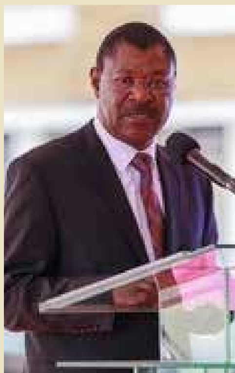
Speaker Moses Wetangula, who is also the chairman of the Parliamentary Service Commission, addresses the gathering after the Building was unveiled.

National Assembly Speaker Moses Wetang'ula has revealed that the newly inaugurated Bunge Tower faced the risk of becoming a stalled project.