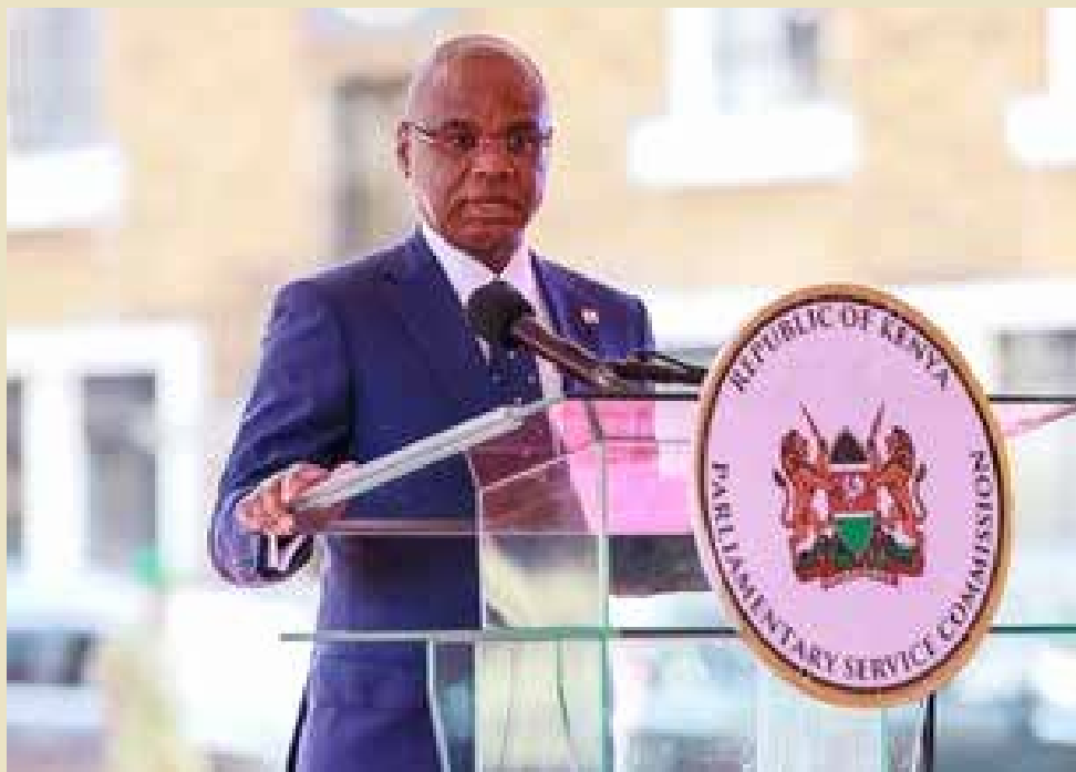
Senate Speaker Amason Kingi delivers his address during the official opening of the Bunge Tower

Speaker Amason Kingi has heralded the opening of Bunge Tower, describing it as a godsend for Parliament even as he revealed that Parliamentary Service Commission will save as much as Sh400 million annually in rental expenses.