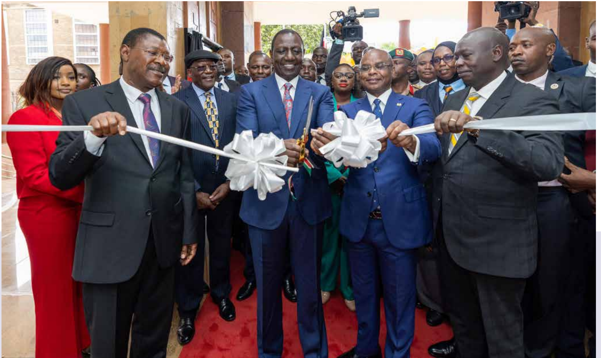
President William Ruto cuts the tape to signal the official launch of the Bunge Tower on Thursday, April 25. He is flanked by Speaker Moses Wetangula (left), Deputy President Rigathi Gachagua (right) and Speaker Amason Kingi (second right).

tage of the new world class building, to offer world class services to Kenyans.