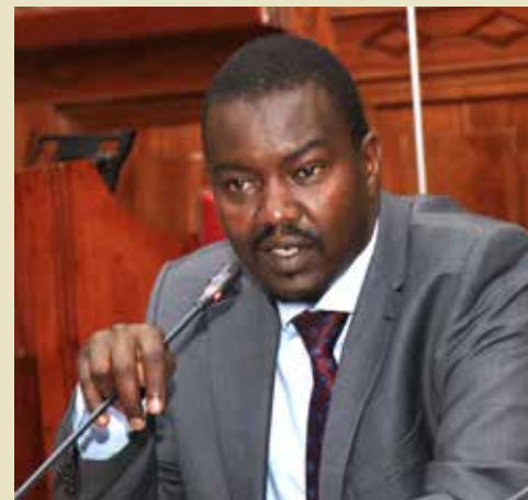
Senator Jackson Mandago, the chair, Senate Health Committee.