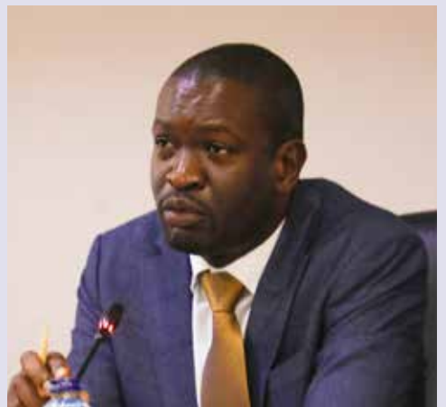
Senator Edwin Sifuna