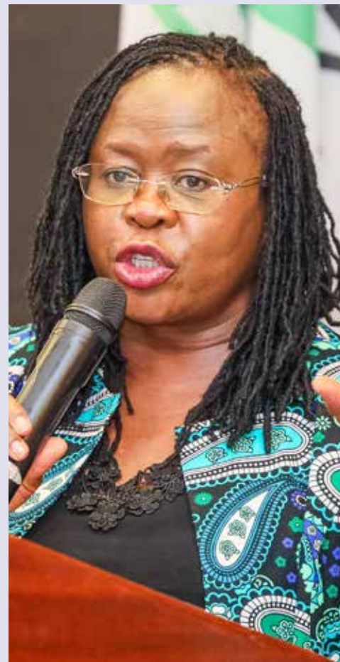
Senator Catherine Mumma

“This law is a good law for our counties especially because we have massive land and little population and people who have come to invest there, but they are not paying rates. The National Rating Act will enable county