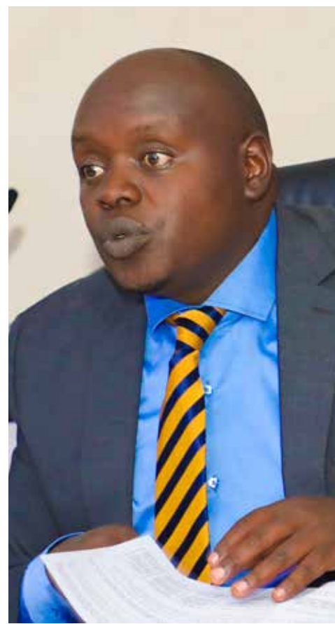
Senator Samson Cherarkey