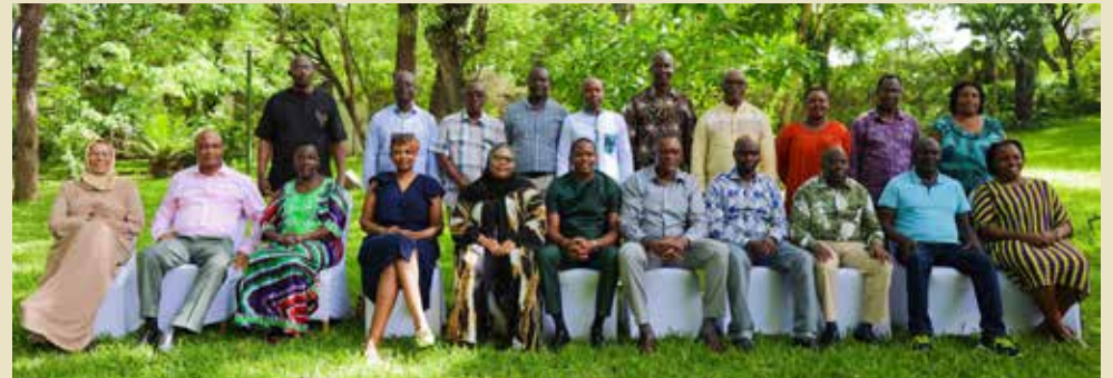
Members of the Committee on ICT in a group picture with the stakeholders in the ICT space after the retreat that explored how the two sides can collaborate.

The ICT Committee is pushing for collaboration with the stakeholders to boost partnership among the various sector players with a view of making the country become one of Africa's leading technology hubs.