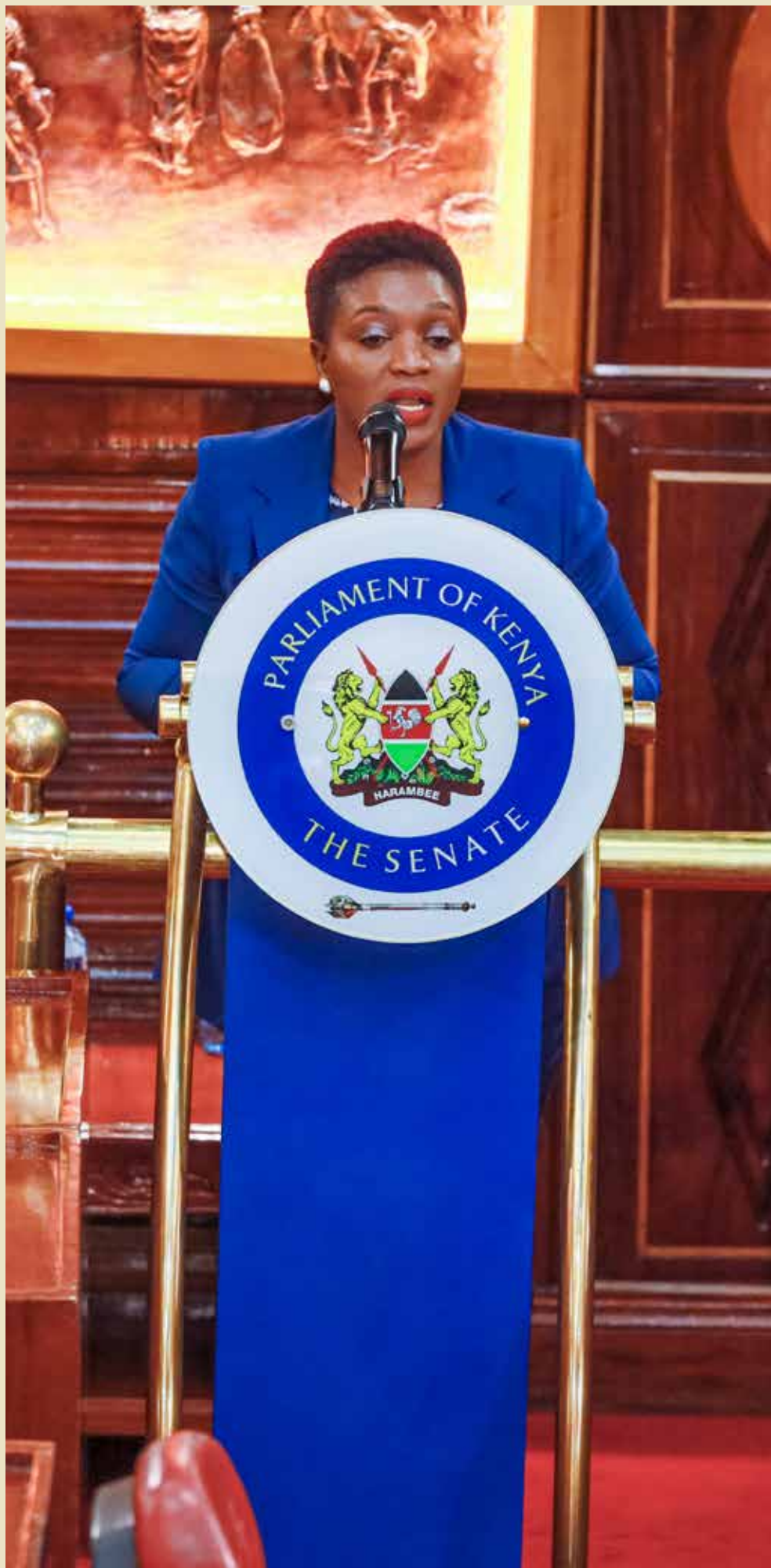
Health CS Susan Nakhumicha address Senators.

H ealth CS Susan Nakhumicha has said the state agencies are investigating 10 health care providers in relation to medical insurance fraud.