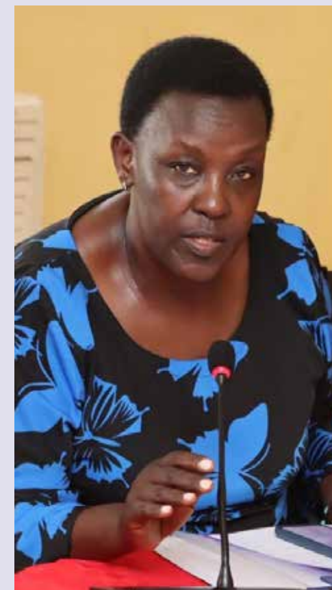
Senator Beatrice Ogola