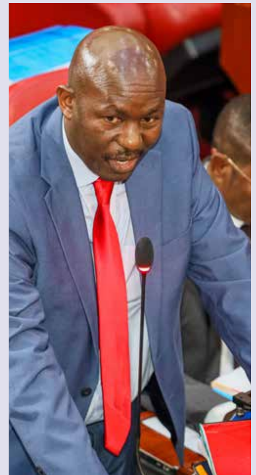
Senator Okongo Omogeni

“We are putting in place a mechanism to ensure that there is equity and fairness in collection of land rates from Kenyans,” he said.