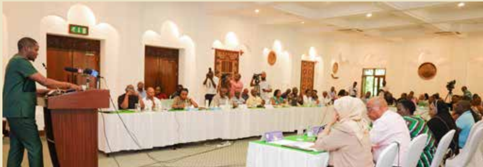
Senator Allan Chesang, the chair of the Committee on ICT, addresses stakeholders in the ICT sector during the retreat in Mombasa.