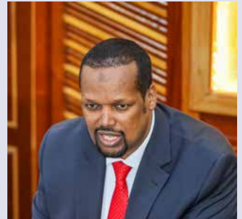
Senator Ali Roba

Kadhalika kiongozi huyo anataka Bunge lifahamishwe kuhusu kilichozingatiwa kuondoa mitambo ya jenereta ya megawati tano iliyokuwa inaendeshwa na wahudumu binafsi mjini Manderu akiitaka Kampuni ya Kenya Power kuweka wazi hatua ambazo imechukua kuirejesha na kuimarisha mitambo ya jenereta iliopo ili kusambaza umeme wa kutosha mjini Manderu.