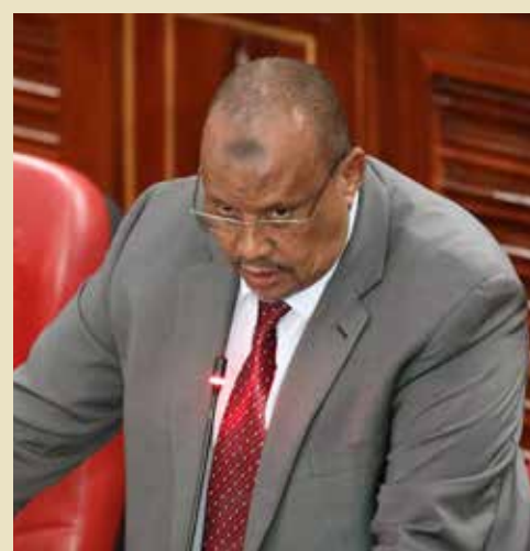
Senator Abbas Sheikh

The retreat saw members deliberate on matters relating to Devolution and Intergovernmental Relations, including the status of transfer of devolved functions. This includes the valuation and verification of assets and liabilities be-