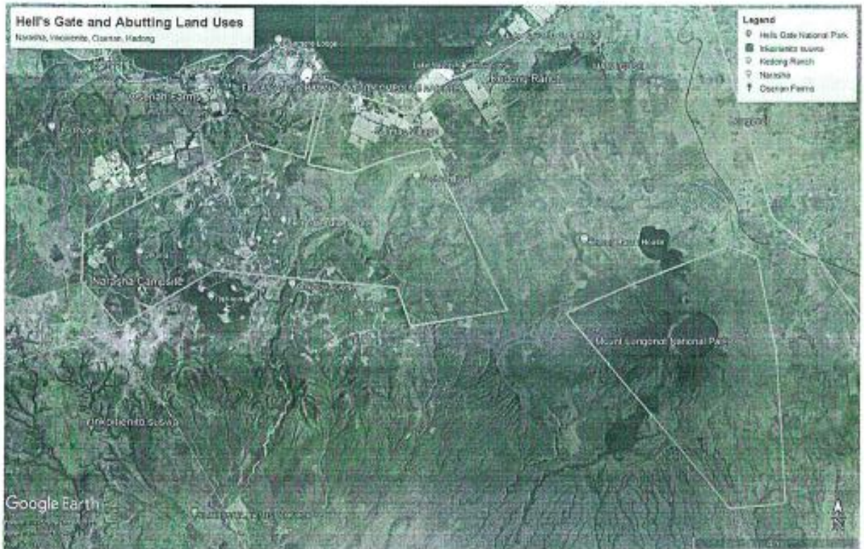
Map of the Park and its surroundings

56. To safeguard the integrity of the park, an alternative road passing through Oserian Development Company land and bordering Hell's gate National Park would be a lasting option. The government should engage the Oserian Company to cede the access road.