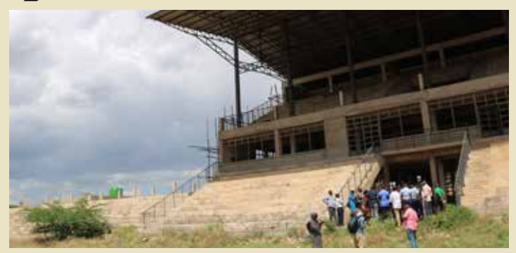
Part of Isiolo Stadium whose construction works have stalled since 2021.