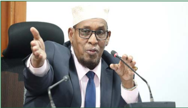
Chairperson Committee on National Cohesion and Equal Opportunities, Hon. Yussuf Haji gestures as he explains a point when he chaired a meeting between the Committee and Members of Parliament from six counties affected by banditry and cattle rustling

The Public Accounts Committee chaired by Hon. John Mbadi (nominated) has called for an increase in funding to the Office of the Auditor General to enable it operate as an independent and well equipped entity.