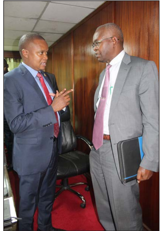
Chairperson Departmental Committee on Finance and National Planning, Hon. Kuria Kimani (left) confers with Governor of the Central Bank of Kenya (CBK) Governor, Dr. Kamau Thugge after a meeting held in Parliament last week