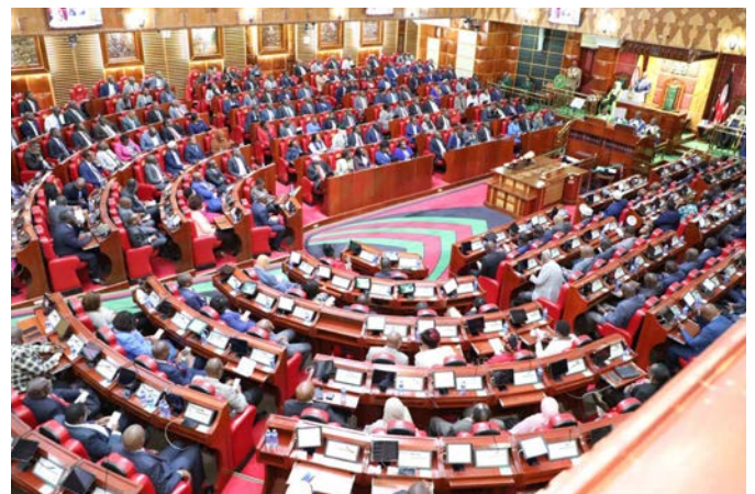
A sitting of the National Assembly. The House recently adopted a report by the Departmental Committee on Health on its consideration of the Agreement on Establishment of International Vaccine Institute

Currently, the IVI supports the KBI as it seeks to establish itself in bio manufacturing of human vaccines