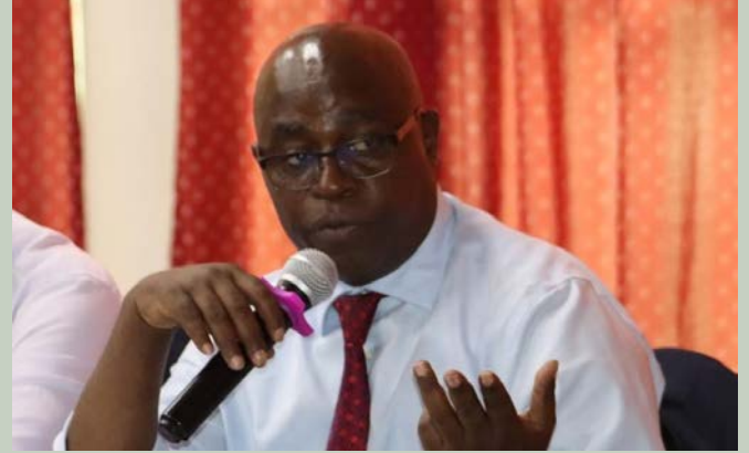
Chairperson Departmental Committee on Lands, Hon. Joash Nyamoko (North-Mugirango) seeking clarification over the alleged irregular land dispossession claims by residents of Machakos County

The Departmental Committee on Lands met with Members of the Drumvale Farmers Cooperative Society regarding their petition on alleged illegal liquidation of their assets.