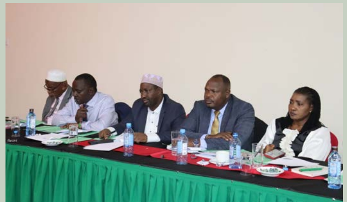
A section of the Members of Departmental Committee on Lands listening to a presentation by the petitioners

“I want to assure you that we will do everything in our powers to get down to the bottom of this matter. I will find out from the Senate on the status of their deliberations to avoid duplication of issues,” Hon. Nyamoko said.