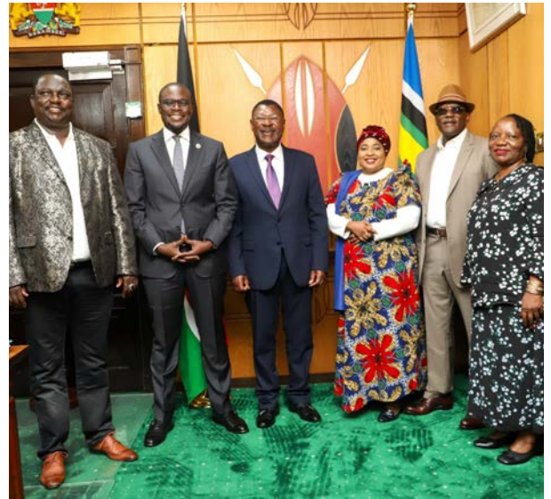
Speaker of the National Assembly, Hon. Moses Wetang'ula (centre), Nairobi Governor, H.E Johnson Sakaja (second left) pose for a photograph with PSC Commissioners during a courtesy visit in the Speaker's office last week

After the meeting, the Speaker led the team on a tour of Bunge Towers.