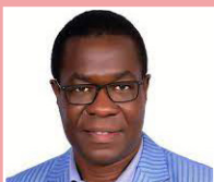
Hon. Opiyo Wandayi (Ugunja) contributing on Affordable Housing Bill, on Thursday 15th February, 2024

“Who in Kenya is going to afford 10 per cent of the value of the affordable housing unit? Who? What we are simply doing is to create opportunities for the people who are already propertied and wealthy like you and I to use proxies to deposit 10 per cent of the value of those units then acquire as many units as possible. How have they addressed the issue of access to housing under Article 43(1) (b) of the Constitution?”