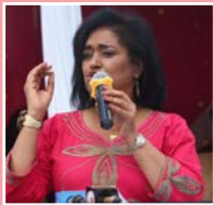
Hon. Esther Passaris (Nairobi City County) contributing on a Motion of adjournment of a matter of national importance regarding rising femicide cases in Kenya, on Wednesday, 14th February, 2024

“It is incumbent on the Government of Kenya to implement Articles 26 and 29 of the Constitution of Kenya 2010, the Protocol to the African Charter on Human and People’s Rights, the rights of women in Africa, Maputo Protocol and the Convention on Elimination of all Forms of Discrimination against Women to ensure women and girls are safe and free from all forms of gender-based violence. While Kenyan Government agencies have made various commitments and pledges, few have been followed by concrete actions to end the surge of femicide in the country. Kenyan Members of Parliament are calling on key actors to prioritize investigations and prosecution of cases of gender-based violence.”