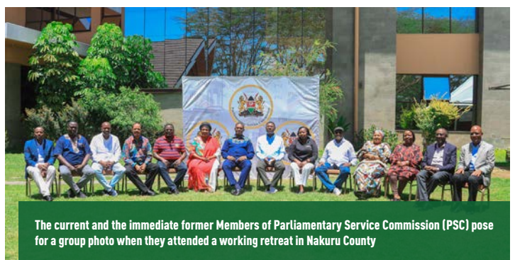
The current and the immediate former Members of Parliamentary Service Commission (PSC) pose for a group photo when they attended a working retreat in Nakuru County

"It was a pleasure interacting with former Commissioners who were led by my predecessor and AG Hon. Justin Muturi during the retreat aimed at building stronger bonds and synergy within the Commission," said Hon. Wetang'ula.