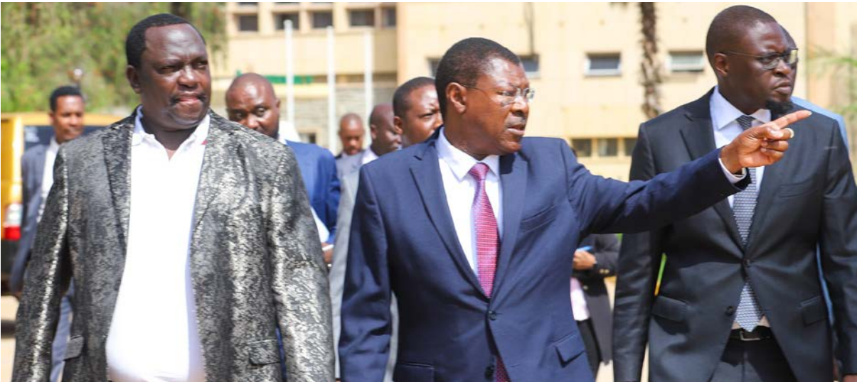
Speaker of the National Assembly and Chairperson of the Parliamentary Service Commission (PSC), Rt. Hon. (Dr.) Moses Wetang'ula (centre), Nairobi Governor, H.E Johnson Sakaja (right) and PSC Commissioner, Hon. Patrick Makau during a tour of the proposed Bunge Square