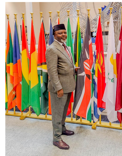
Deputy Speaker of the Senate Hon Kathuri Murungi attends the 3rd Organization of African, Caribbean and Pacific States (OACPS) Parliamentary Assembly and 43rd Organization of African, Caribbean and Pacific States (OACPS) - European Union (OACPS-EU) JointParliamentary Assembly (JPA), in Brussels, Belgium last week.