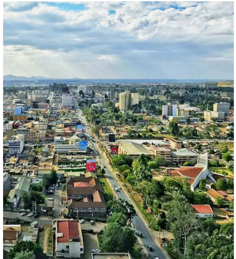
A view of Eldoret Town.

“If Eldoret Municipality is elevated to city status there are enormous benefits which include growth in infrastructural development and it will also lead to economic growth through establishment of new businesses, “the report read in part.