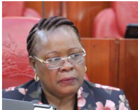
Water Cabinet Secretary, Hon Alice Wahome (left) before Senate Committee on Land, Environment and Natural Resources last week.

On the Exploitation of water in Sasumua and Konoike dams, Hon. Wahome told the Committee that the combined catchment area of the Sasumua include, Chania and Kiburu streams is approximately 12, 800 hectares. To date over 53,000 indigenous trees have been planted within the catchment with the aim of ensuring sustainable exploitation of the water resource and conservation of catchment area, and in order to ensure