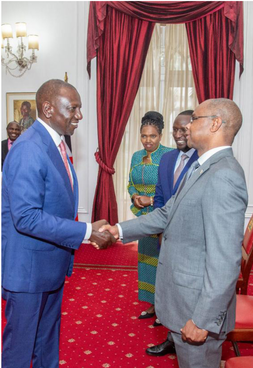
President William Samoei Ruto chats with Speaker of the Senate Rt Hon Amason Jeffah Kingi at State House, Nairobi, moments before the Head of State assented to the two Senate laws on Friday, June 30th, 2023.