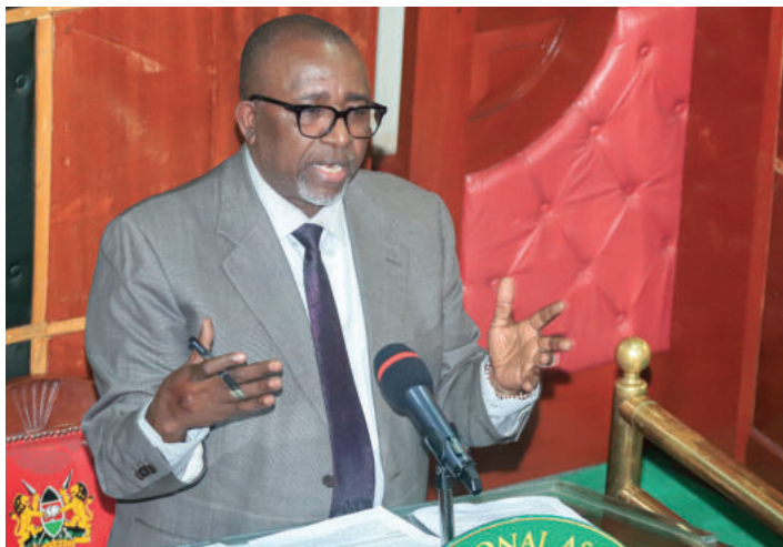
Agriculture and Livestock Development Cabinet Secretary, Hon. Mithika Linturi responding to MPs Questions

H on. Mithika Linturi, Cabinet Secretary for Agriculture and Livestock Development has informed Lawmakers that 500,436 farmers in 40 counties have accessed 3,302,683 bags of subsidised fertiliser.