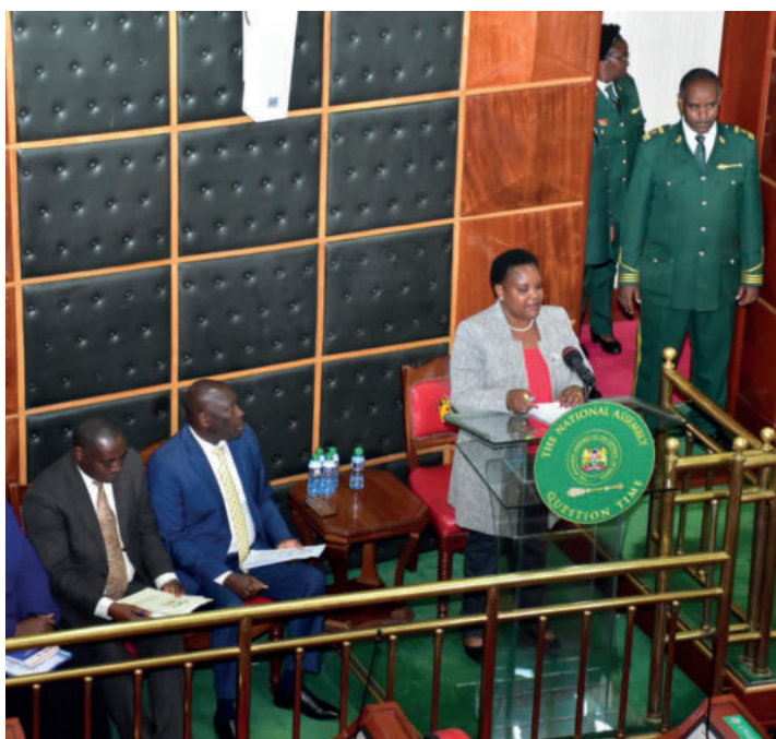
Cabinet Secretary for Labour and Social Protection, Hon. Florence Bore when she appeared before the House to respond to Members’ Questions, last week.

T he Labour and Social Protection Cabinet Secretary (CS) was last week forced to apologize to the National Assembly for skipping two crucial House appearances.