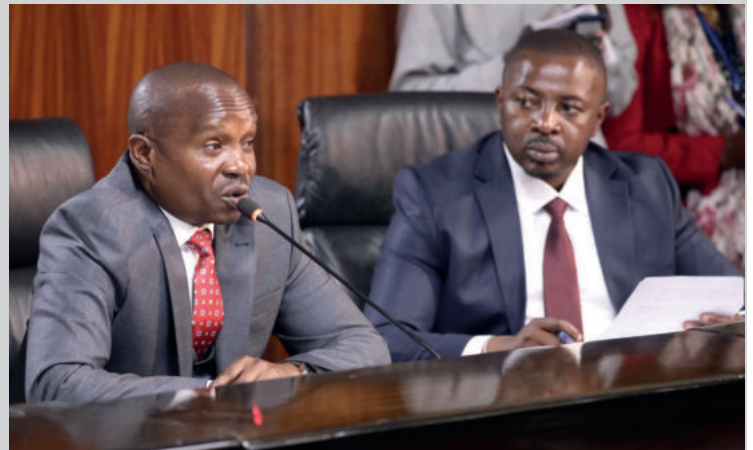
Interior and National Government Administration Cabinet Secretary Hon. Prof. Kithure Kindiki appearing before the education Committee

"We cannot direct TSC on what to do as its an independent Commission, we can only recommend to them what to do. But when the threat reaches a certain threshold, we can impose mandatory regulations to ensure the safety of teachers, and we shall do so without hesitation."