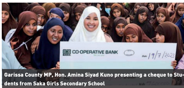
Garissa County MP, Hon. Amina Siyad Kuno presenting a cheque to students from Saka Girls Secondary School

Garissa County MP, Hon. Amina Siyad Kuno, has unveiled a Kshs. 7.6 million bursary program under the National Government Affirmative Action Fund at Saka Girls Secondary School.