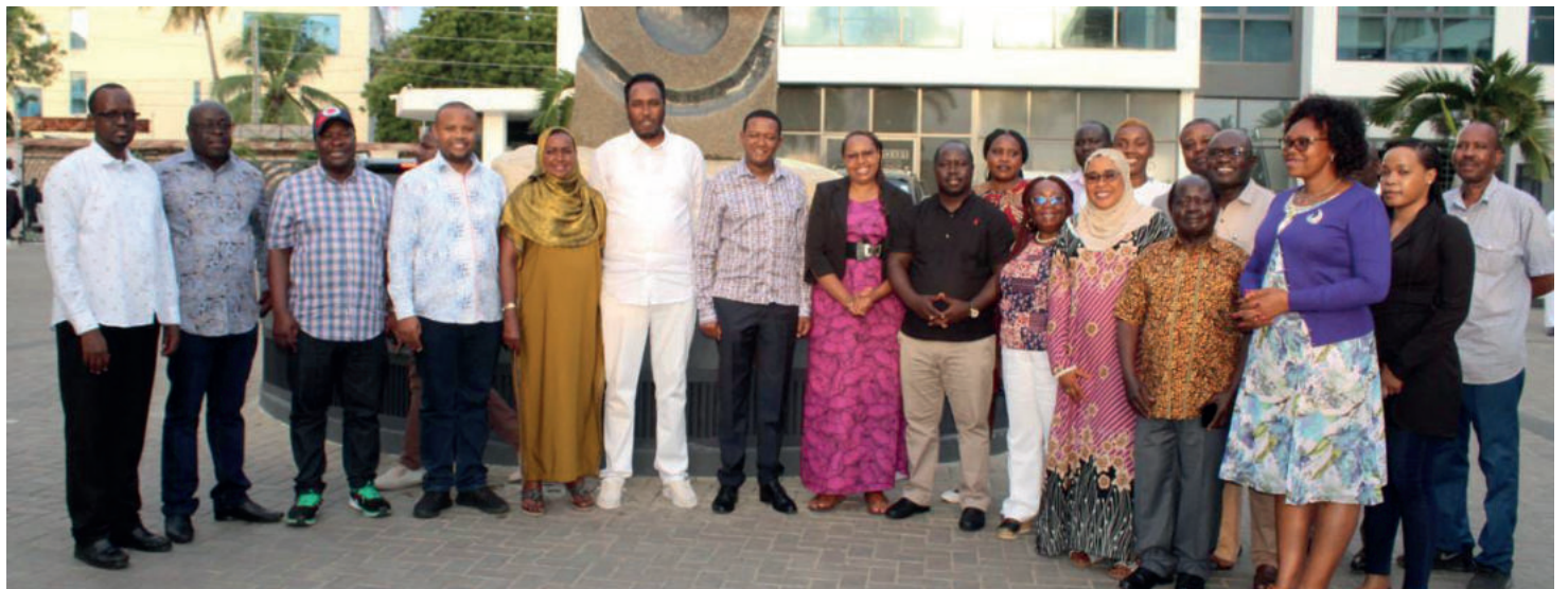
Members of Regional Integration Committee in a group photo with Alfred Mutua, the Foreign and Diaspora Affairs CS, after their engagement meeting in Mombasa County.