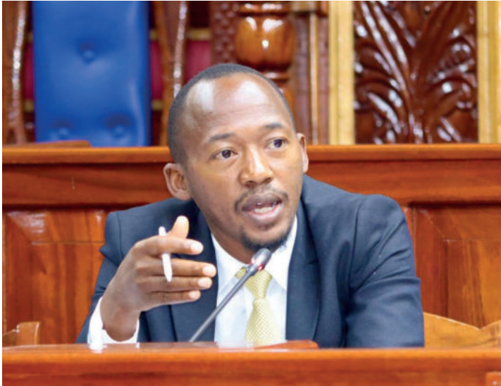
The Chairperson of Energy Committee, Hon. Vincent Musyoka during a meeting with Independent Power Producers last week

In an effort to cushion Kenyans against the high cost of electricity in the country, the departmental Committee on Energy chaired by Mwala MP Hon. Vincent Musyoka last week warned Independent Power Producers (IPPs) against entering into unstructured Power Purchase Agreements (PPAs) with Kenya Power (KPLC).