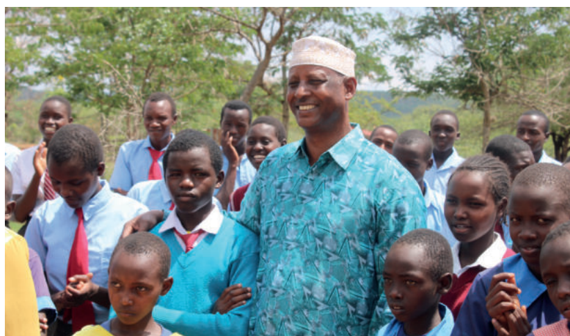
The Vice Chairperson of the Committee on Administration and Internal Security Hon. Dido Rasso, MP Saku, poses with pupils from Arabal Primary and Secondary School in Baringo County, during a Security Assessment visit by the Committee in the region