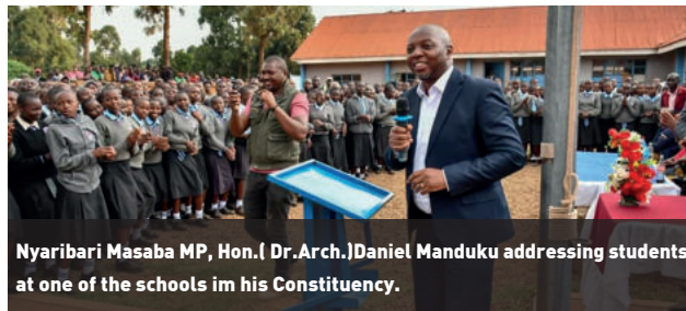
Nyaribari Masaba MP, Hon. (Dr. Arch.) Daniel Manduku addressing students at one of the schools in his Constituency.

Hon. (Dr. Arch.) Daniel Manduku, the Nyaribari Masaba MP, distributed cheques amounting to Sh 50 million to thirty-nine schools in his constituency.