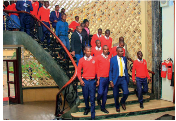
South Mugirango MP, Hon. Silvanus Osoro giving a tour of Parliament Buildings to students of Nyamondo Secondary School.