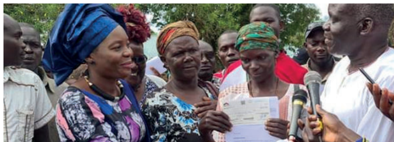
Busia County MP, Hon. Catherine Omanyo (Second Left) receives handshakes of appreciation from parents whose children were beneficiaries of the Busia County NGAAF Bursary programme.

Hon. Catherine Omanyo, the Busia County Women Representative, has brought relief to hundreds of students from marginalized and disadvantaged backgrounds by distributing bursaries to cover their school fees.