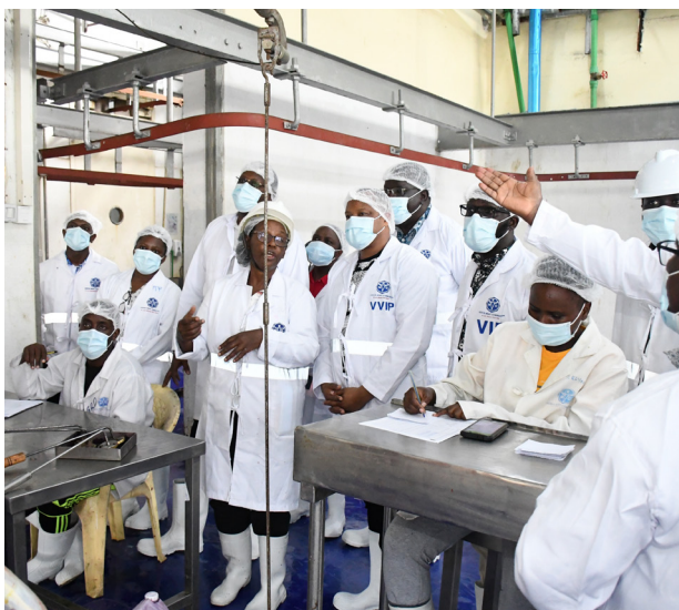
■ Members of the Agriculture and Livestock Committee keenly observing the meat packaging process at the KMC plant in Kibarani, Mombasa County.