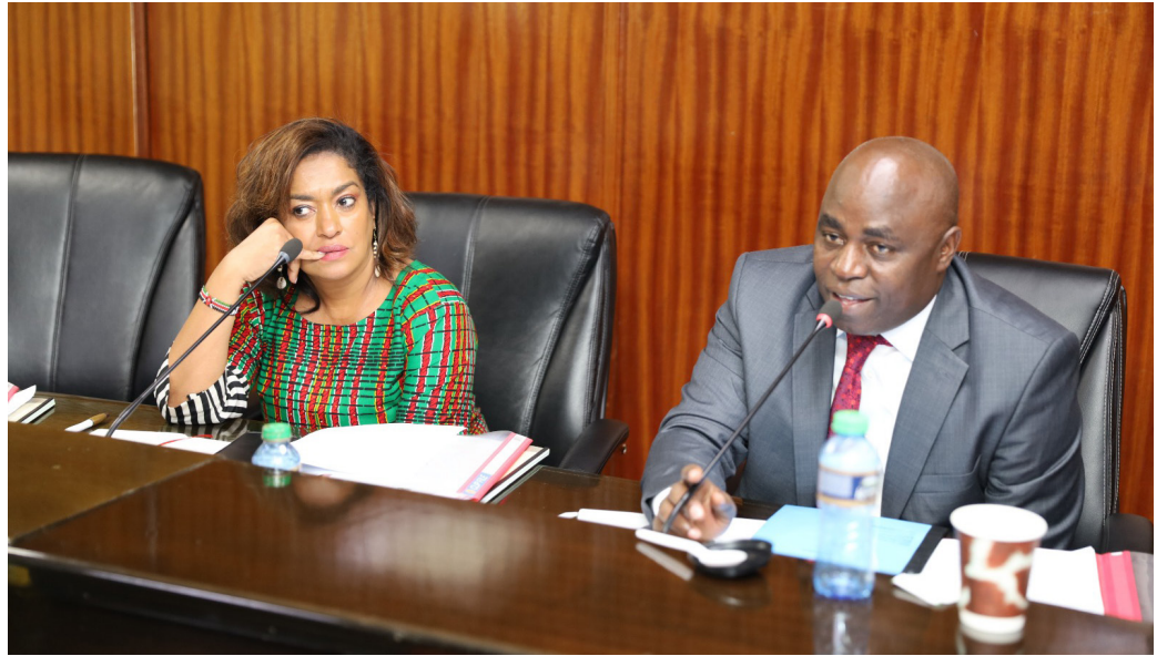
■ North Mungirango MP Hon. Joash Nyamoko (Right) and Nairobi County MP Hon. Esther Passaris, during a meeting with Kandara Residents Association.

Government of Murang'a of renewing the company's leases without public involvement, in violation of Section 13 of the Land Act, 2012. Upon scrutiny of the submitted documents, the Committee discovered that 4,843 acres of land in Murang'a County and 2,696 acres of land in Kiambu County had been reverted back to the respective counties.