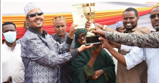
Hon. Adan Keynan hands over a trophy to one of the top performing schools in Eldas Sub-County.

Eldas Member of Parliament Hon. Adan Keynan convened an education day and prize giving event to celebrate academic champions in Eldas Sub-county.