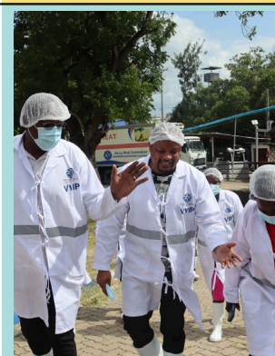
Members of the Agriculture and Livestock Committee at the Kenya Meat Commission Facility in Kibarani, Mombasa >> Page 4