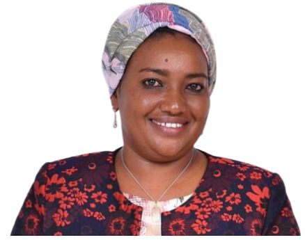
~ Marsabit County MP Hon. Naomi Waqo

government the responsibility of matters of health policy; concerned that, according to the World Health Organization (WHO), mental and neurological disorders are common and about ten (10) percent of the global population suffer from at least one mental health disorder at any given time; concerned that, psychiatric units are only available in a few facilities in the country and patients requiring psychiatric services have limited or no access to these facilities; acknowledging that, access to healthcare facilities would lead to improved overall health, increased economic productivity, social equity and improved quality of life for all; now therefore, this House urges the National Government, through the Ministry of Health, to collaborate with County Governments to develop a policy integrating mental health services in all healthcare facilities in the country.