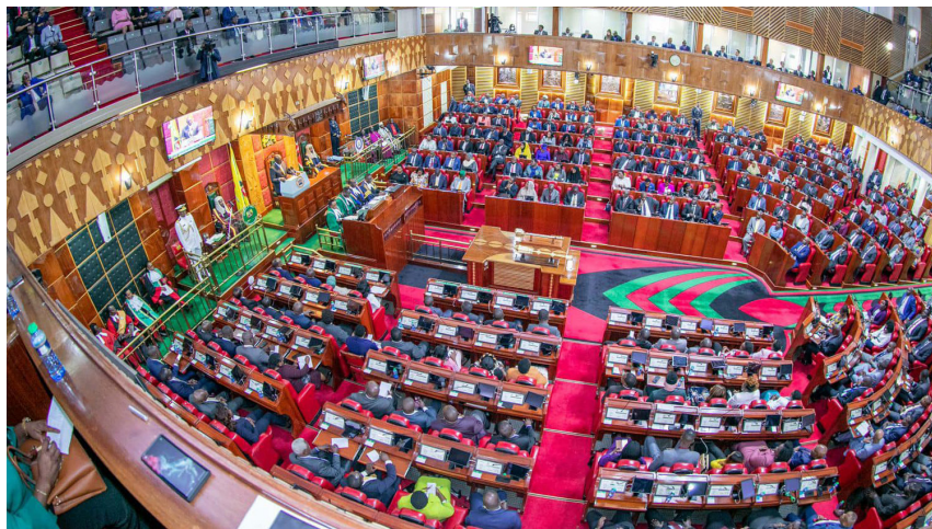
■ The National Assembly in session. The House adjourned House Business on Thursday to discuss recent spike in terrorist attacks in the Country.

The National Assembly on Thursday adjourned normal business to discuss recent resurgence in terrorist attacks in the Country.