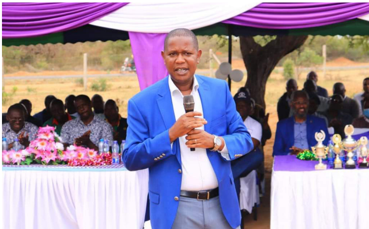
■ Kibwezi West MP Hon. Mwengi Mutuse in a past engagement with his constituents.

Kibwezi West MP, Hon. Mwengi Mutuse has tabled a Notice of Motion calling on the Government to institutionalize rainwater harvesting and develop an affirmative action plan for investment in rainwater harvesting purification, storage, and distribution. The lawmaker specifically wants the government to address this matter in the Arid and Semi-Arid areas.