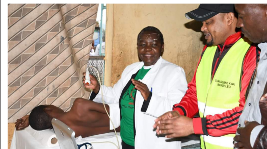
A patient receives free medical care at Mogogosiek, Konoin Constituency. Looking on (In a reflector jacket) is the area MP, Hon. Brighton Yegon .

The MP also disclosed that 25 out of the 80 children diagnosed with heart conditions were referred to Mater Hospital, Nairobi for further treatment, stating that his office will subsidize their travel and NHIF facilitation.