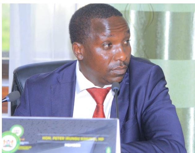
Kangema MP Hon. Peter Kihungi while attending a session of the National Assembly Public Investments Committee on Commercial Affairs and Energy at parliament Buildings.

Kangema MP, Hon. Peter Kihungi, is advocating for a revision of the law to transfer the management of village polytechnics to the National Government Constituencies Development Fund (NG-CDF).