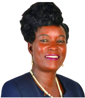
~ Teso South MP Hon. Mary Emaase

That, aware that Article 29 of the Constitution provides the right of every person to freedom from any form of violence; further aware that, Gender-Based Violence (GBV) is a serious violation of human rights with records indicating that one in every three women will experience sexual or physical violence in their lifetime; noting that according to the UN Refugee Agency (UNHCR), Gender-Based Violence includes sexual, physical, mental and economic harm inflicted in public or in private and may