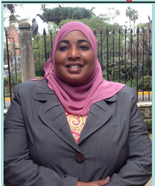
Likoni MP champions inclusion of mental health programmes in hospitals >> Page 10