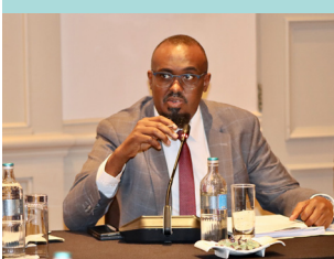
Consolidated Fund Service Expenditures for FY 2022/23 expected to increase by Kshs. 24.78 billion from the revised Supplementary I Estimates; MPs told. >> Page 7