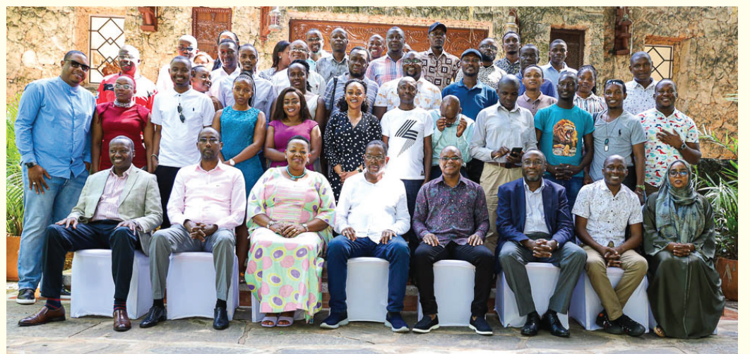
Senate Speaker Rt Hon Amason Jeffah Kingi ((fourth right, seated) with the Senate Leadership and Kenya Parliamentary Journalists Association members in this group photo during the retreat in Mombasa on Friday June 9th, 2023.

He said the journalists were determined to carry out their duties objectively. Even as they seek good working relations with the Senate, the media will keep its autonomy and execute their mandate boldly and independently, he added.