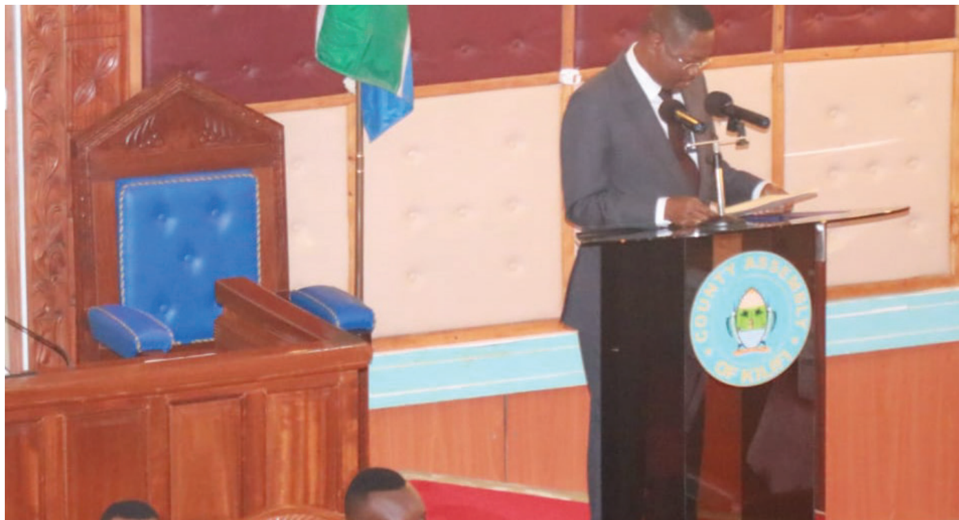
Leader of the Minority Party in the Senate Hon Stewart Madzayo, who is the Senator of Kilifi County addresses Kilifi County Assembly on April 19 th , 2023.

Leader of the Minority Party in the Senate, Hon Stewart Madzayo, has hailed the Kilifi County people for electing as their Senator for a third term in a row, pledging to use this opportunity to push for more funds to the county to boost development.