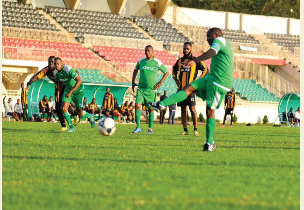
Majority leader Hon. Aaron Cheruiyot scores his penalty kick in an encounter between Bunge FC and TMK Wazee from Kahawa Wendani.

The outcome notwithstanding, the lawmakers took solace in having pushed the visitors to the wall in the first half, resulting in the 2-0