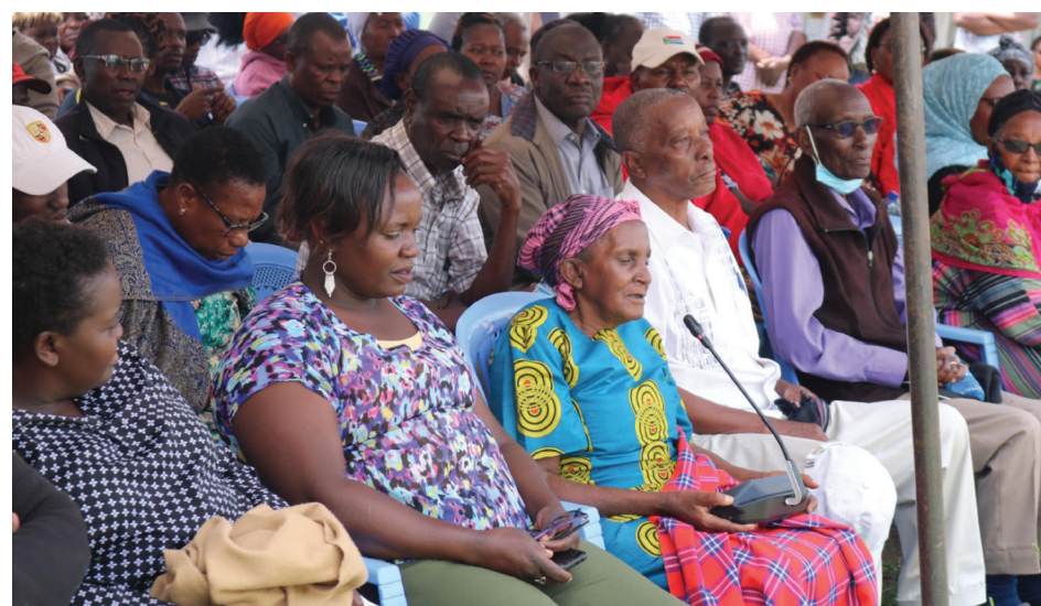
Top: Senate Committee on Roads, Transportation and Housing chaired by Kiambu Senator Karungo Thangwa(2 nd L) in a public meeting in Kajiado County. Members present were; Vice Chairperson Sen. Peris Tobiko(L), Senate Minority Leader Hon. Stewart Madzayo (2 nd R) and the host Senator Seki Lenku. In the second photo, members of the public keenly follow proceedings of the committee.