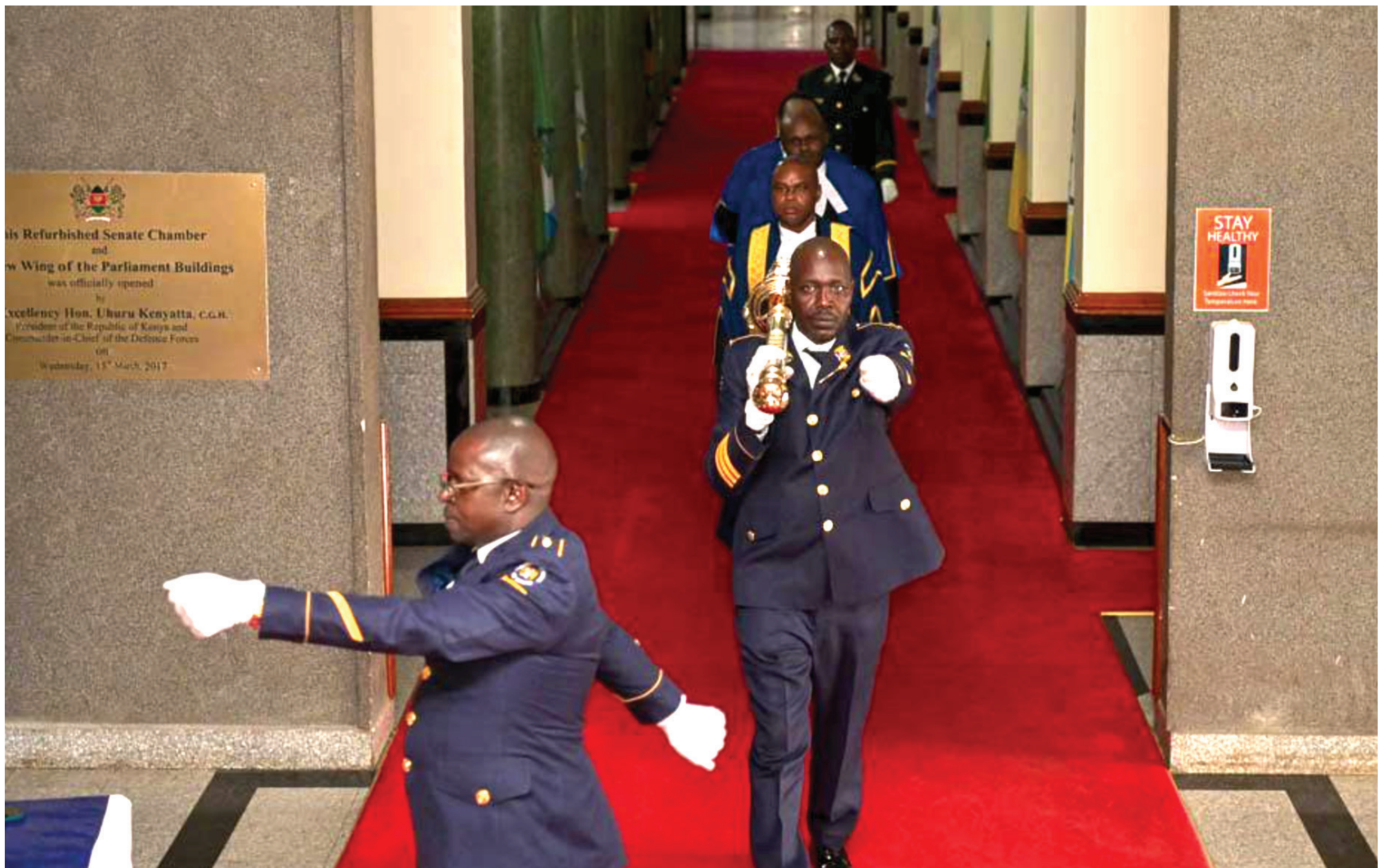
The official procession of the Speaker of the Senate, Rt. Hon. Amason Jeffah Kingi, makes its way to the Chamber on Wednesday, May 31, 2023