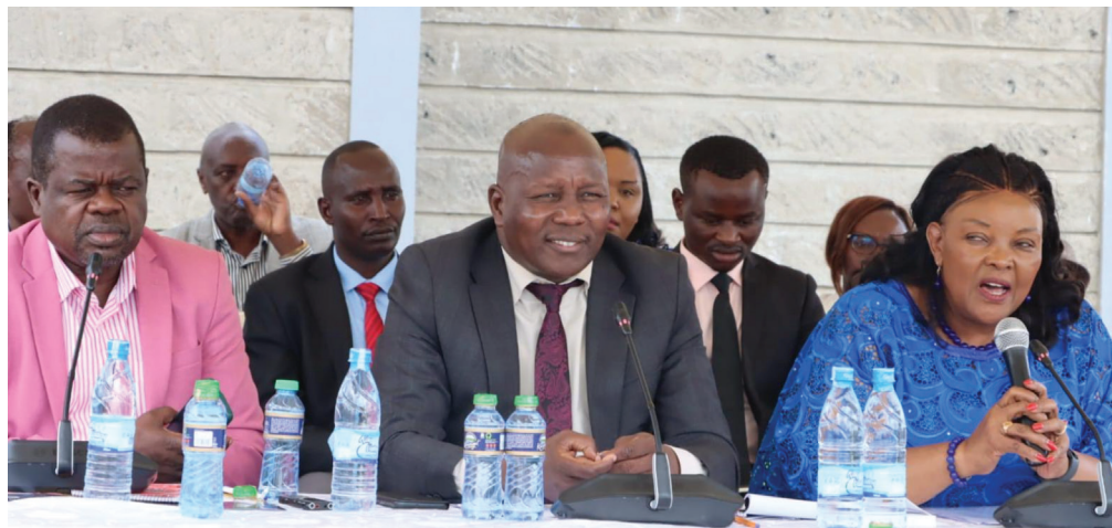
Senator Andrew Okiya Omtatah, Senator Lenku Ole Kanar Seki (chair) and Senator Agnes Kavindu Muthama during the committee session.

The Senate Standing Committee on Trade, Industrialization and Tourism Chaired by Kajiado Senator Lenku Ole Kanar Seki embarked on a fact-finding visit to Machakos County on the