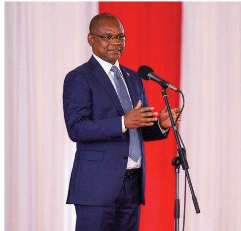
Speaker of the Senate Rt Hon Amason Jeffah Kingi addresses the National Prayer Breakfast.

President William Samoei Ruto, his Deputy Rigathi Gachagua and National Assembly Speaker, Rt Hon