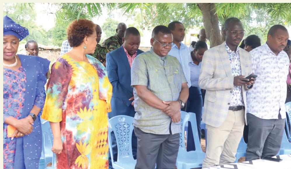
Senators Joseph Githuku(R) James Lomenen (2 nd R) Mwenda Gataya Mo Fire(Centre) and Betty Montet(2 nd L) who are members of the Senate Committee on National Cohesion, Equal Opportunity and National Integration during a recent meeting with the public in Tharaka Nithi.

Several schools and churches have also been torched during the clashes between the two counties. The Committee which was on a fact-finding visit to Tharaka Nithi