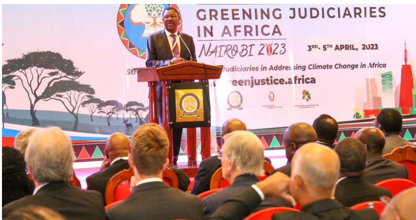
National Assembly Speaker Rt. Hon. (Dr.) Moses Wetang'ula addresses third Regional Symposium on Greening Judiciaries in Africa. The Summit which brought together Chief Justices from the Continent harmonized efforts to tackle climate change in a bid to accelerate the delivery of climate justice.