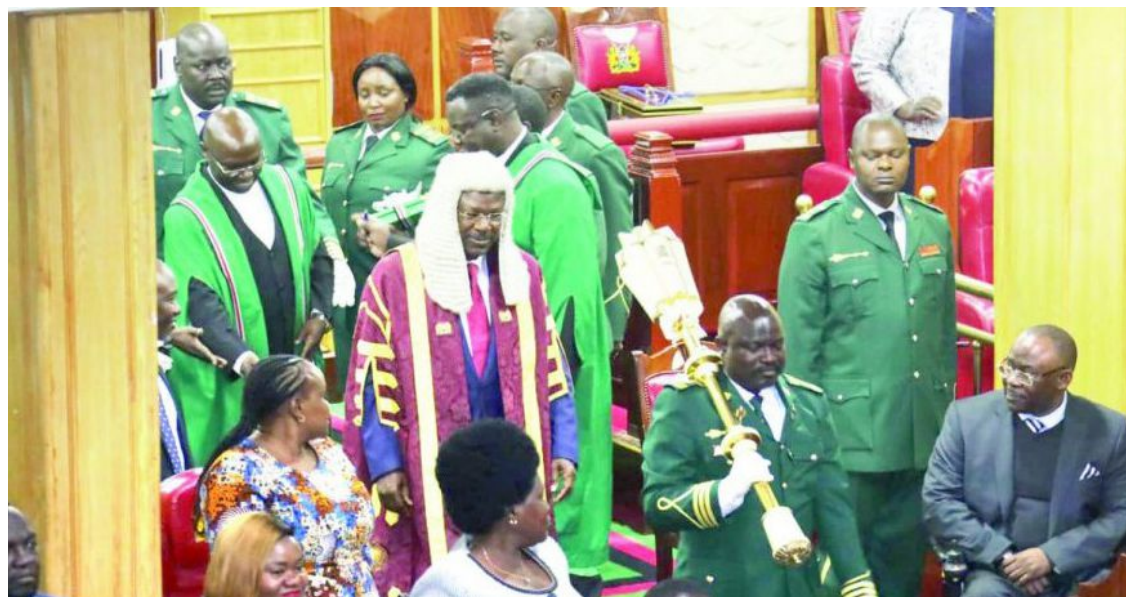
National Assembly Speaker, Rt. Hon. (Dr.) Moses Wetang'ula escorted by Sergeant-at-Arms makes his first entry to the Chamber following his election as Speaker last year.