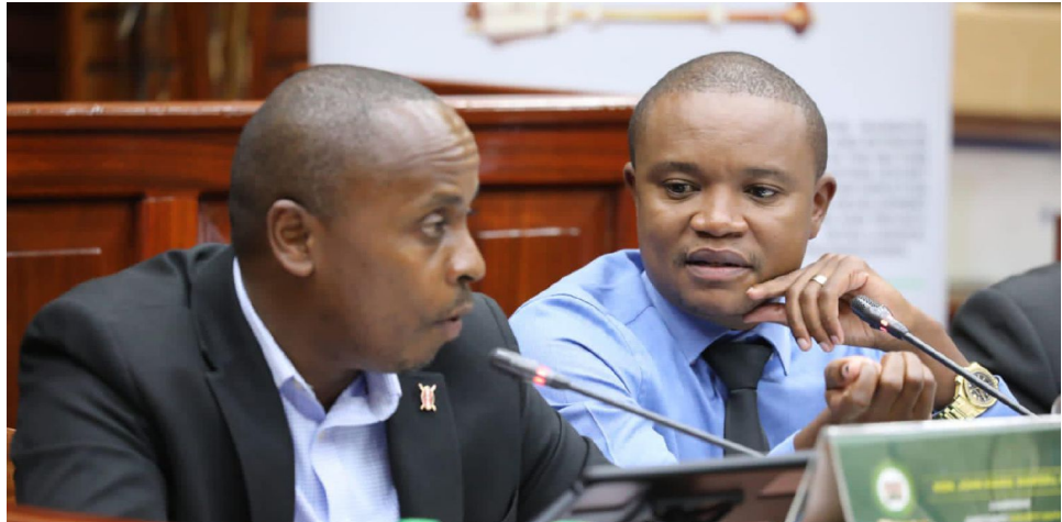
Co-Chairs of the joint sitting of Departmental Committee on Finance and National Planning and Committee on Communication, Information and Innovation Hon. John Kiarie (left) and Hon. Kimani Kuria (right), during a sitting.