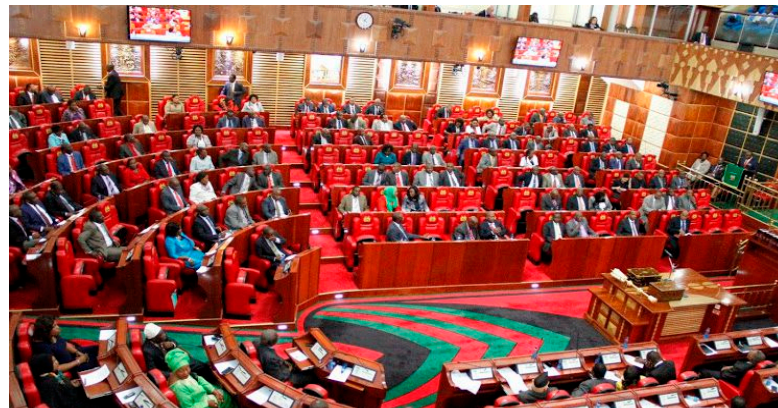
Members of the National Assembly at the main Chambers in Parliament Building, during a past House session

The legislators amended Standing Order 25(A) to allow a Cabinet Secretary to expound on government policy, reply to questions and provide reports concerning matters under his or her docket.