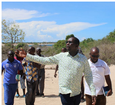
Blue Economy Committee Chairperson Hon. David Bowen (Marakwet East) engaging Fishermen at Kichwa Cha Kati fish landing site, Kilifi County

The National Assembly’s Departmental Committee on Blue Economy, Water and Irrigation led by its chairperson Hon. David Kangogo Bowen (Marakwet East) undertook an inspection visit of the Ngomeni and Kichwa cha Kati fish landing sites, where they also engaged the fishermen involved in the projects under the purview of the State Department for Blue Economy.