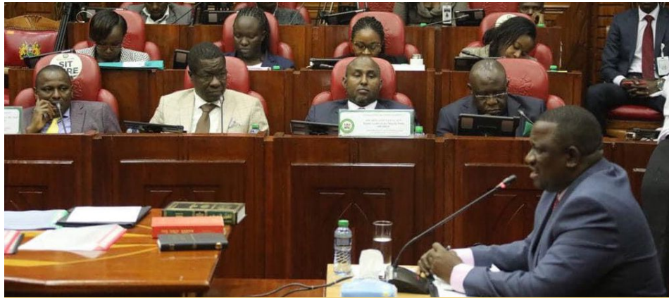
A sitting of the National Assembly Committee on Appointments during the vetting of Cabinet Secretary Nominee for Mining, Blue Economy and Maritime Affairs Mr. Salim Mvurya in October last year.

Wetang'ula was responding to concerns by Deputy Minority leader Robert Mbui who inquired to know whether CASs will continue appearing before House committees as it has been a practice where a majority of the Cabinet Secretaries have sent either the CASs or their Principal Secretaries (PS) to respond to questions on their behalf.