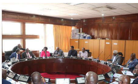
The Public Investments Committee on Commercial Affairs and Energy meeting with Kenya Forest Service officials.

The Committee sought to know why officers from KFS had approved and later awarded themselves imposts amounting to Kshs 1.7 million contrary to the finance manual of the service and the Public Finance Management (PFM) Act of 2012.