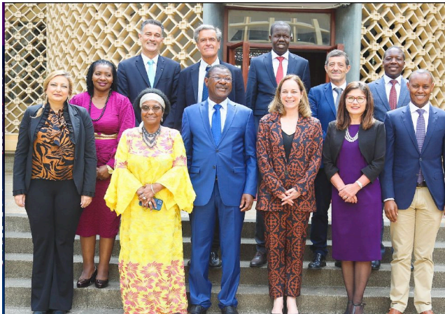
National Assembly Speaker, Hon. (Dr.) Moses Wetang'ula poses for a photo with a European Union Delegation at Parliament Buildings.