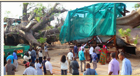
Members of the Environment, Forestry and Mining Committee inspecting uprooted Baobab trees awaiting exportation to Georgia at Boya yard in Kilifi County.

MPs further observed that the high electricity cost in Kenya has in the past seen investors relocate to other countries, including in the East Africa region and also denied the country new investments by foreigners. Cheap and reliable Electricity will ensure that investors set up their industries in our country and this will go a long way in ensuring the issue of unemployment is solved.