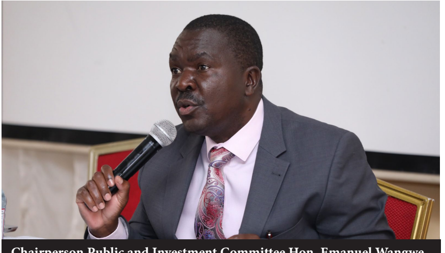
Chairperson Public and Investment Committee Hon. Emanuel Wangwe.