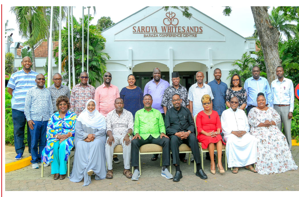
National Assembly Speaker Rt. Hon. (Dr.) Moses Wetang'ula (seated in a green shirt) poses for a photograph with Members of the Powers and Privileges Committee after officially opening a retreat for the Legislators in Mombasa recently.