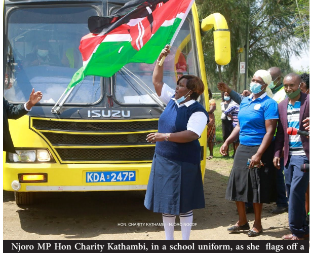
school bus she bought for one of the schools in her constituency using NG -CDF money recently.

"By putting on school uniform as an MP I intend to remind parents and children that education sometimes is a gruesome journey and life always entails making personal choices. However, education will get you through doors and open up