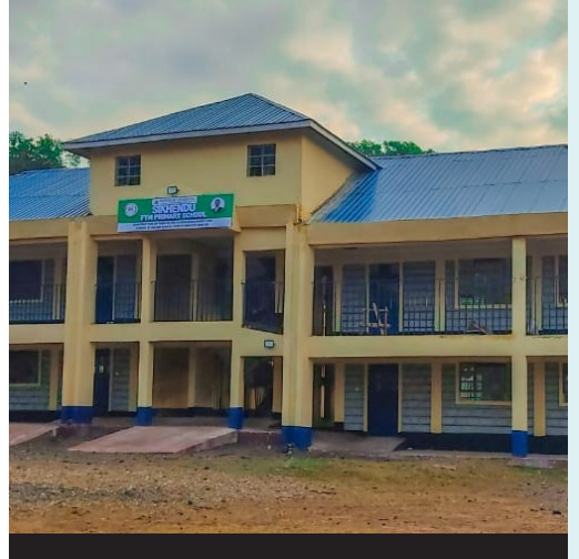
Eight modern classrooms constructed by NG-CDF money in Kimilili Constituency.