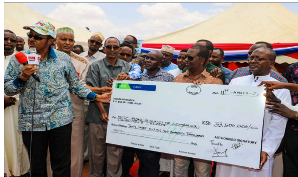
Eldas MP Hon. Adan Keynan during the issuance of bursaries to needy students in the constituency.