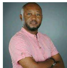
Kaloleni MP Hon. Paul Katana

Hon. Katana also asked the Ministry when it intends to classify Kaloleni Constituency as a hardship area in order to compensate public servants who serve in the region under adverse conditions.