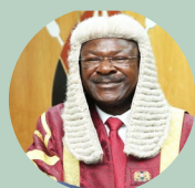
Hon. Wetang'ula, Speaker of National Assembly

"I have designated the place adjacent to the public servants bench on the right of the Speaker as the appropriate place in the Chamber where a Cabinet Secretary shall expound on government policy, reply to Questions