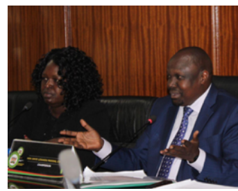
Chairperson of the National Assembly Public Investments Committee on Commercial Affairs and Energy, Hon. David Pkosing (centre) and Vice Chair Hon. Lillian Gogo during a meeting with officials from KFS.

"We are giving you two weeks to provide that evidence to this committee. We have to get to the bottom of this matter before we sit to draft a report," said the Chairperson.