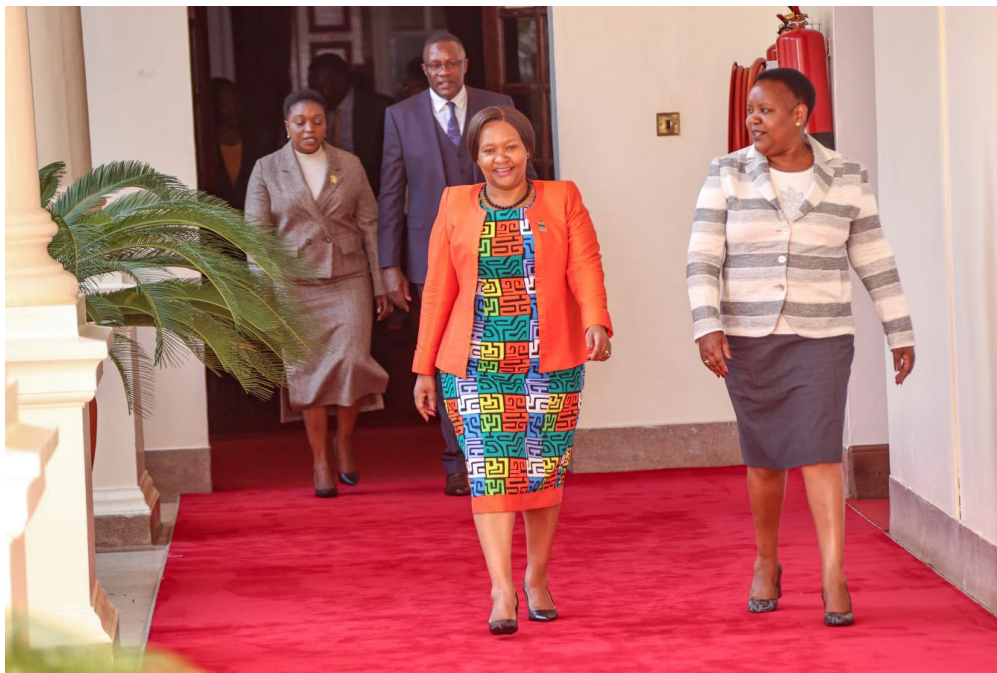
FRONT: Cabinet Secretary for East African Community, Arid and Semi-Arid Lands and Regional Development Rebecca Miano and Labour Cabinet Secretary Florence Bore. BEHIND: Health Cabinet Secretary Susan Nakhumicha Wafula and ICT and Digital Economy Cabinet Secretary Eliud Owalo.