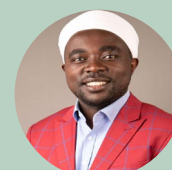
Hon. Erick Muchangi Chair Labour Committee

"Congratulations to the newly elected leadership of the 5th KEWOPA executive committee. Remember, leadership is not a person or a position it is a complex moral relationship between people based on trust, obligation, commitment, emotion, and a shared vision of the good."