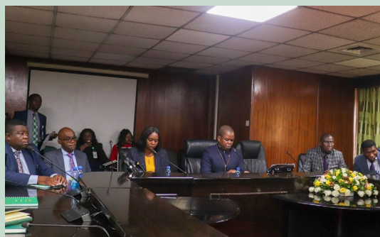
MPs from Zambian Parliament hosted by their Kenyan counterparts at Continental House.

The areas of interest for the Namibian delegation were to study the composition, powers, mandate, and functions of the Liaison Committee in the Kenyan National Assembly, acquaint themselves with the rules and procedures guiding the operations of the committees, be appraised of the practical interface of the committees with the House.