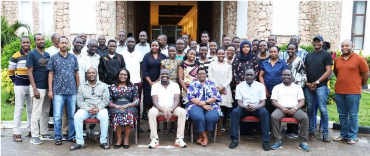
Officers from the Parliamentary Budget Office during a past retreat in Mombasa