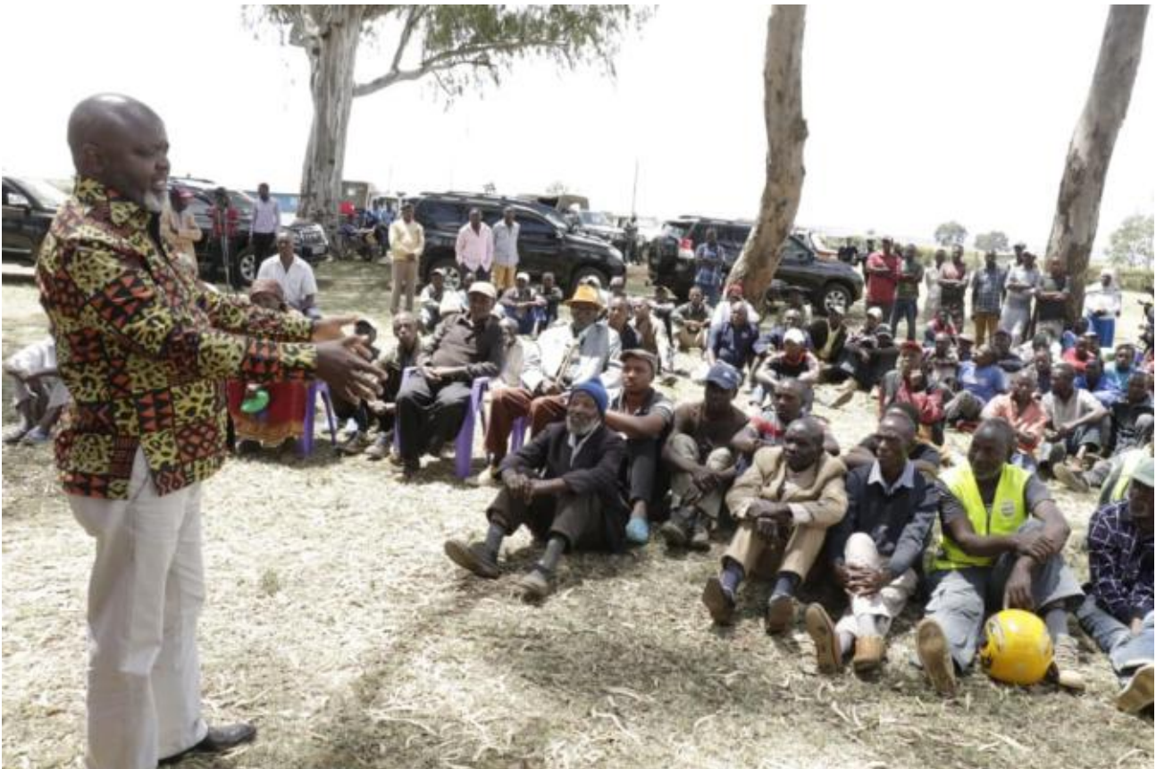
The Chairman of the Special Funds Accounts Committee addressing residents of Ngiwa Farm in Nakuru County

The directorate coordinates all activities, including travel and accommodation arrangements for itinerant Departmental Committees during benchmarking visits and attendance and participation in relevant International Conferences.