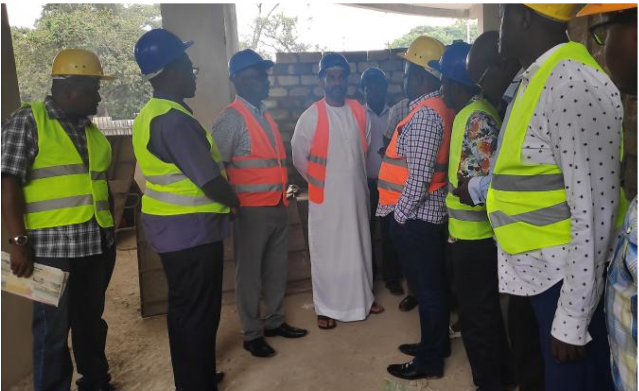
Members of Public Investments Committee inspecting the stalled construction of Kenya Maritime Authority office building

The Directorate of Departmental Committees Services liaises with Accounting Officers of Ministries, Departments and Agencies with regard to issues/inquiries before committees such as response to issues raised by the Auditor General, petitions, questions, regulations among others.