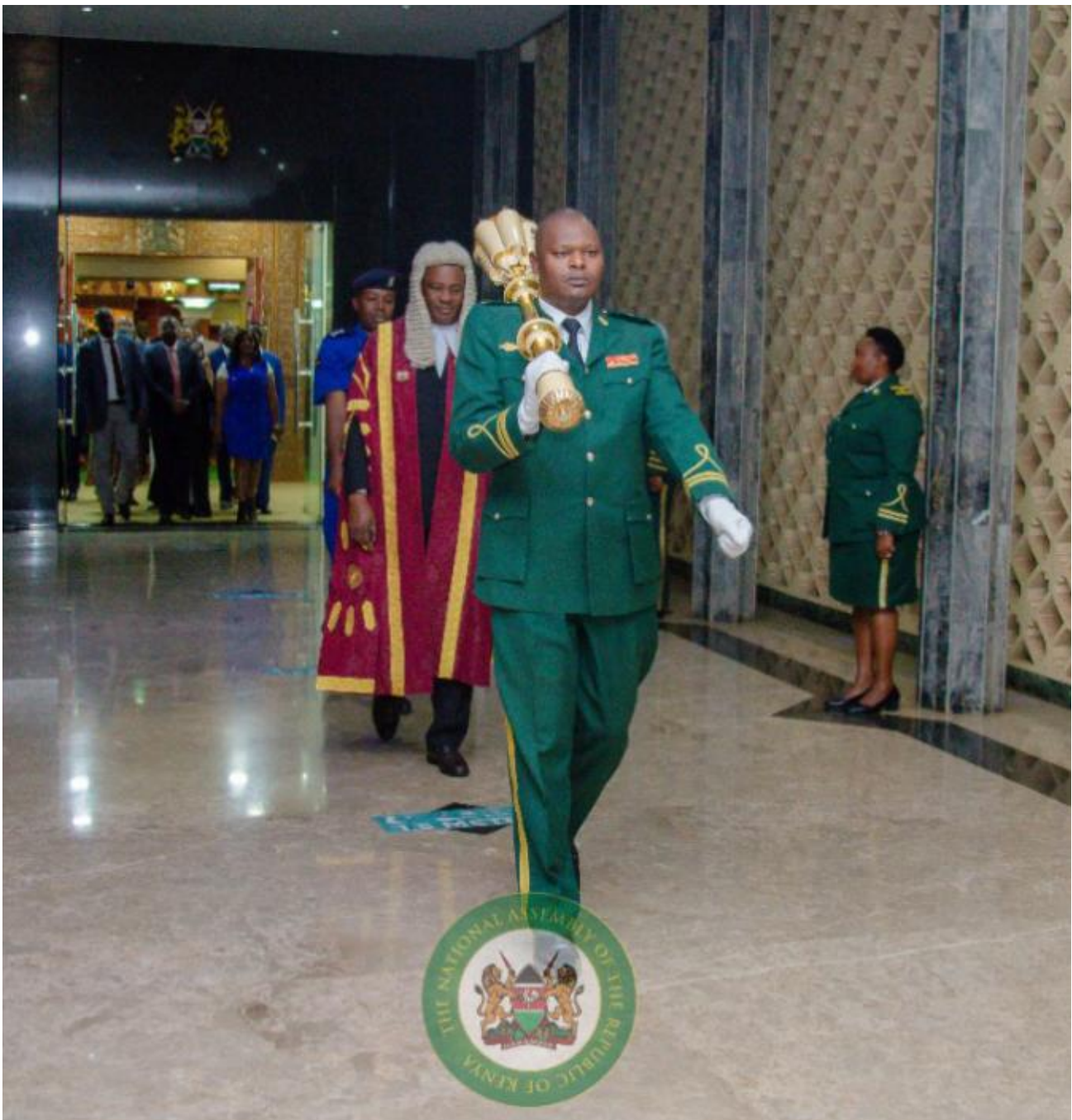
A Serjeant-at-Arms officer (carrying the Mace) leads the Speaker's procession during the last sitting of the National Assembly in the 12th Parliament.