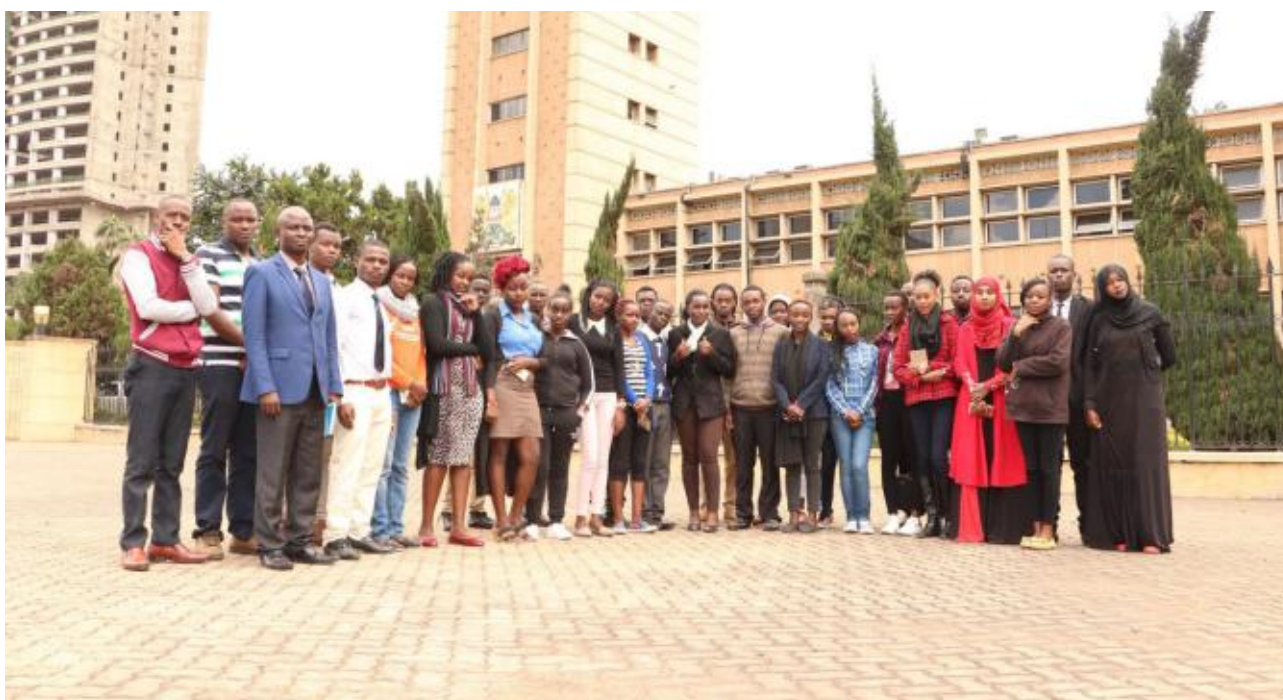
A group of university students tour the parliament grounds on an open day.

Schools wishing to bring pupils and students from the age of 6 to 18 to the National Assembly are welcome. The request may be placed through their respective Members of Parliament, or by contacting the Clerk of the National Assembly through the contacts provided in this Factsheet. The request should clearly indicate the name of the institution, proposed date of visit, as well as the number of pupils/ students and the accompanying staff.