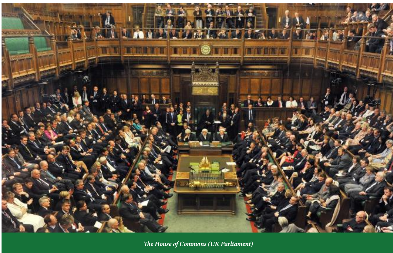
The House of Commons (UK Parliament)