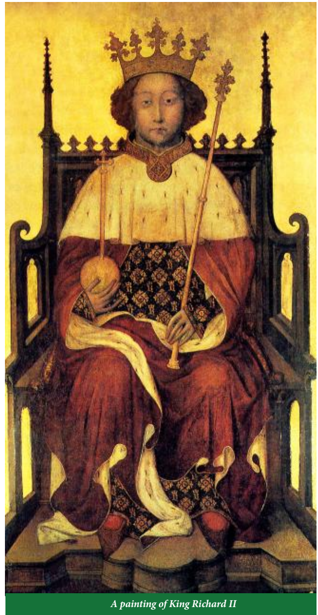
A painting of King Richard II

The need for Parliament to be granted powers and privileges was pursued so as to enable Parliament to effectively perform its functions without influence of the Monarchy. Parliamentary powers, immunities and privileges are granted to Parliament, collectively as an institution and to Members of Parliament in their individual capacity.