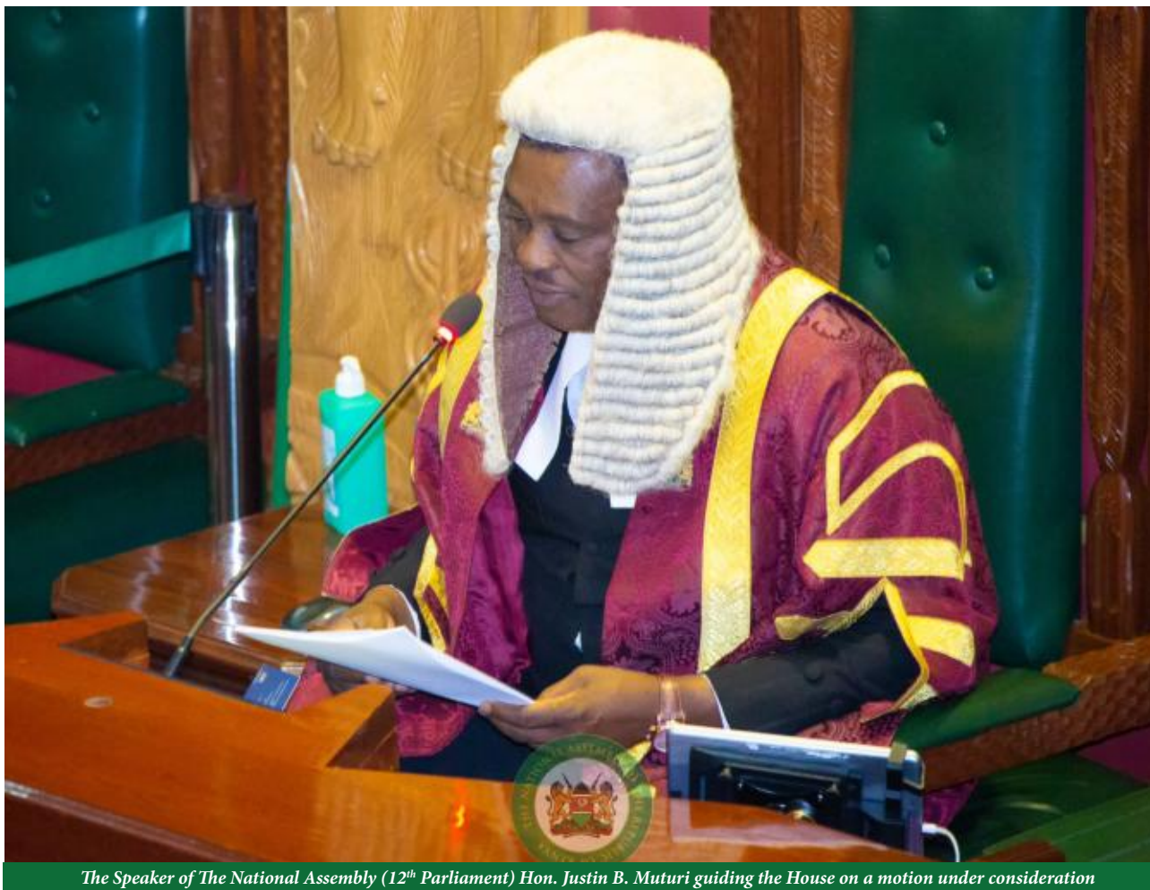
The Speaker of The National Assembly (12 th Parliament) Hon. Justin B. Muturi guiding the House on a motion under consideration

The Speaker may direct that a Motion will not be admitted if the Motion: