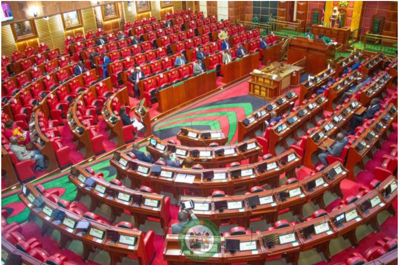
A sitting of the House in progress

Debates in Parliament are regulated by the Rules of Procedure which are formulated in accordance with Article 124 of the Constitution. For the orderly conduct of business before the House, Members are expected to observe the following aspects of debate -