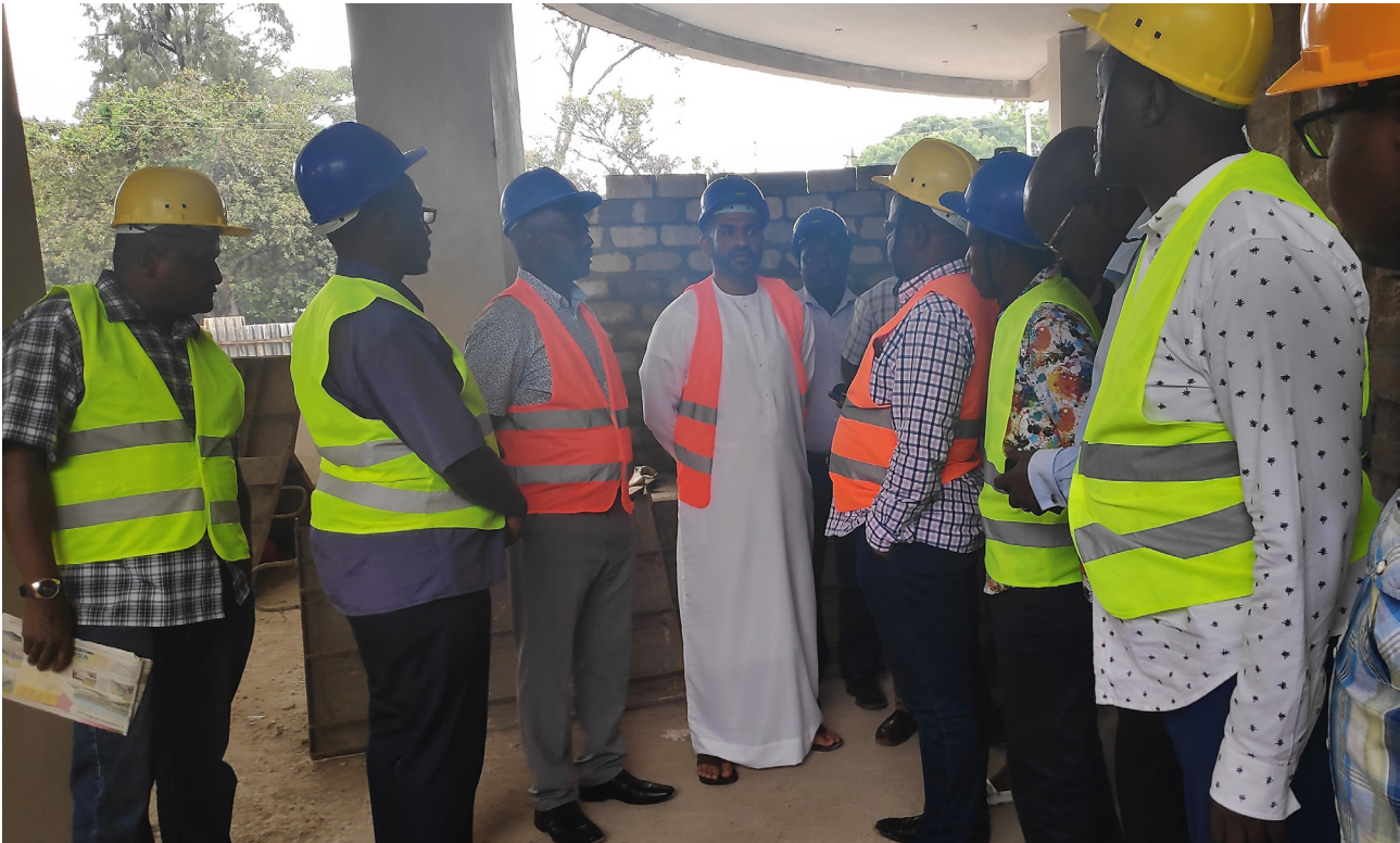
Members of Public Investments Committee inspecting the stalled construction of Kenya Maritime Authority office building