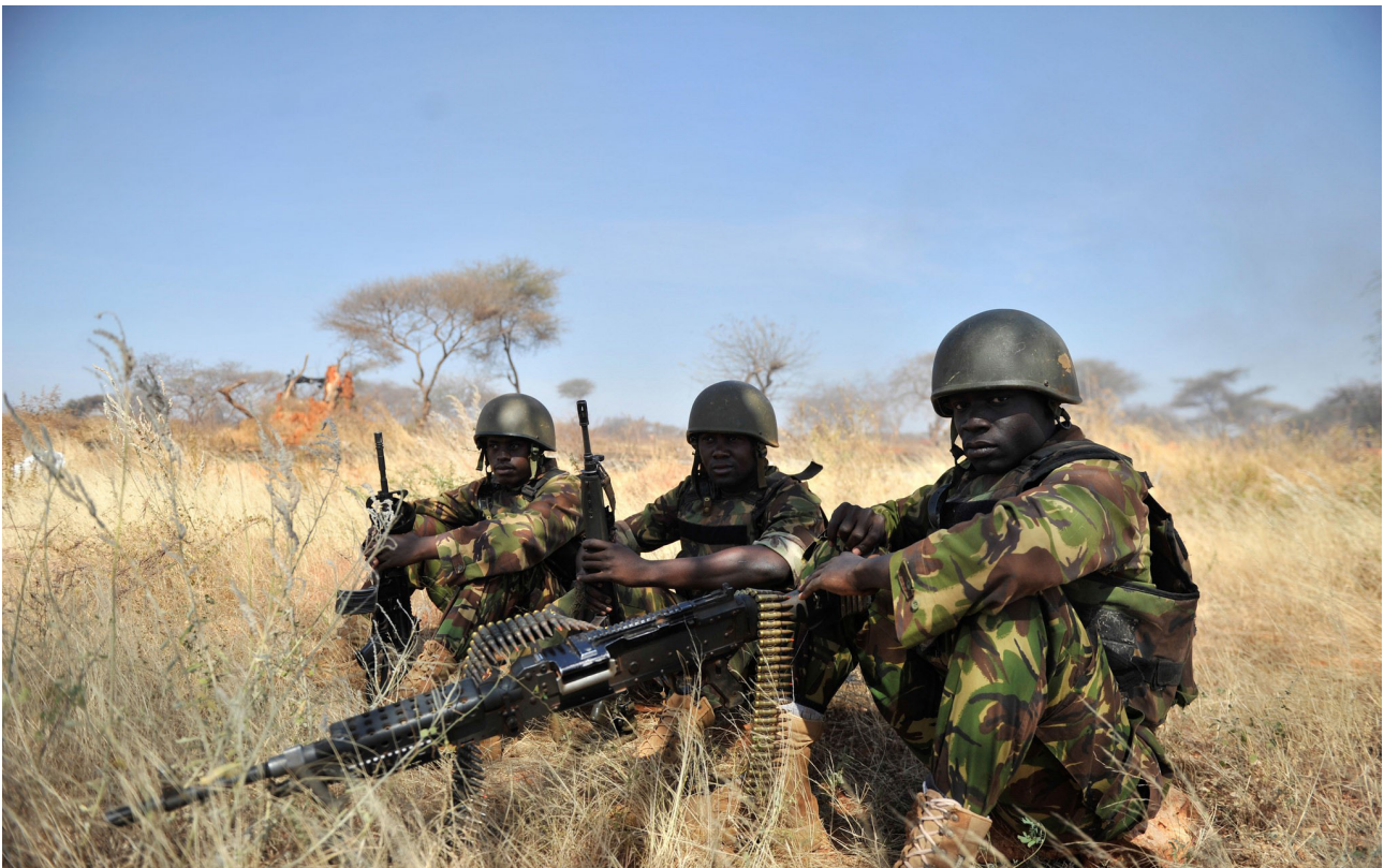
KDF Soldiers in Somalia

(2) deployment of the Kenya Defence Forces (KDF) for regional and international peace support operations and the deployment of foreign forces in Kenya;