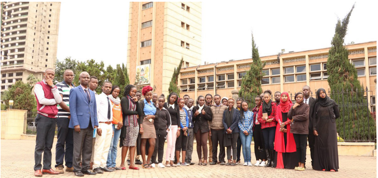
A group of university students pose for a picture in front of the parliament building after touring it on an open day

Articles 1, 10 and 118 of the Constitution make it mandatory for Parliament to conduct its business in an open manner, open up its sittings to the public and to facilitate the involvement/participation of the people in its legislative and other business. To this end, Parliament has put in place various measures to facilitate participation of the people. They include: