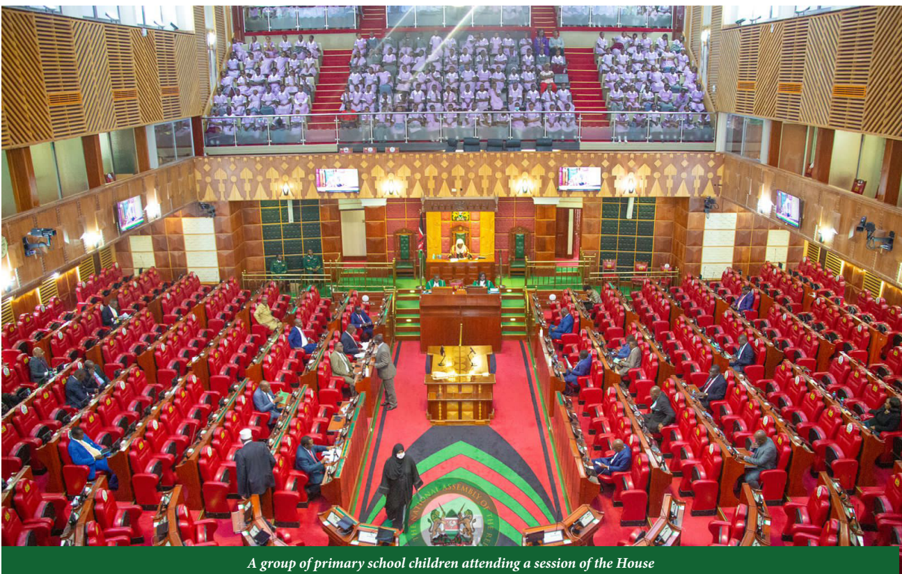
A group of primary school children attending a session of the House