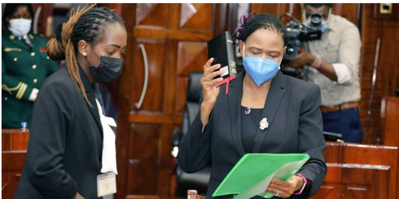
Chief Justice Martha Koome Martha Koome swears oath before her vetting session by Members of Parliament in The National Assembly.

Parliament holds the Government to account in a variety of ways: