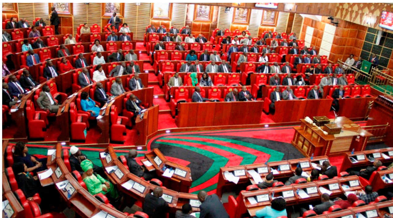
An ongoing session inside The National Assembly chamber

Debates in the House are guided by certain set of codified Rules known as the Standing Orders. In addition, best practices from other jurisdictions are at times applied in guiding debates and making decisions. The Rules allow flexibility for Members to move the House to debate matters of urgency that affect the electorate in order to resolve them urgently. Where the two Houses deem necessary, they may hold joint sittings to deliberate on matters of mutual interest within the mandates of the both Houses, including on Bills or Motions that require consideration by both Houses. In some cases, the Houses may resolve to form joint committees to consider matters of mutual concern.