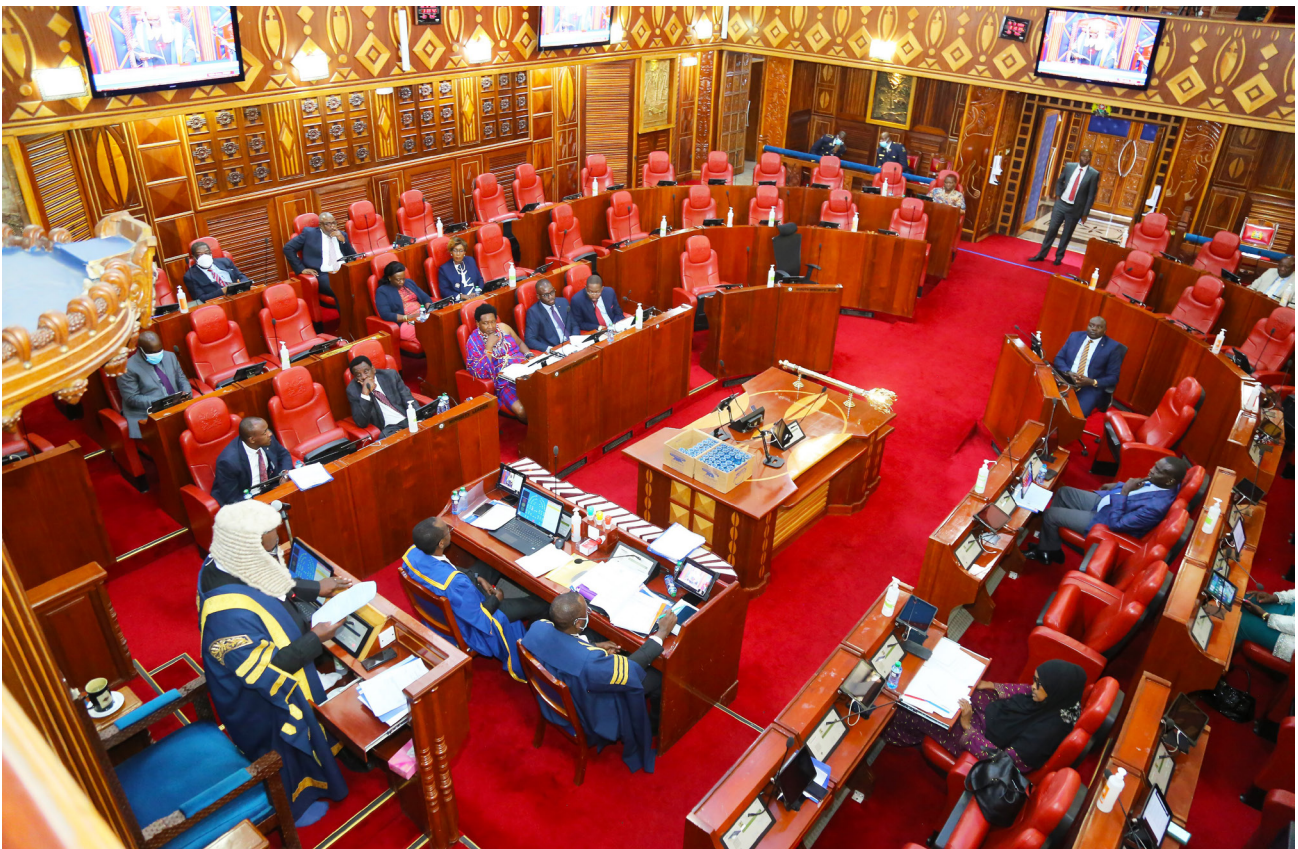
Inside the Senate chamber whilst in session

Article 96 of the Constitution provides for the functions and powers on the Senate in addition to the roles of Parliament espoused in Article 94. These specific roles are as follows: