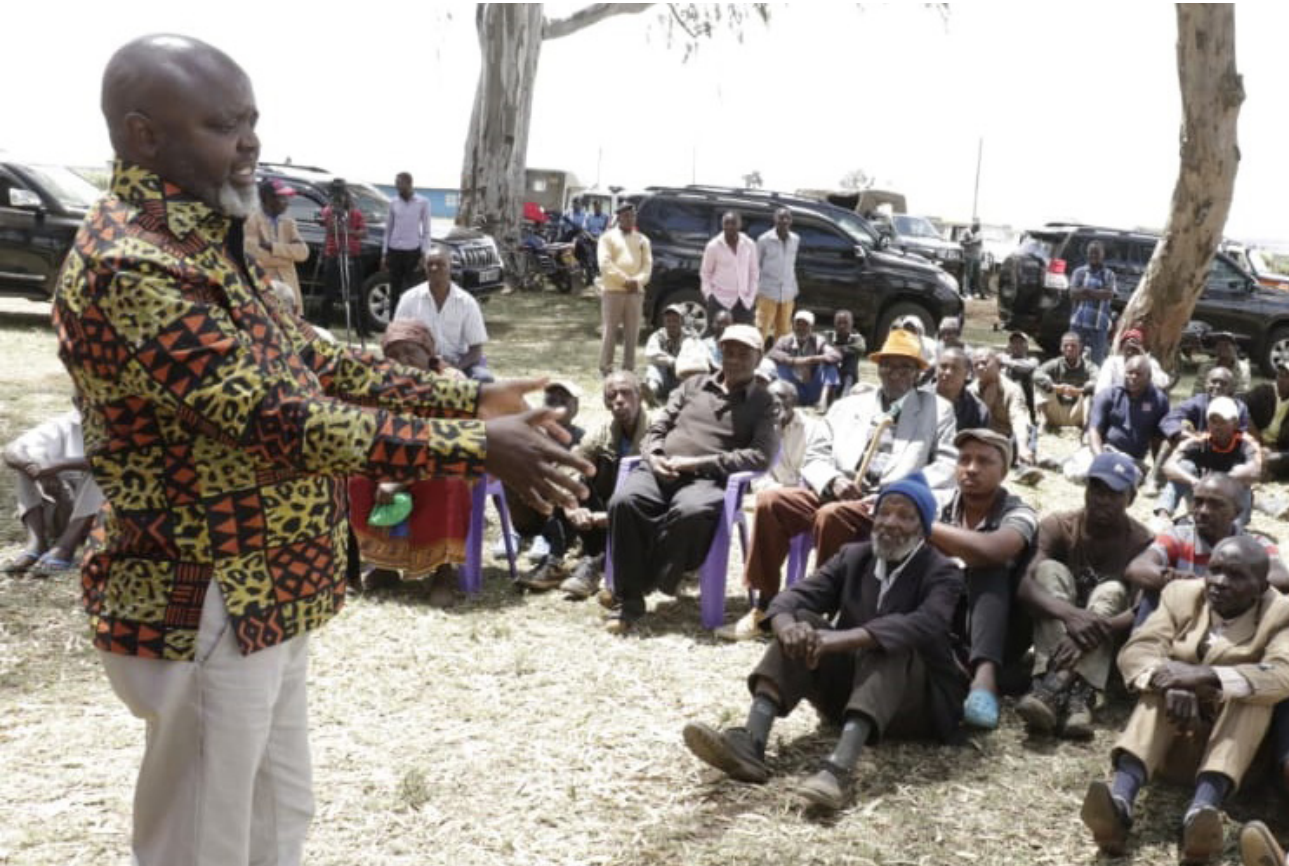
The Chairman of the Special Funds Accounts Committee addressing residents of Ngiwa Farm in Nakuru County

contentious matters, building consensus or common ground on divergent positions by different parties and enhancing the quality of parliamentary debate through reports submitted to the House on matters referred to them for review.