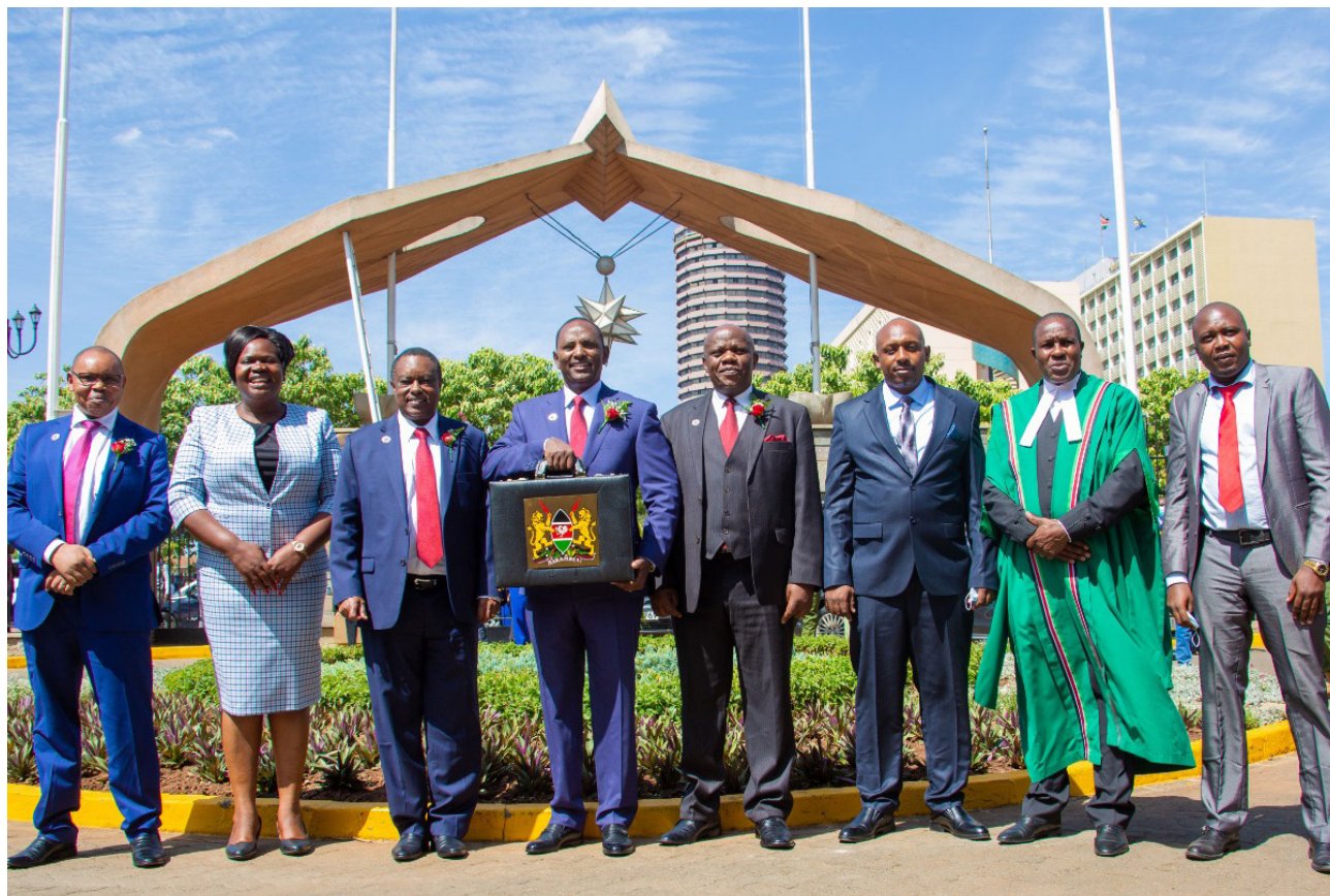
The Cabinet Secretary for National Treasury and Planning, Hon. (Amb) Ukur Yatani (holding briefcase) arrives in Parliament for the presentation of the 2020/2021 FY budget highlights.