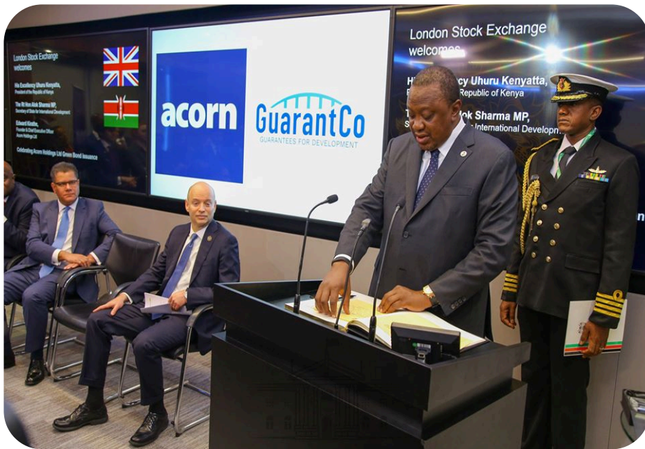
Figure 6: H.E. the President addressing the UK-Africa Summit