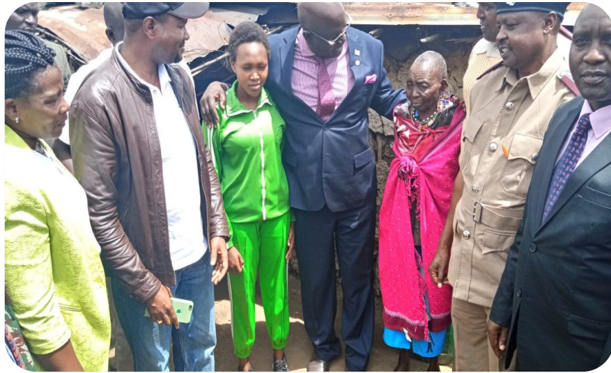
Figure 10: Education CS leading a campaign on 100% transition to secondary school