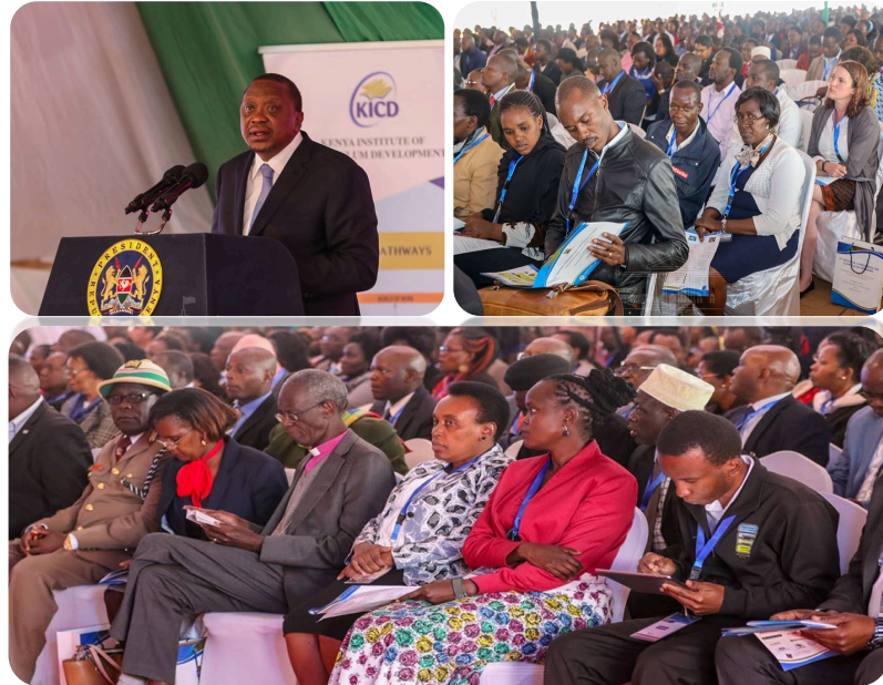
Figure 11: The 3 rd National Curriculum Conference