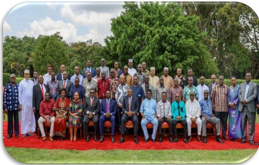
Figure 8: H.E. the President with Governors and Cabinet Secretaries during the 8th National and County Governments Coordination Summit at State House in February, 2020

of the ballooning public wage bill. The Summit resolved to among other things fast track the payment of pending bills in the counties, step up the fight against corruption, fast track finalization of the Disaster Risk Management and Digital Platform for Relief Assistance framework among others.