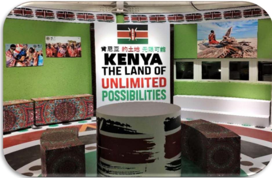
Figure 7: Kenya's pavilion at the 2019 horticultural expo in Beijing