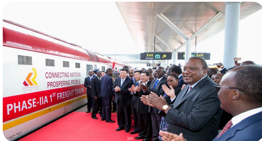
Figure 2: Launch of the SGR Phase IIA Nairobi-Suswa