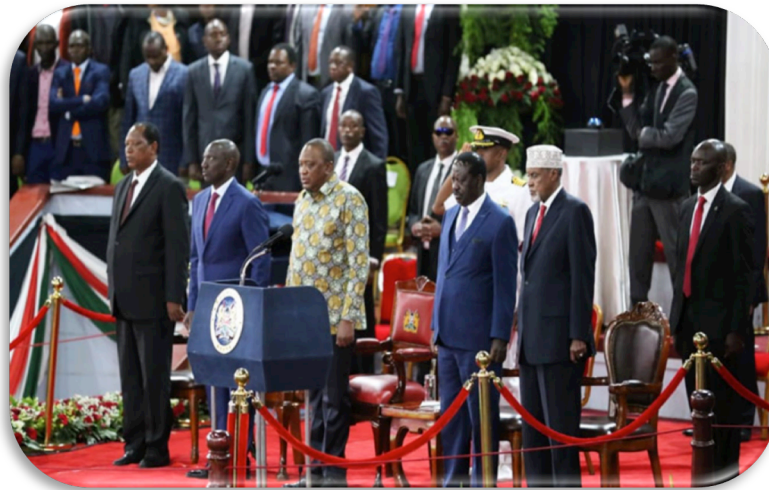
Figure 4: H.E. the President launching the BBI report

96. H.E. the President unveiled the Building Bridges Initiative (BBI) report in November, 2019 at the Bomas of Kenya. Following the launch, Government Press produced and distributed 5,000 copies of the BBI report to create public awareness.