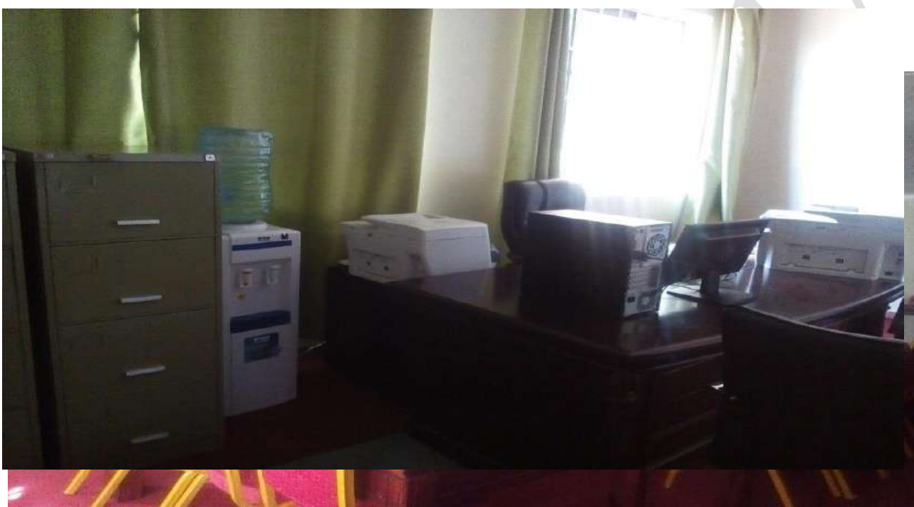
Figure 2: Office equipment

During the financial year 2017/2018 Mirangine Energy Centre was allocated Kshs.9,960,000 under development budget of which Kshs.4,478,060.00 was utilized to procure furniture, fittings and other office equipment necessary to operationalize the Training Facility as evidenced by LPO Nos. 1799295, 1799296 1799298 and 1799299. Some of the furniture and equipment procured and an underground water tank constructed are shown in the photos (Figures 1,2,3,4,5) below: Figure 1: Furniture in the conference hall