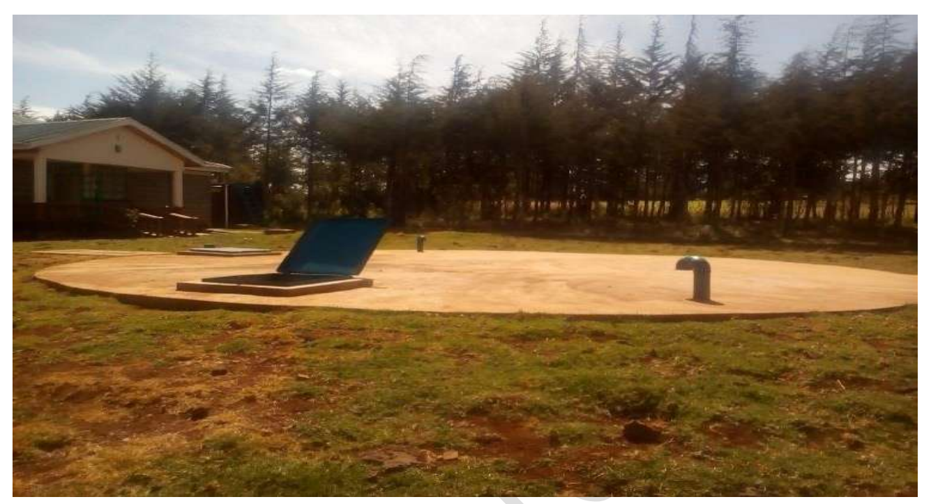
Figure 2: Underground Water Tank

In the budget for the current financial year, 2018/2019, Kshs.1.8 million has been allocated to Mirangine Energy Centre for procurement of remaining supplies including kitchen items.