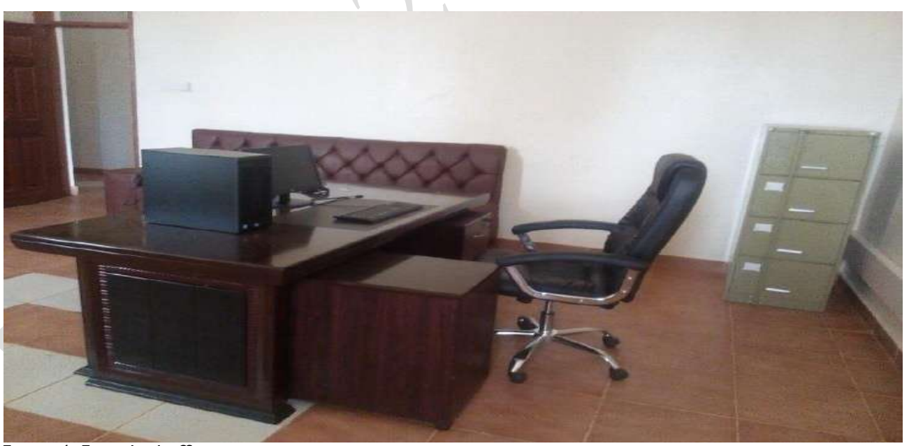
Figure 4: Furnished office