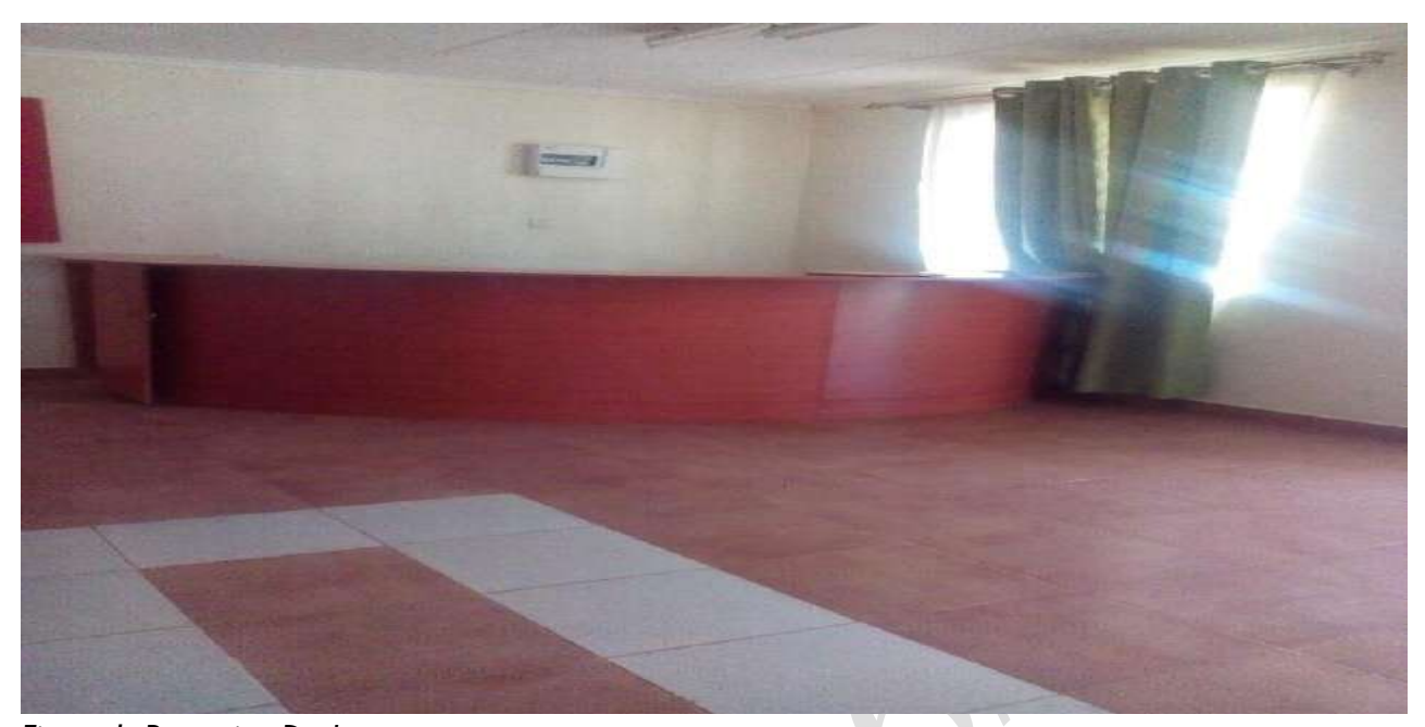
Figure 1: Reception Desk