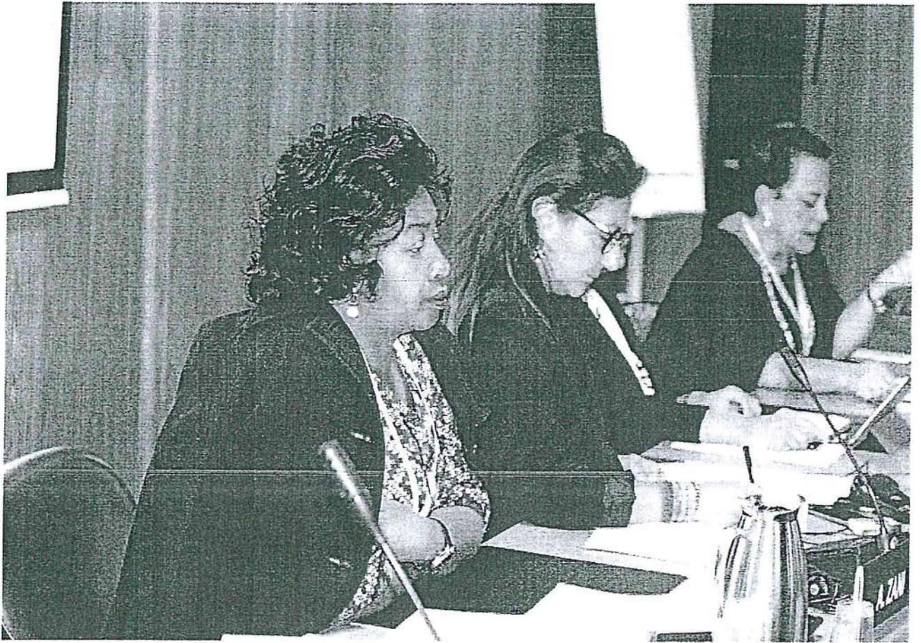
Photo 5 showing Senator ( Dr.) Agnes Zani presenting Kenyas position on statelessness with particular reference to the Makonde Community. This was during the open briefing session of the Committee to Promote Respect for International Humanitarian Law on Ending Statelessness by 2024