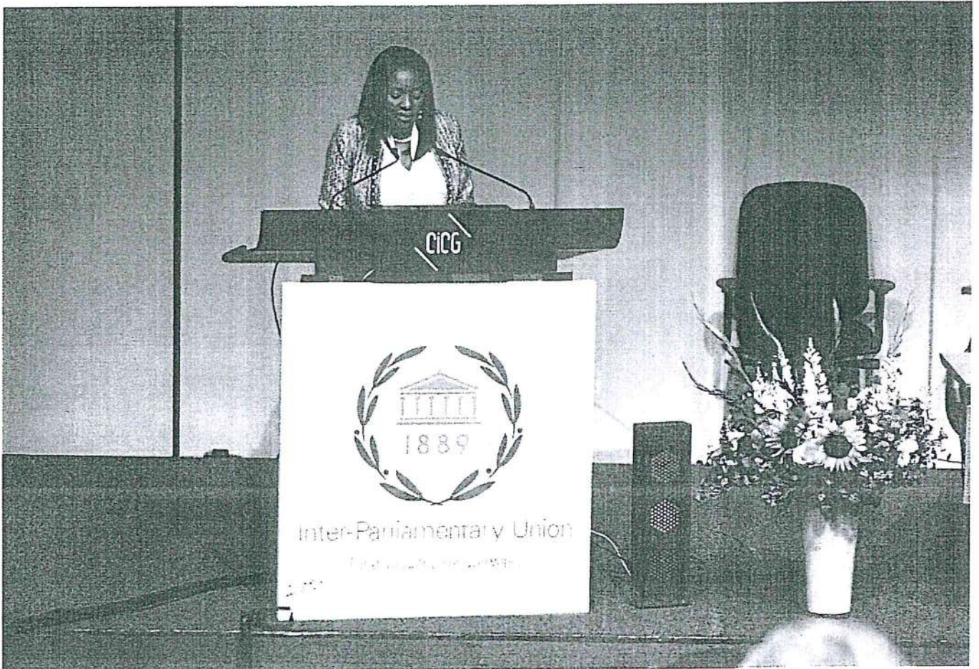
Photo 7 showing Senator Susan Kihika (President of the FWP) offering her insights following her ascension to the Presidency till April 2022. The FWP is a unique entity that has led the IPU political work to redress the gender imbalance in political representation in national Parliaments for the last 30 years.