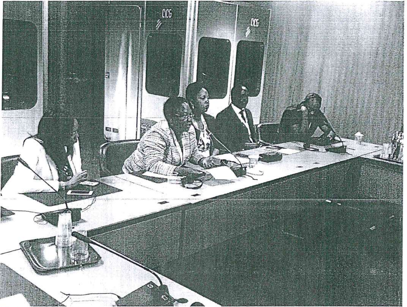
Photo 8 showing Hon. Joyce Emanikor giving her contributions during the Side event on Legislating on Food and Nutrition. Others are Sen.Susan Kihika; Hon. Haika Mizighi; Hon. Kangogo Bowen and Hon.Charles Njagua. Hon. Emmnauel Wangwe represented Kenya's position on legislating on food and nutrition.