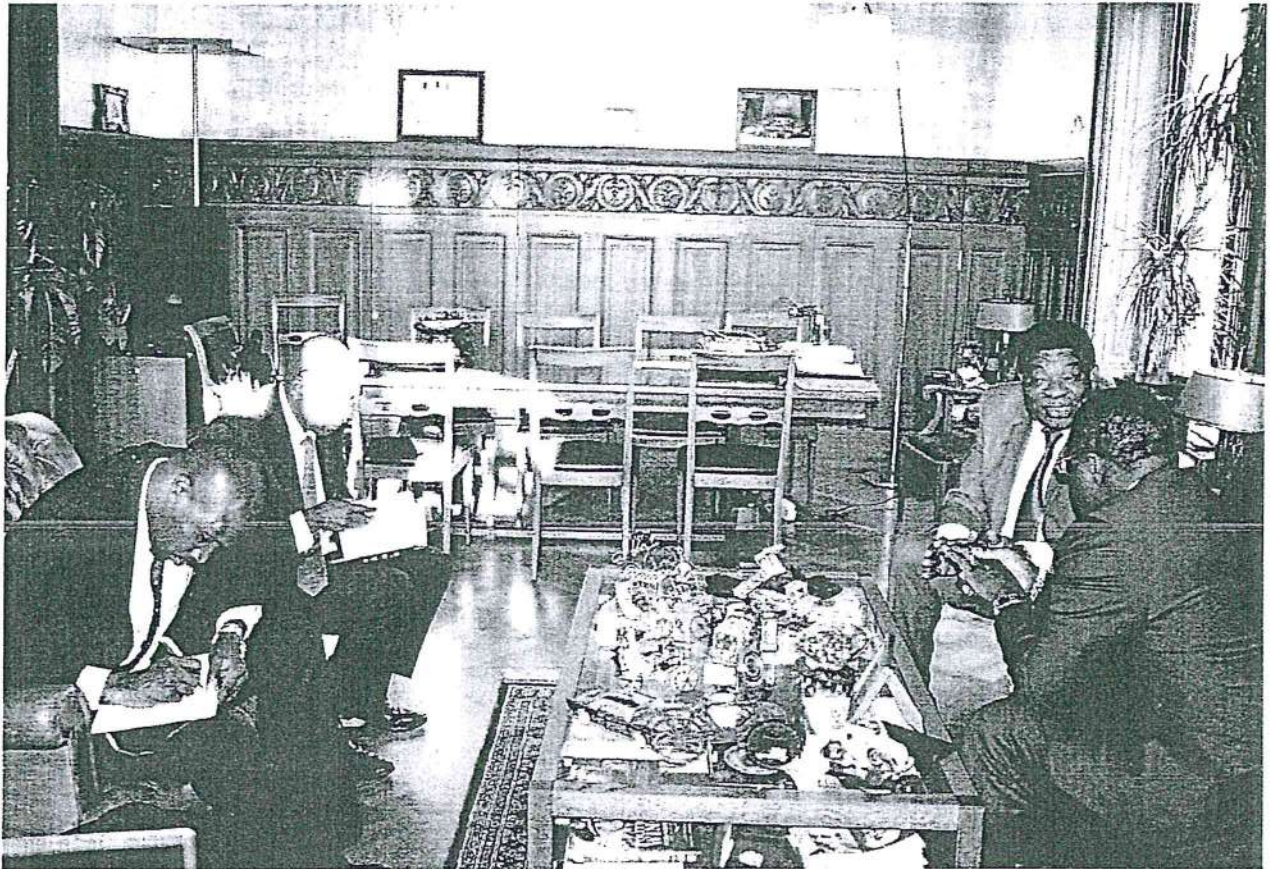
Photo 1 showing the Rt.Hon.Sen. Kenneth Lusaka, Speaker of the Senate, calling on the Secretary- General of the IPU, Martin Chungong where they underscored the the critical role of Parliaments and MPs in achieving the Sustainable Development Goals (SDGs).