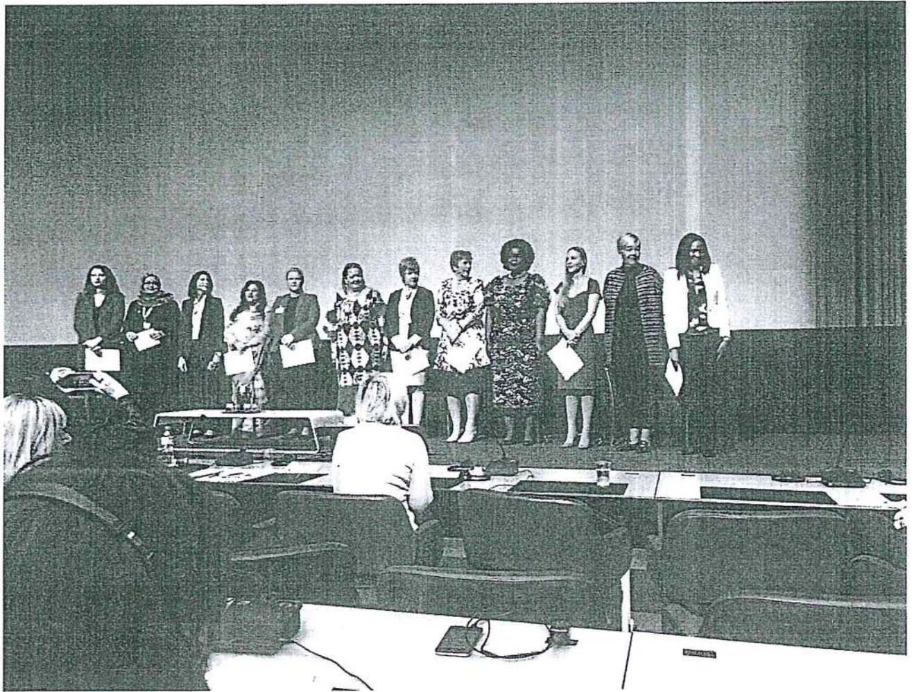
Photo 4 showing the Sen. Susan Kihika (President of the Forum of Women Parliamentarians) attending the Side event 'Where do Parliaments stand in the fight against sexism and harassment?' She was among 11 other delegates who enacted the voices of women Parliamentarians interviewed during a study on violence against women Parliamentarians in Europe.