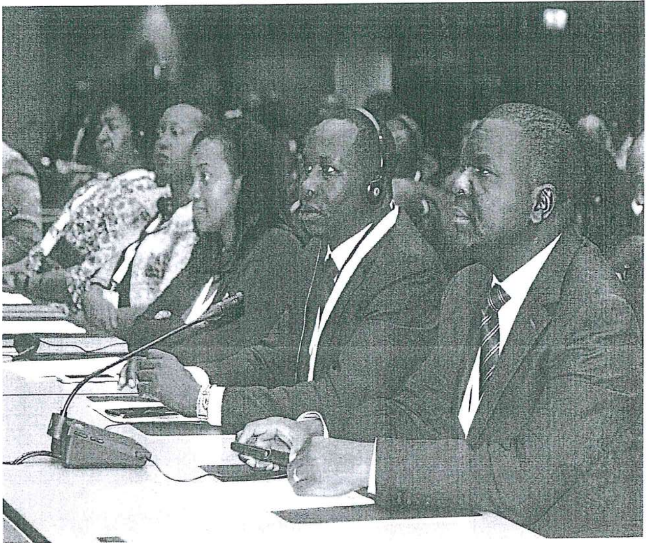
Photo2 showing the Kenya delegation ( from left, Sen.(Dr.) Agnes Zani; Hon. Lydia Haika; Sen. Susan Kihika, Sen. Kangogo Bowen, Hon. Emmanuel Wangwe ) at the African geopolitical group where the 'African position' on various issues under discussion at the 139 th IPU were agreed to.