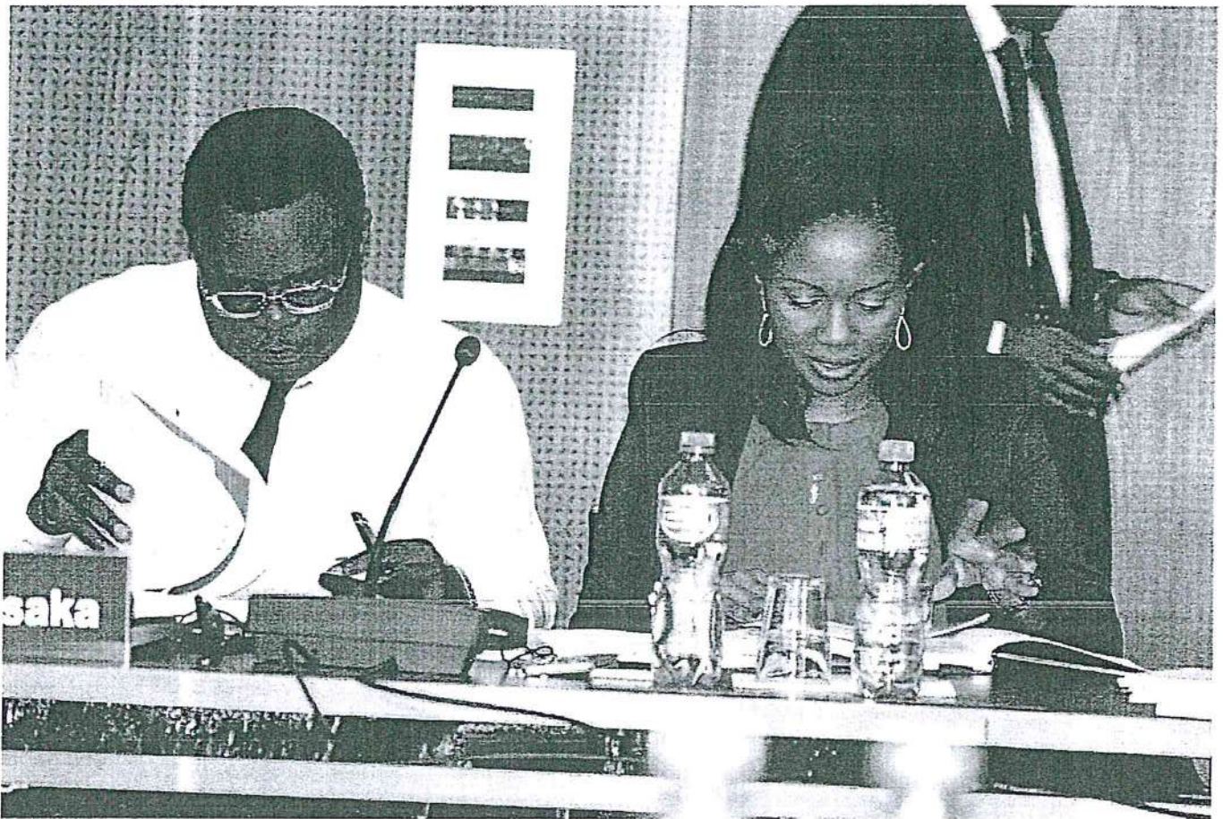
Photo 6 showing the Rt. Hon. Kenneth Lusaka ( Speaker of the Senate) and the Sen.Susan Kihika ( President, the FWP) at the Gender Partnership Group (GPG). The Speaker represents the African Geopolitical Group in the Executive Committee and hence his nomination to the GPG while the latter represents the Bureau of Women Parliamentarians by virtue of her Presidency.