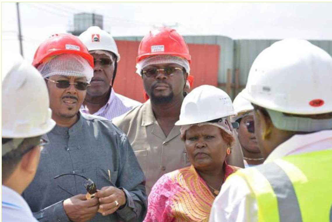
The Public Investments Committee undertaking a site visit of KPC Construction works

whose estimates are being examined, appear before the committees.