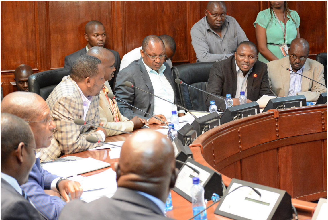
A Sitting of Committee of the House in progress

responsibility equal to service in the House.