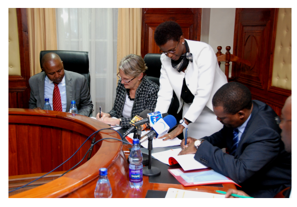
Parliamentary Service Commission Signs an MoU with UNITAR